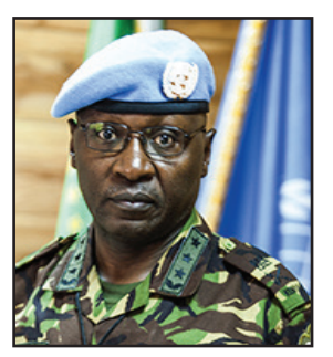
Lieutenant General Leonard Ngondi (Kenya) Force Commander