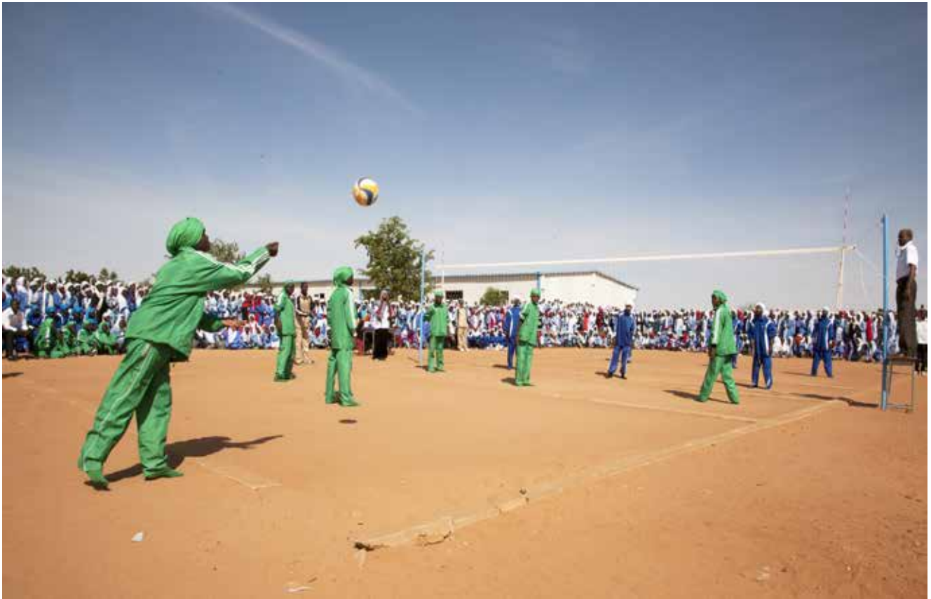
UNAMID Police- Sector North organized a women's volley ball tournament in Abu Shouck Camp for internally displaced persons in El Fasher, North Darfur. Four Secondary Schools Girls participated in the competitions on 23 October 2014, El Fasher.

platforms, young people can contribute towards and participate in Darfur's peace process, while networking, improving their health and benefiting from alternative recreation. In some cases, their participation has paid off, evolving into fully-fledged careers, that become sources of livelihood for the youth.