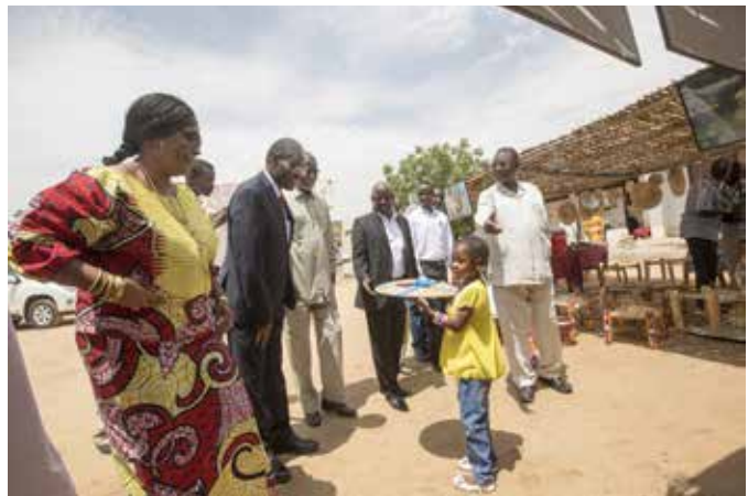
UNAMID's Communications and Public Information Section, in collaboration with the Ministry of Culture and Information, organized a photo exhibition, Darfuri village, cultural performances and a workshop from 20 to 21 September. The event also included a competition in which artists depicted peace through their paintings.

Nabi, expressed the Government of Sudan's commitment to achieving lasting peace, particularly in Darfur. He cited initiatives such as the weapons collection campaign as part of government efforts to bring stability to the region, as well as maintain justice and rule of law.