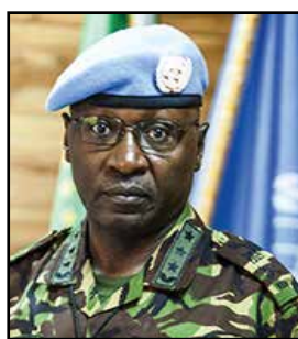
Lieutenant General Leonard Ngondi (Kenya) Force Commander