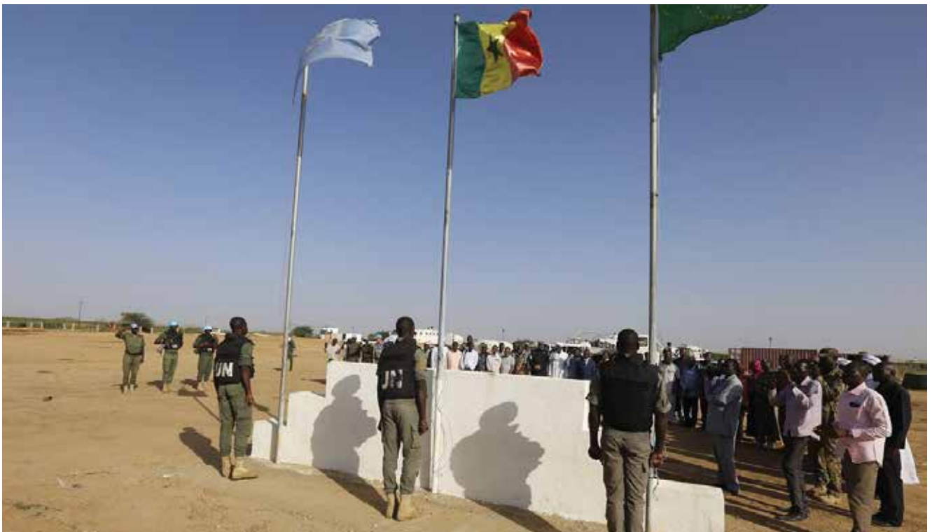
On 08 October 2018, UNAMID officially handed over the Mission’s team site in El Sereif, North Darfur, to the Government of Sudan. The handover, attended by government officials and UNAMID representatives, is part of the Mission’s ongoing reconfiguration as mandated by UN Security Council Resolution 2429.

United Nations Security Council Resolution (UNSCR) 2429 (2018) has called for the closing of ten Team Sites across Darfur as part of the Mission’s reconfiguration