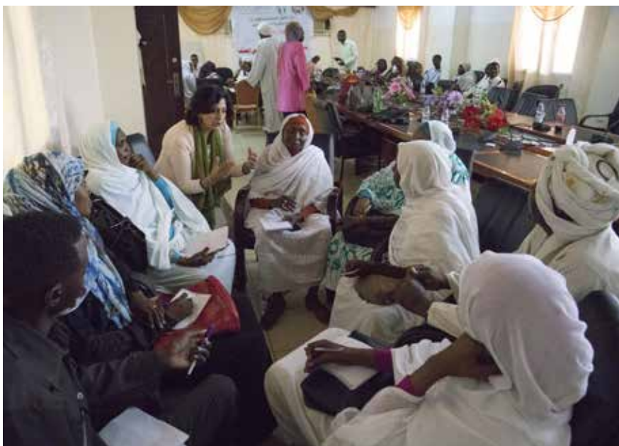
Some 43 participants, including 11 men from Government offices, Ajaweed council and civil society organizations as well as members of UN Security Council Resolution 1325 State Committee and Gender Mediation Network, attended from 1 to 2 August, a workshop supported by UNAMID's Gender Advisory Unit (GAU) in El Fasher, North Darfur.