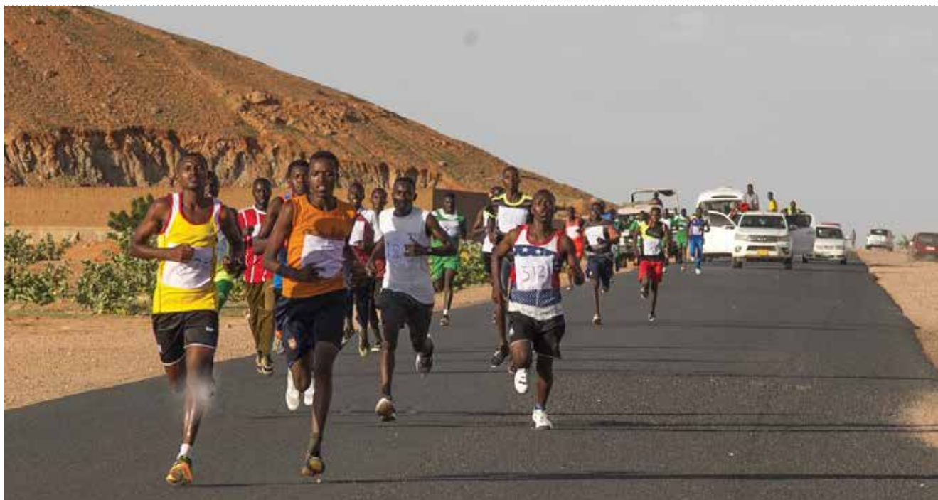
UNAMID's Communications and Public Information Section, in partnership with the Ministry of Youth and Sport and the National Federation of Sudanese Youth, joined the rest of the world in commemorating the International Youth Day in El Fasher, North Darfur on 12 August 2018, through a series of cultural and sporting events, held under the theme: "Safe Spaces for Youth".