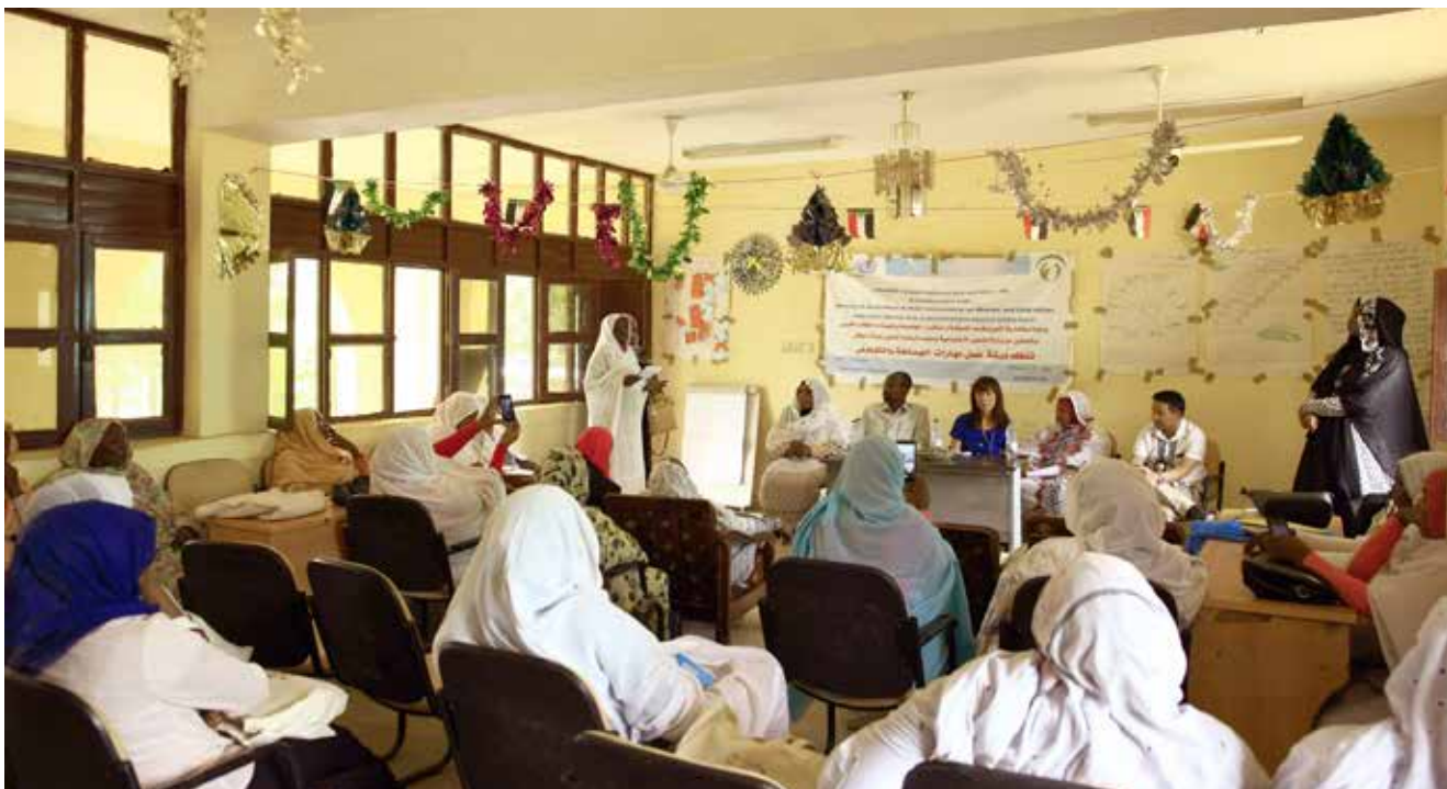
UNAMID, in partnership with the Ministry of Social Affairs, recently concluded a three-day workshop on mediation and negotiation skills for 30 participants in El Geneina, West Darfur. The workshop aimed to enhance women's capacity to contribute more effectively to peacebuilding and reconciliation initiatives in their communities.

UNAMID , in collaboration with the State Ministry of Social Affairs and the Commissioner for Women and Child Affairs, on 27 June 2018 concluded a three-day workshop on mediation and negotiation skills for 30 participants in El Geneina, West Darfur. Organized by UNAMID's Gender Advisory Unit (GAU) and Governance and Community Stabilization Section (GCSS), the workshop aimed to equip women with mediation and negotiation skills to enable them to contribute more effectively towards peacebuilding and reconciliation initiatives in their communities.