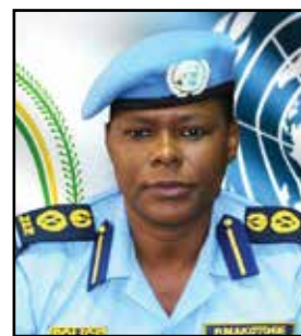
Priscilla Makotose (Zimbabwe) Police Commissioner