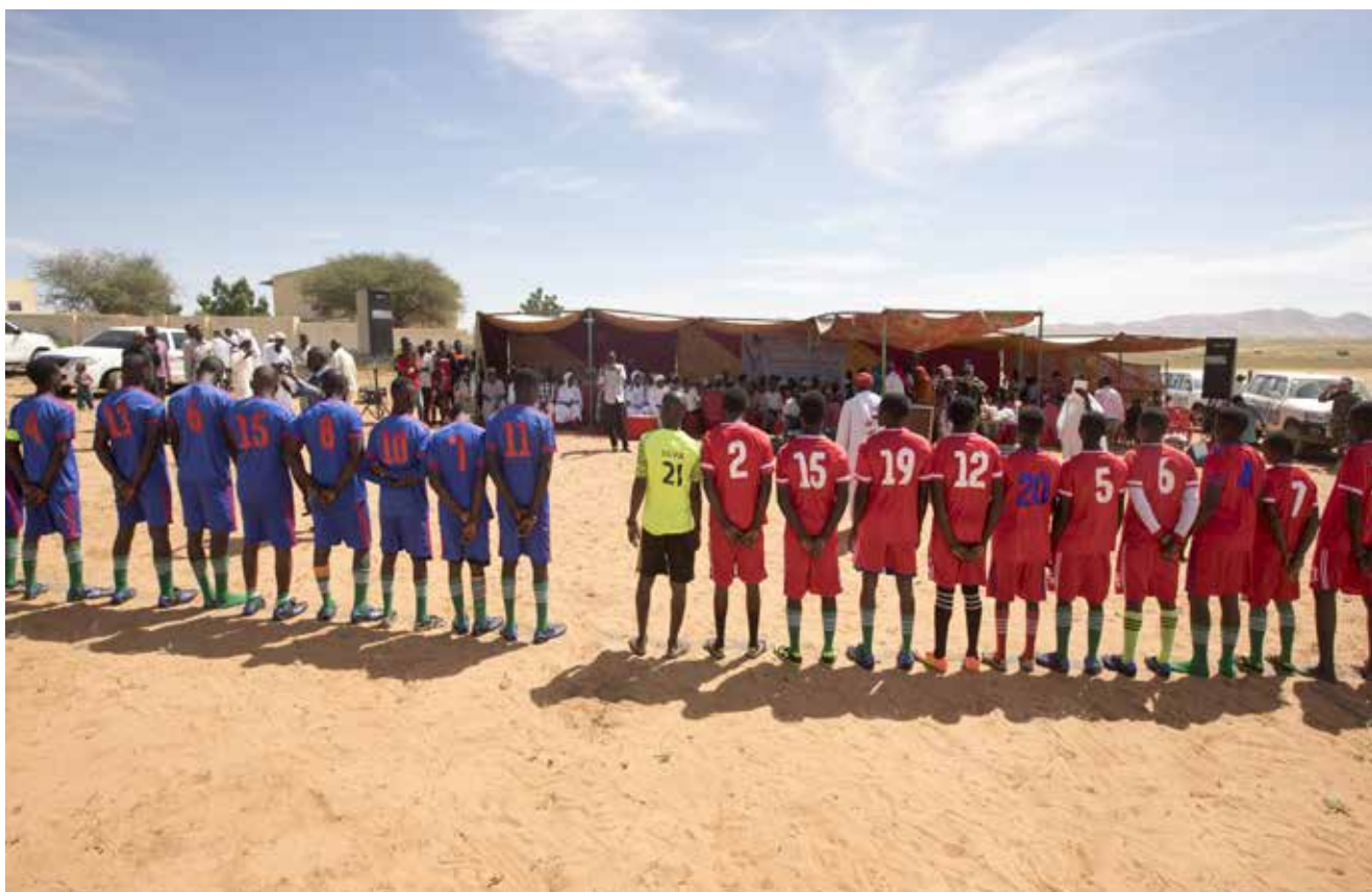
UNAMID's Communications and Public Information Section (CPIS), in partnership with the National Federation of Sudanese Youth, organized a football tournament in Sewilinga village near El Fasher, North Darfur. The event aimed to promote peaceful coexistence among the local community in the area as part of the "Together for Peace" campaign on 15 October 2018.

ment, which took place at Abou Shouk IDP camp in El Fasher under the theme: "No Life Without Peace." Organized by UNAMID and the Abou Shouk Sport and Culture Association, the event included an Iftar (evening breaking of Ramadan fast) attended by hundreds of youth, community leaders and school children.