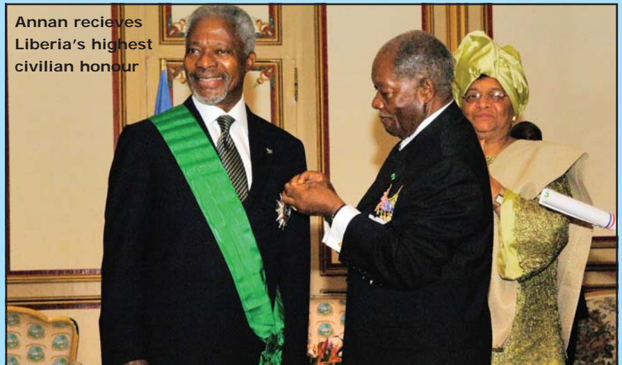
Annan receives Liberia's highest civilian honour