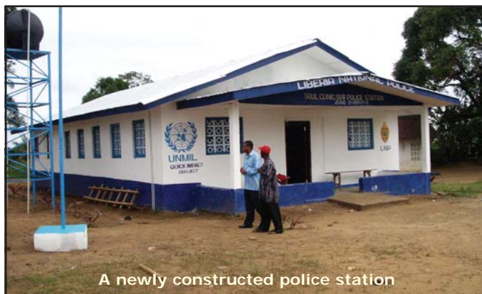
A newly constructed police station

services of 18 qualified Liberian lawyers as public defence consultants for six months to strengthen the capacity of the public defence system as well as to represent indigent defendants charged with criminal offences in the circuit courts but who cannot afford to hire lawyers to represent them.