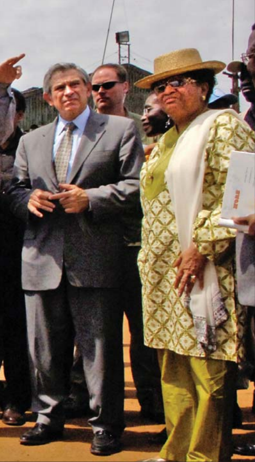
Paul Wolfowitz with President Johnson-Sirleaf at Monrovia's Free Port

overnight and cannot be achieved by one individual, he stressed, and encouraged the legislators to ensure that every tax dollar is spent in the wisest, most responsible way.