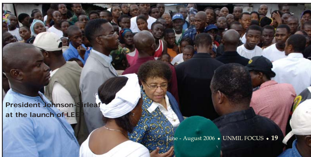
President Johnson-Sirleaf at the launch of LEEP