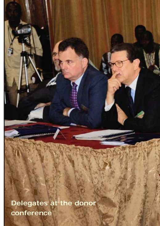
Delegates at the donor conference

Johnson-Sirleaf presented a clear answer to that question. She outlined her government’s development priorities in the coming months and years, portraying the stark realities of the country’s socio-economic situation. She said her administration aims to complete the security sector reform by restructuring the national army and police to protect the nation and the people, to reverse the situation where 85 per cent of the population is illiterate and only 5 per cent of the 300 pre-war health facilities are operational, and to improve the livelihood of the people by rehabilitating national road networks, restoring electricity and running water and giving finan-