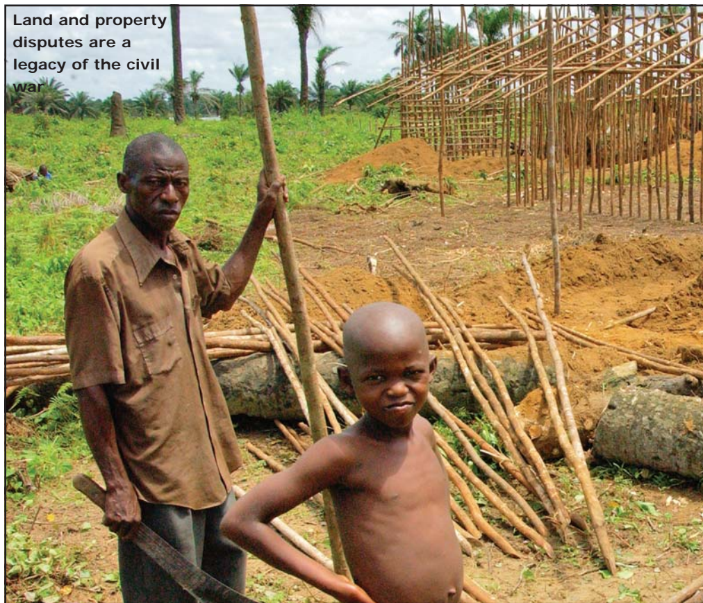
Land and property disputes are a legacy of the civil war

Before they return home, Liberian refugees are briefed on LPCs and what to do if they discover that their land or property had been occupied. “Together with other partners, we ensure that returnee rights to re-occupy and have access to property are respected and we ensure that no returnee is deprived of his or her property,” a senior UNHCR official explains. ♦