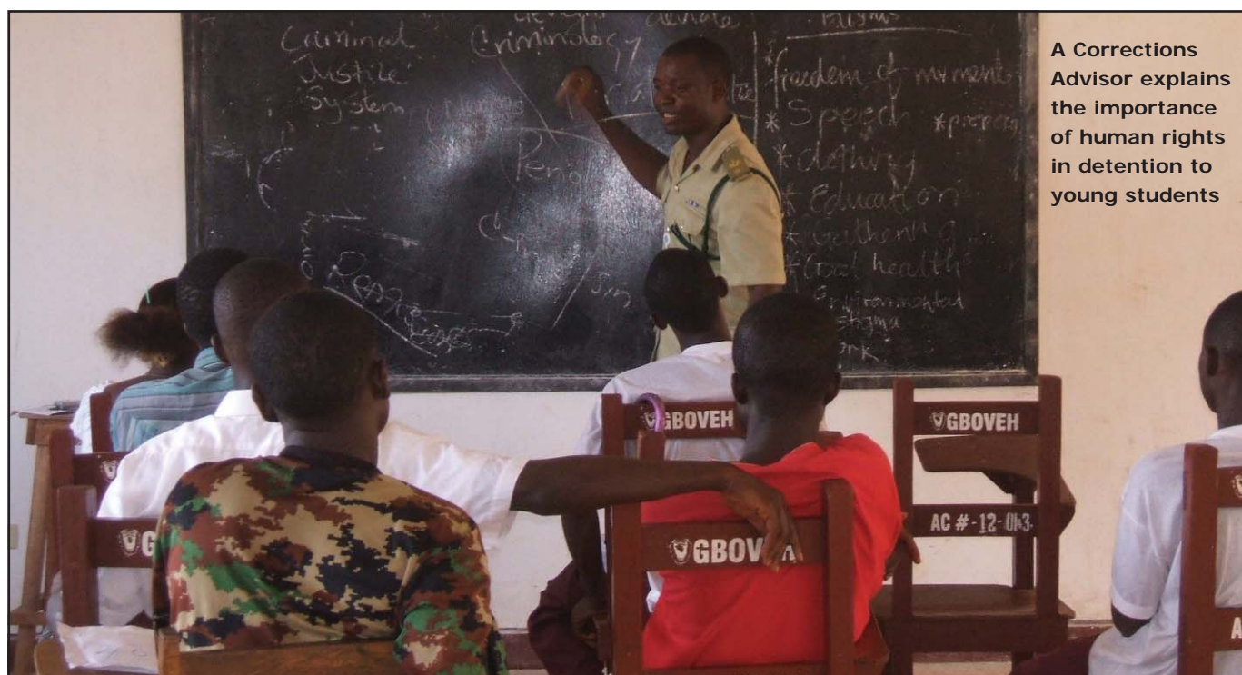
A Corrections Advisor explains the importance of human rights in detention to young students