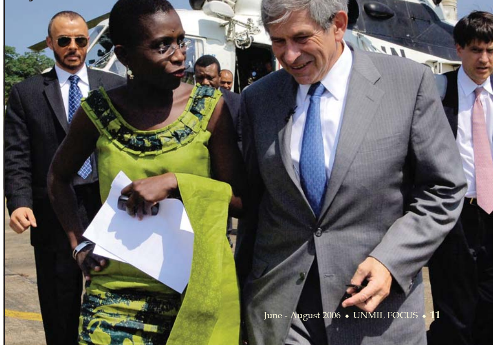
Wolfowitz confers with Finance Minister Antoinette Sayeh

He applauded the efforts of the government for what he described as "remarkable progress" in promoting fiscal discipline and praised the establishment of the IMF Staff Monitoring Programme in record time that will help accomplish a comprehensive debt relief for the country. Rebuilding a nation cannot happen