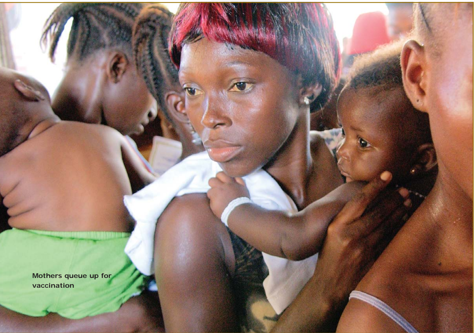
Mothers queue up for vaccination