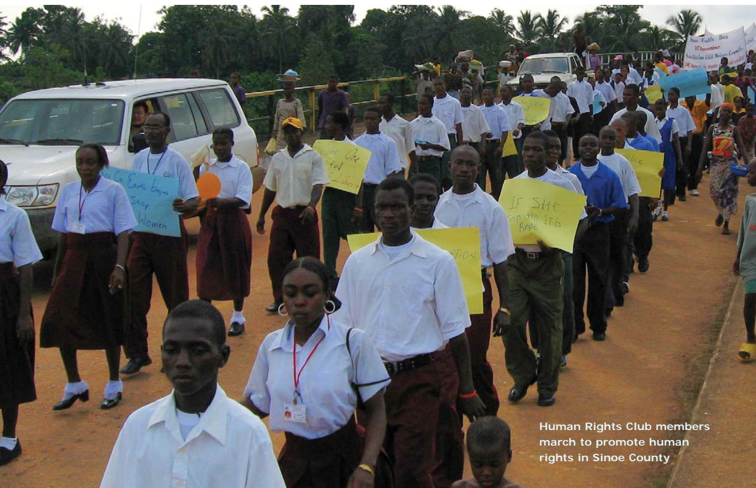
Human Rights Club members march to promote human rights in Sinoe County

The belief that the early years of life are crucial in shaping later life is fast gaining ground. Catch them young and their minds can be shaped, runs the argument. It's the same "catch them young" assumption that has led to the establishment of 41 human rights clubs in high schools across Liberia, scene of gross human rights violations lasting several decades, aimed at attaining a national human rights culture.