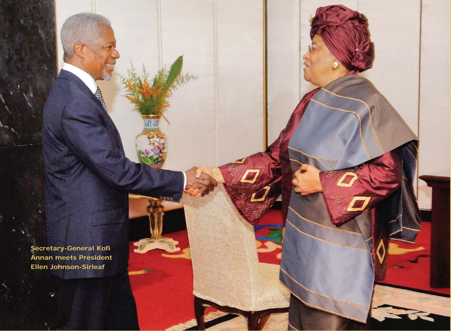
Secretary-General Kofi Annan meets President Ellen Johnson-Sirleaf