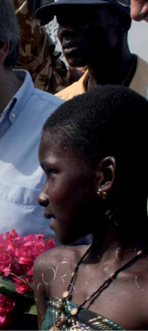
High Commissioner Guterres being greeted by refugees