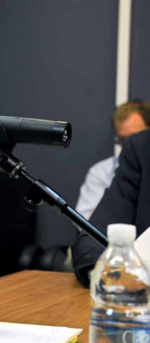
UN Humanitarian Chief Valerie Amos addresses the media

The Humanitarian chief was in Liberia to see for herself the effects of the refugee influx from Côte d'Ivoire. She travelled to Nimba and Grand Gedeh Counties where she interacted with the Ivorian refugees who described their difficult trek into Liberia and their current living conditions.