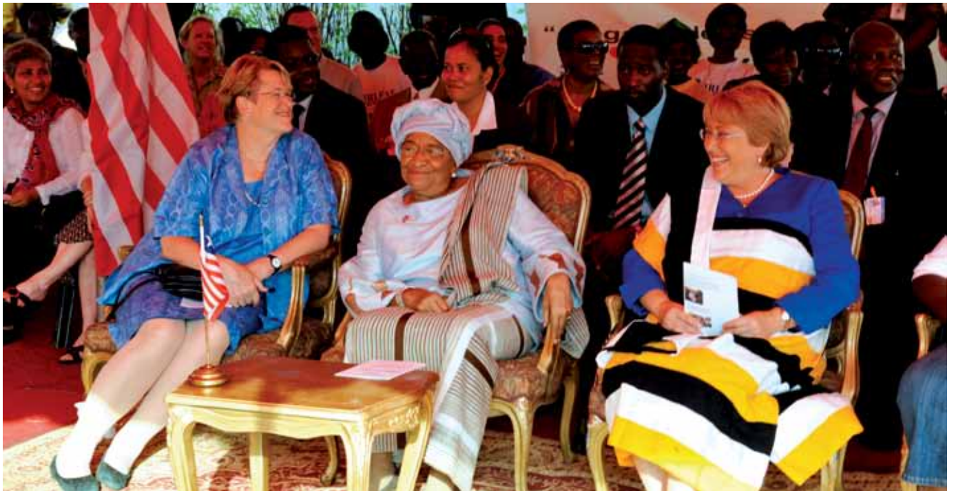
President Ellen Johnson Sirleaf flanked by UN Envoy Løj and Bachelet