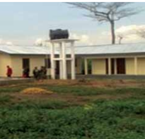
A view of the new clinic