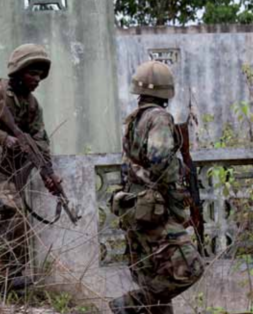
Soldiers during the exercise