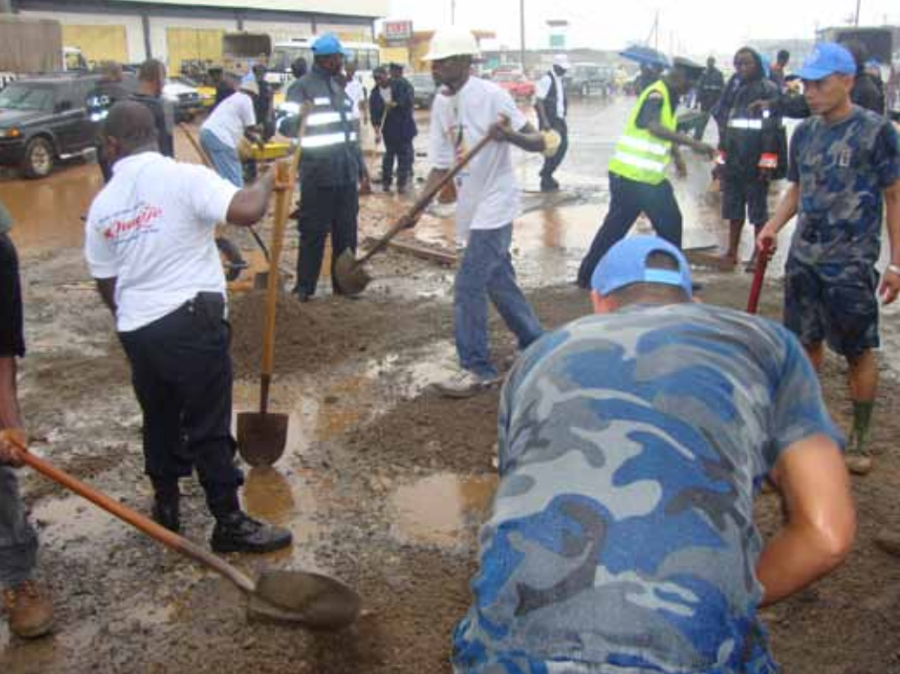
Members of the community with LNP, UNPOL, Nepal and Indian FPU, carried out a clean up drive at Freeport road