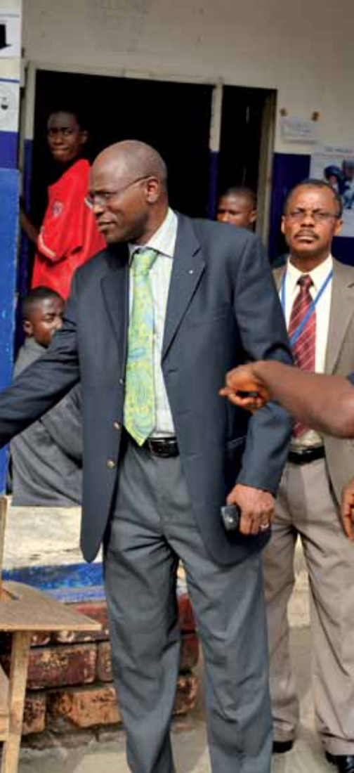
ty UN Envoy Moustapha Soumaré visits a voter registration centre