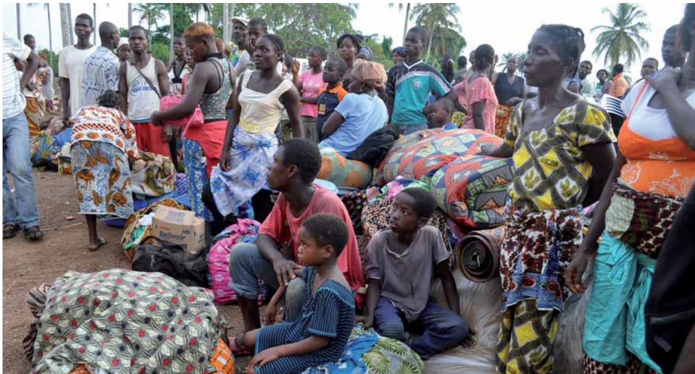
A group of Ivorian refugees