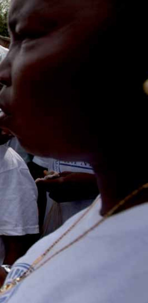
Bachelet meets members of WIPNET