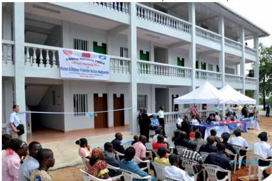
Newly constructed WACPS headquarters in Monrovia