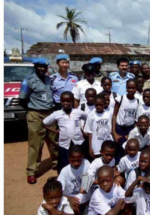
All gathered together after a school outreach