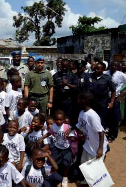
each programme at Teebey Memorial High School, Bushrod Island