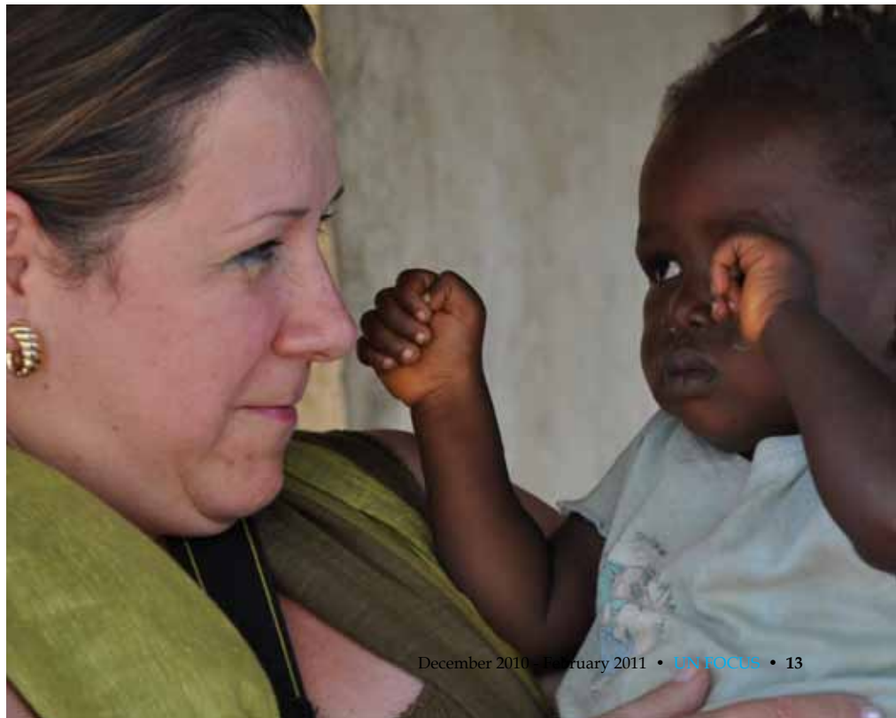
UNICEF Representative Isabel Crowley with a vaccine recipient

Polio is a viral disease that affects the nervous system and can result in paralysis. Experts say the spread of the virus is dependent on three factors – lack of nutrition, environmental causes and poor hygiene and sanitation.