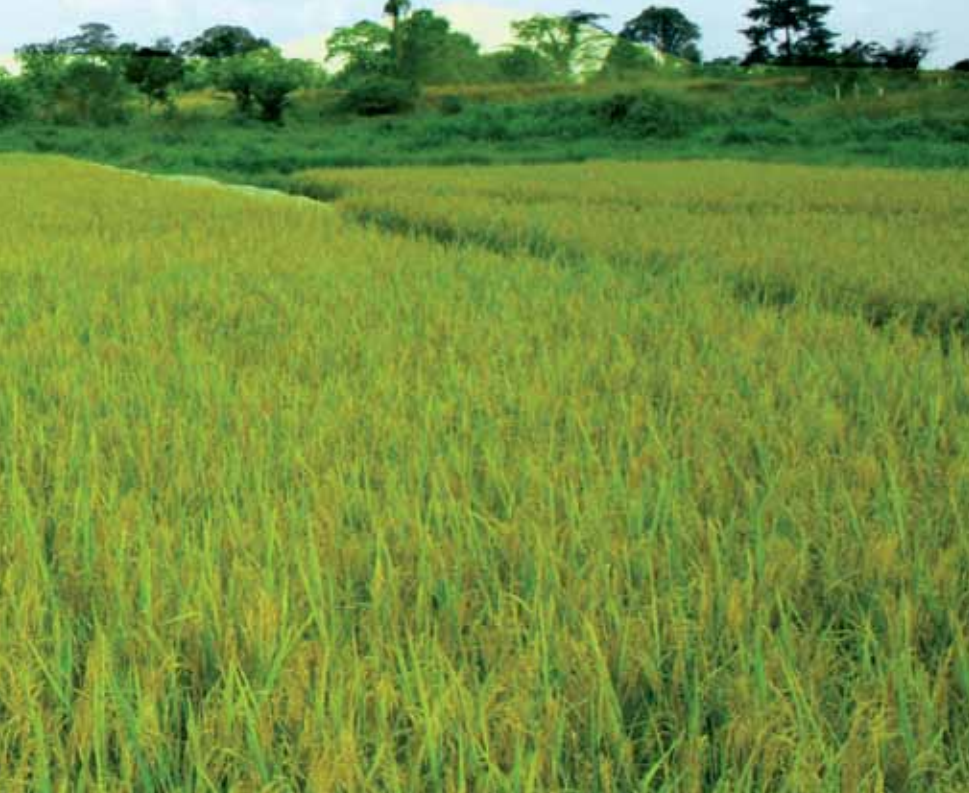
With fertile land and abundant rains, Liberia can become a major rice producer