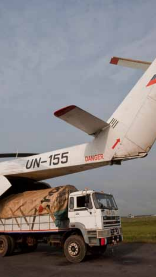
Voter registration materials reach remote areas with UN's help