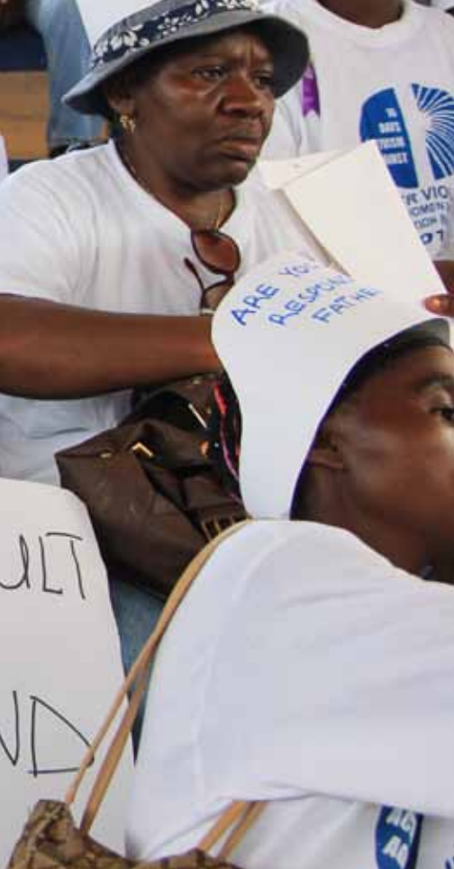
Liberian women are now speaking up against sexual violence