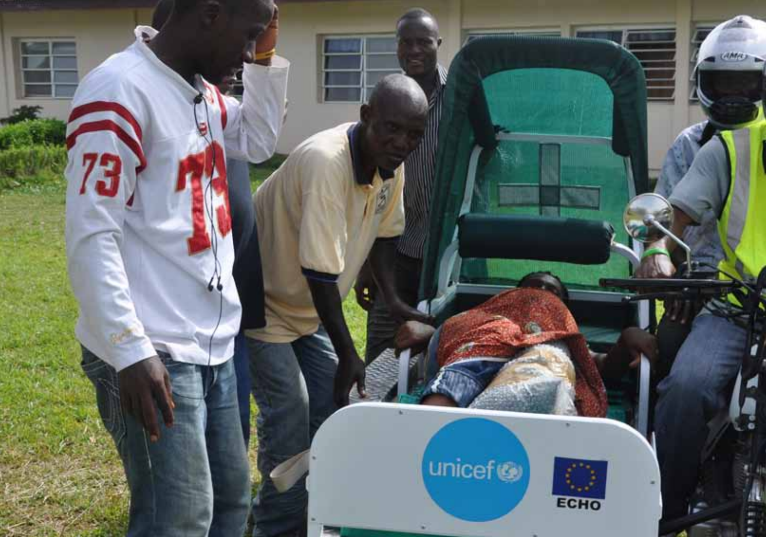
A woman in labour is transported to hospital in a motor cycle ambulance