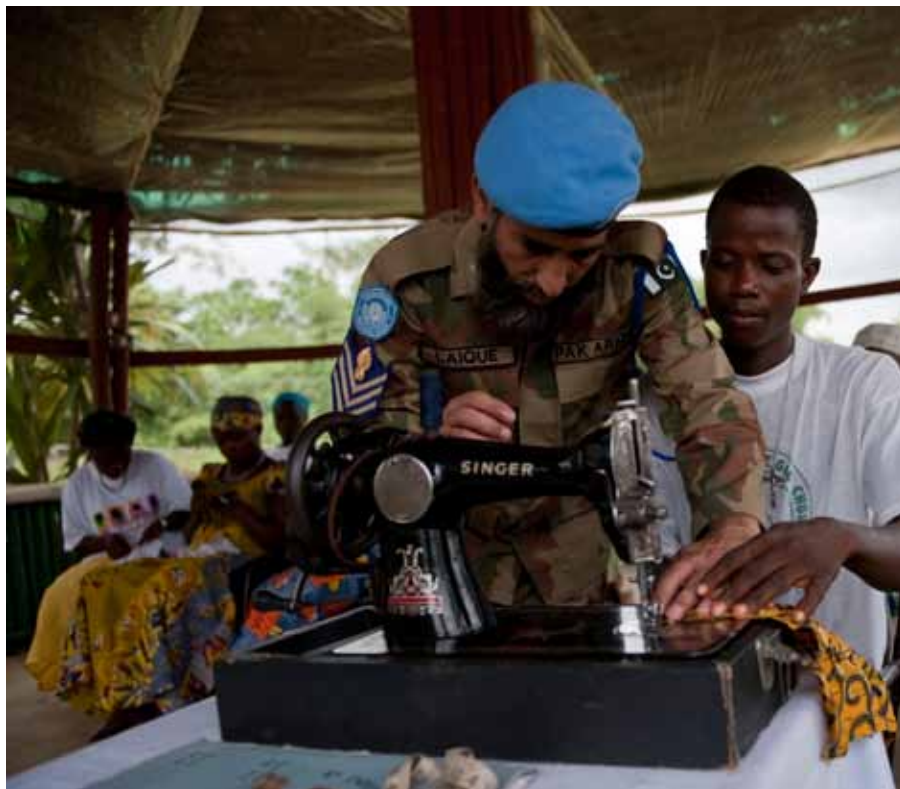
Liberia faces an urgent need for skilled personnel

F aced with a critical shortage of skilled personnel, Liberia is all set to roll out a national capacity building plan that would take into account future needs of its economy and create an enabling environment for rebuilding the country's labour force. The new vision is articulated in the National Capacity Development Strategy and Action Plan which took two years to develop and was validated through a countrywide participatory process in June 2010. Endorsed by the Cabinet this February, the Action Plan is set to be introduced to stake holders by the Ministry of Planning and Economic Affairs in March.