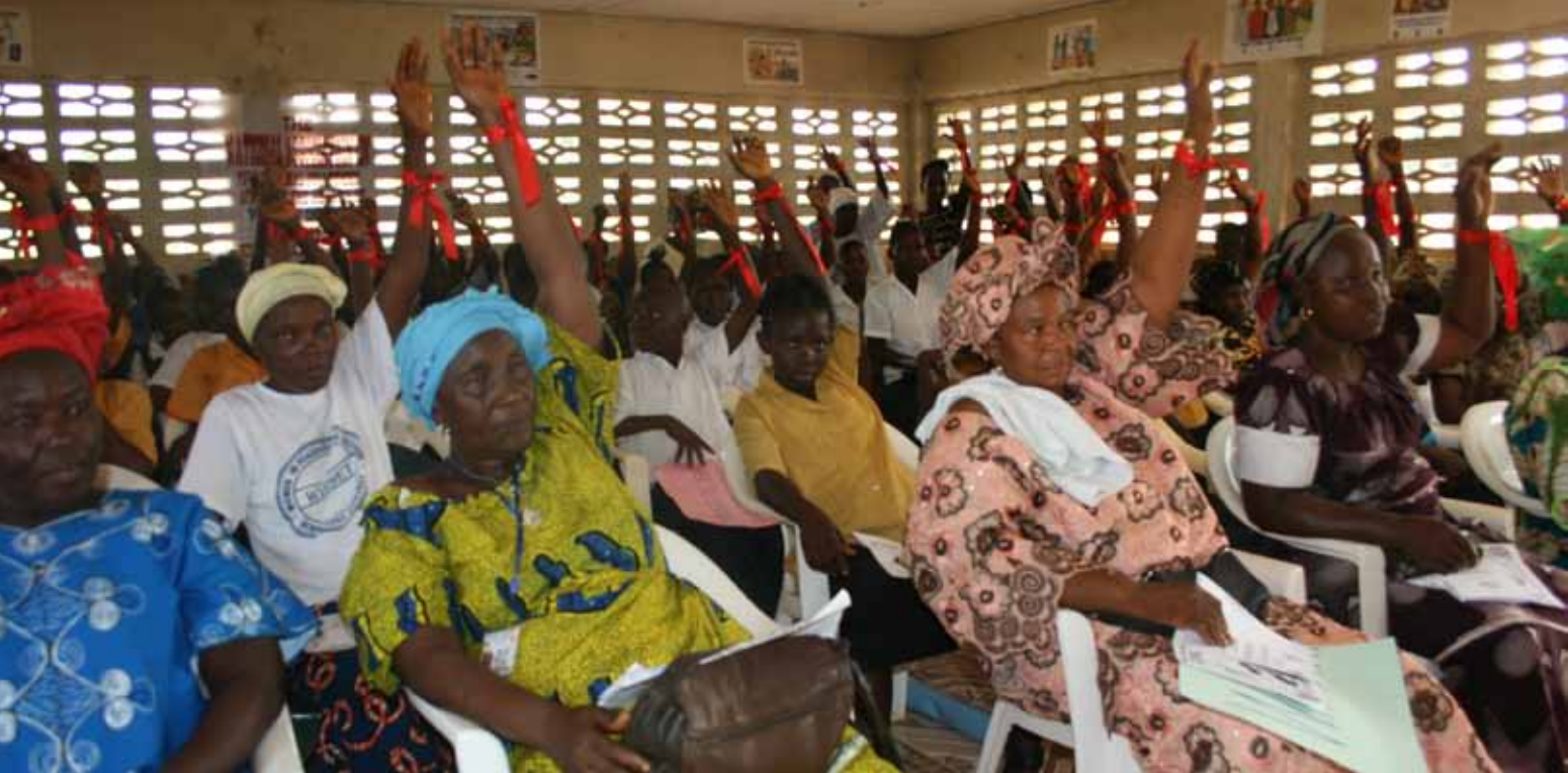
Women demand an end to FGM