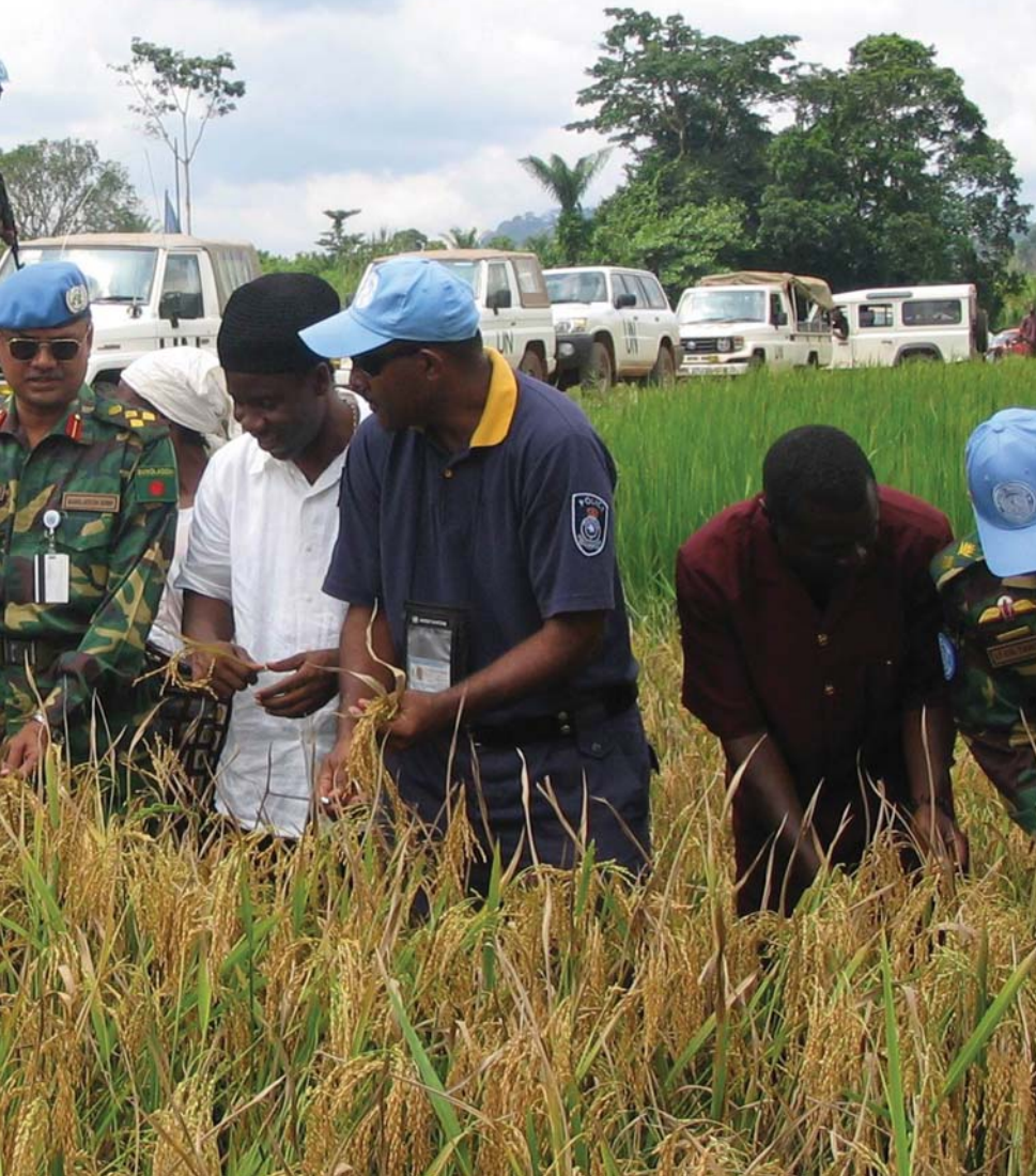
Agriculture sector faces numerous challenges