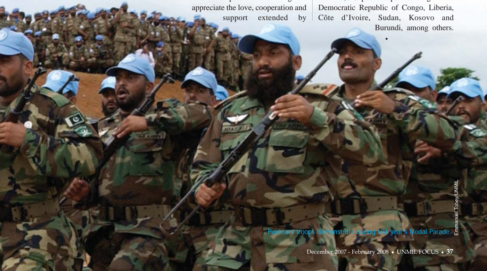
Pakistani troops demonstrate during last year's Medal Parade

Pakistan joined the United Nations on 30th September 1947. Since 1960, Pakistan has been actively involved in many UN Peacekeeping missions and today is a top troop contributing nation with 10,623 peacekeepers serving in the Democratic Republic of Congo, Liberia, Côte d'Ivoire, Sudan, Kosovo and Burundi, among others.