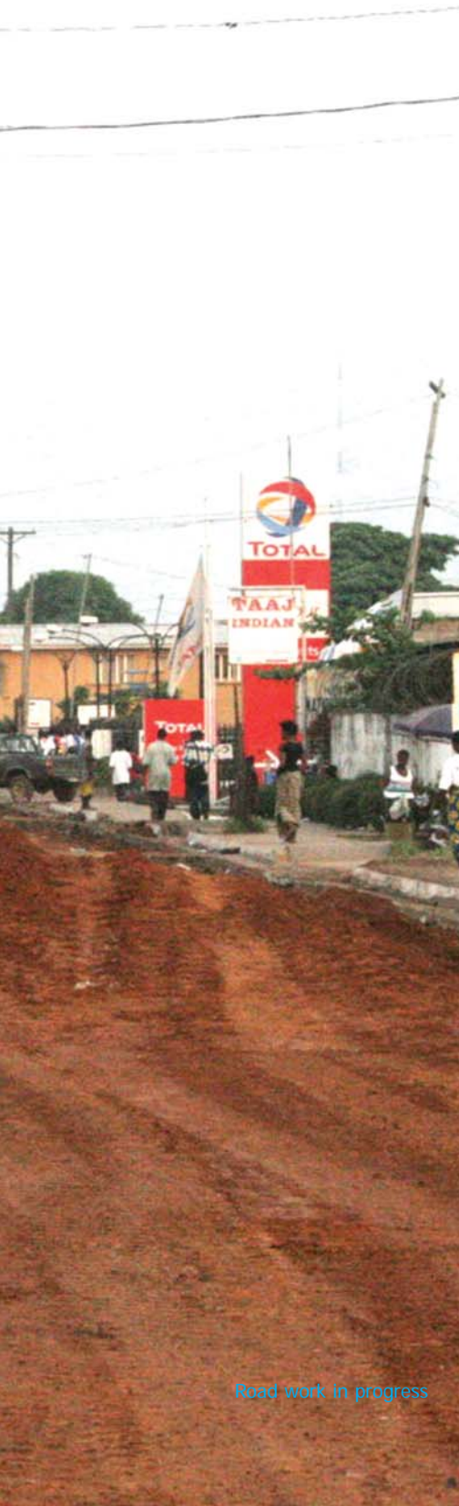
Road work in progress

Liberians agree that good roads will impact positively on the country's hard earned peace and stability, and will improve trade and commerce and enhance free movement throughout the country. However, some motorists use vehicles exceeding the designated tonnage on certain roads and bridges, contributing to their rapid deterioration and damage. Engineers say the MoPW should enforce strict regulations on maximum vehicle tonnage on roads. Information Minister Dr. Laurence Bropleh says traffic lights and speed limitation sign posts will be installed at key intersections in due course. A driver's education programme is also to be re-introduced. ♦