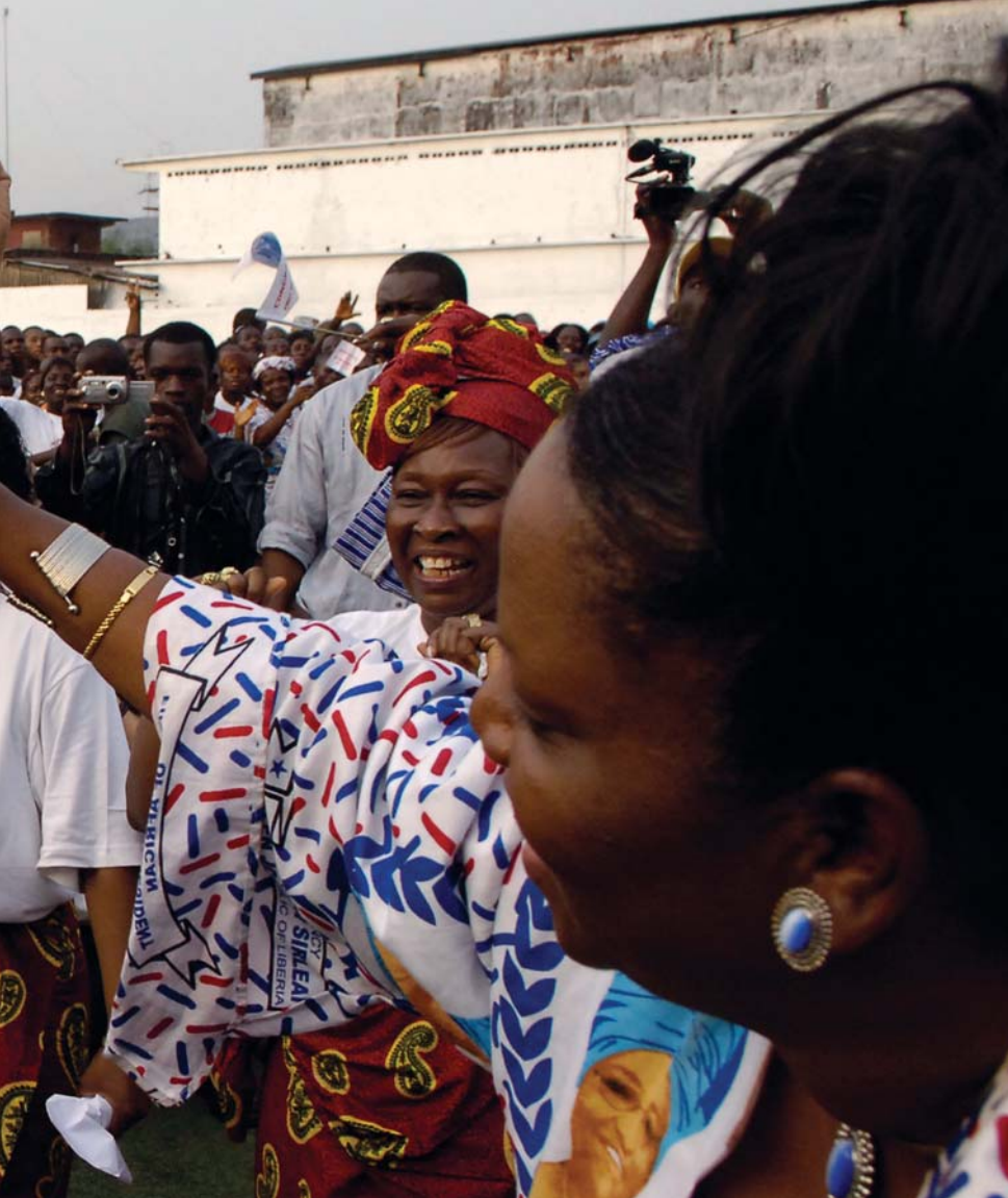
The election of Ellen Johnson Sirleaf electrified Liberian women