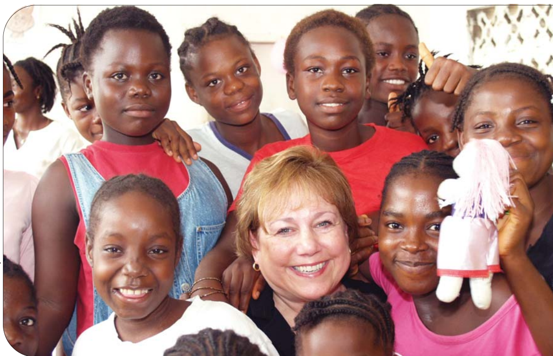
Ann Veneman with children at UNICEF-supported juvenile transit rehabilitation centre in Monrovia

Although Liberia is slowly recovering from war women and children still face significant risk of sexual exploitation. During the conflict sexual violence was endemic and despite numerous efforts to tackle the issue of rape, incidents continue to grab headlines. In the capital, UNICEF supports a juvenile transit rehabilitation centre for girls who have been either abandoned or sexually abused. "I'm very concerned about the high rates of sexual violence in this country," said Veneman after visiting the centre. "But from talking with the girls, I felt so much hope in them. They were in a safe place and they were devel-