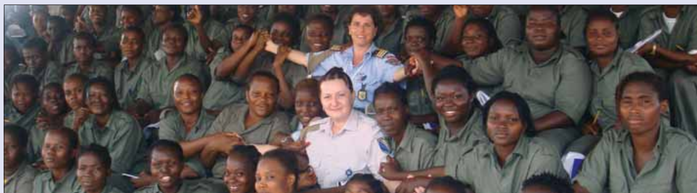
A special education programme has helped increase female intake in the police force

"Overall, performance has been good. They are not behind the other graduates that have been here and they have been working quite hard. However, there are challenges for ladies that are not used to a paramilitary environment. It is a little difficult for them to adopt this into their daily lives; but they are coping," said the UNPOL Training and Development