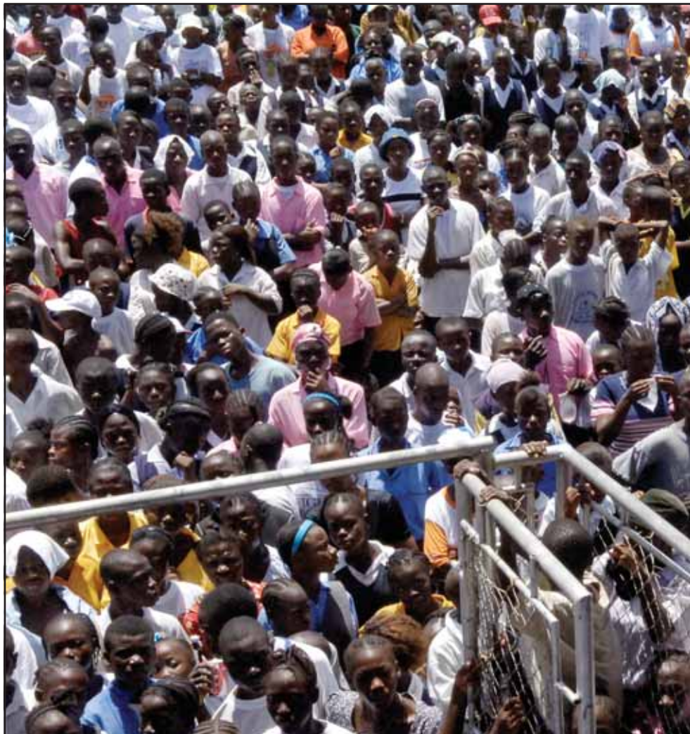
Lack of competent professionals is a major problem facing Liberia

In April 2006, the government launched the Liberia Emergency Capacity Building Support Project (LECBS), technically and financially supported by the UNDP and the Open Society Institute for West Africa (OSIWA). By assisting with salary supplements for expert positions, the objective of the project is to help the government phase out corruption and to undertake major reform initiatives in the civil service, land and security sectors, and