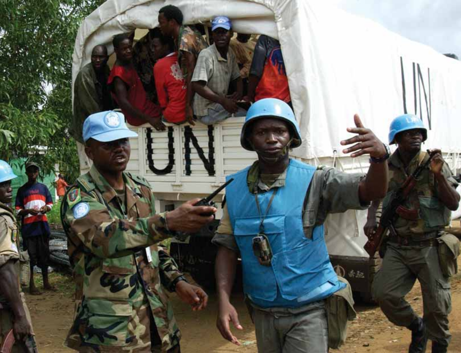
UN Peacekeepers have restored peace and stability in Liberia

lack of capacity to process cases and poor management. “As a result of these shortcomings, many Liberians have little confidence in the justice system,” Ban observed. Deficiencies in the justice system continue to pose serious challenges to the promotion and protection of human rights in the country.