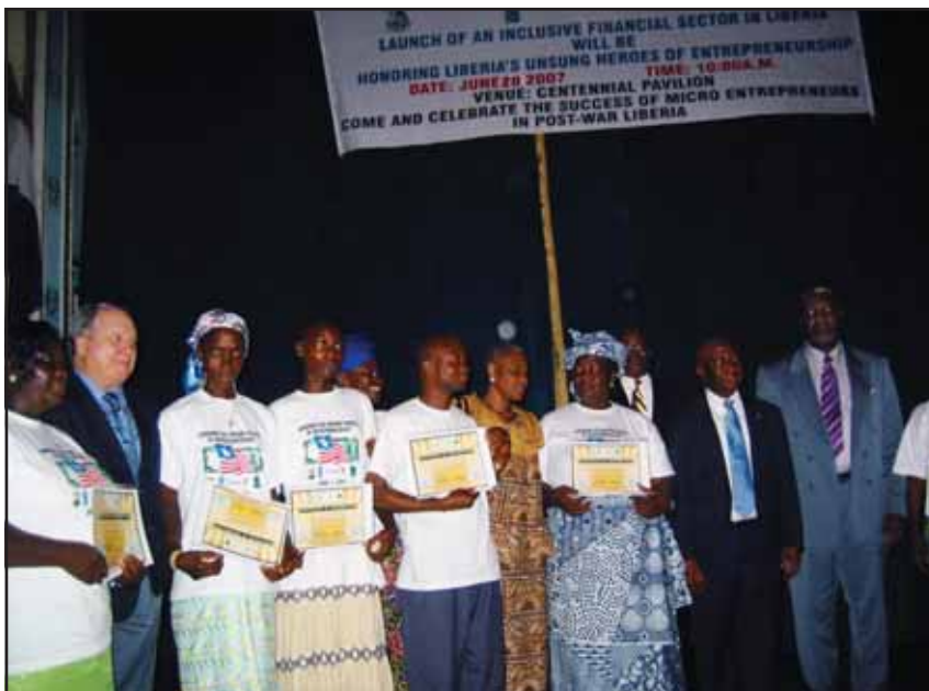
Launch of the Inclusive Financial Sector Project

By joining the micro credit scheme and through the repayment of her loan and applying for and receiving more, she was