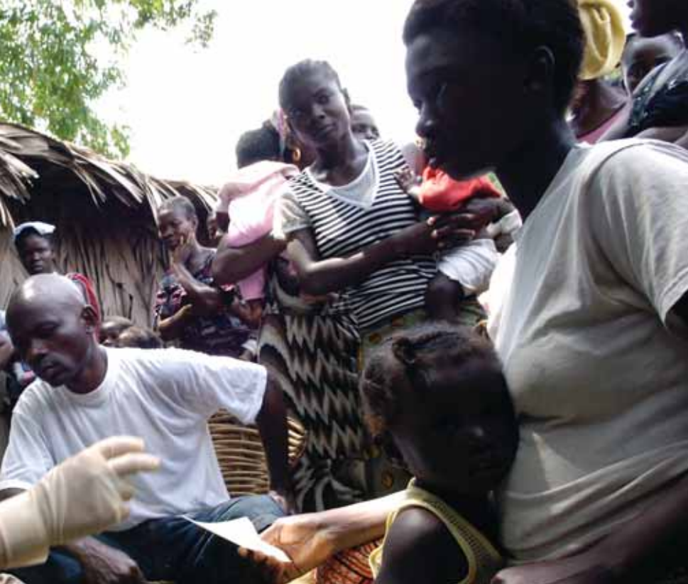
A Pakistani medic treats patients at a free medical camp

health and hygiene. Sanitation activities are carried out with cleaning exercises of public places undertaken while hand-pump wells have been installed in some communities where residents had no access to safe drinking water before.