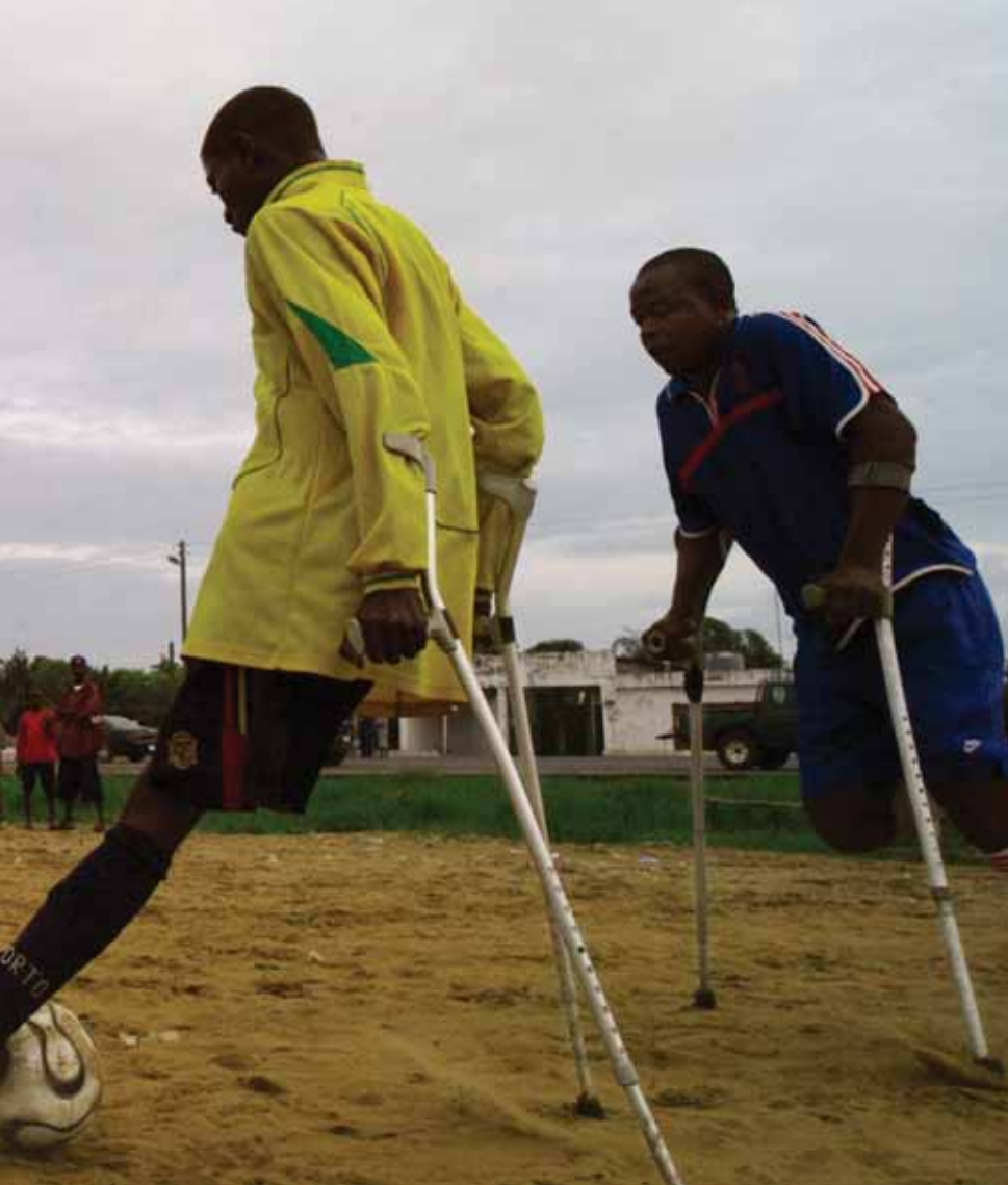
Soccer has restored the self-esteem of the amputees