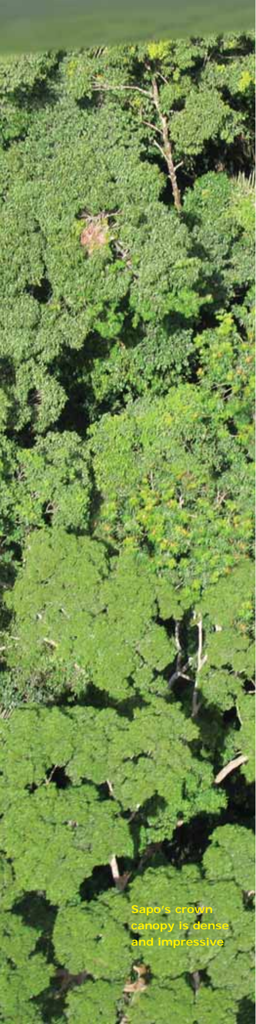
Sapo's crown canopy is dense and impressive