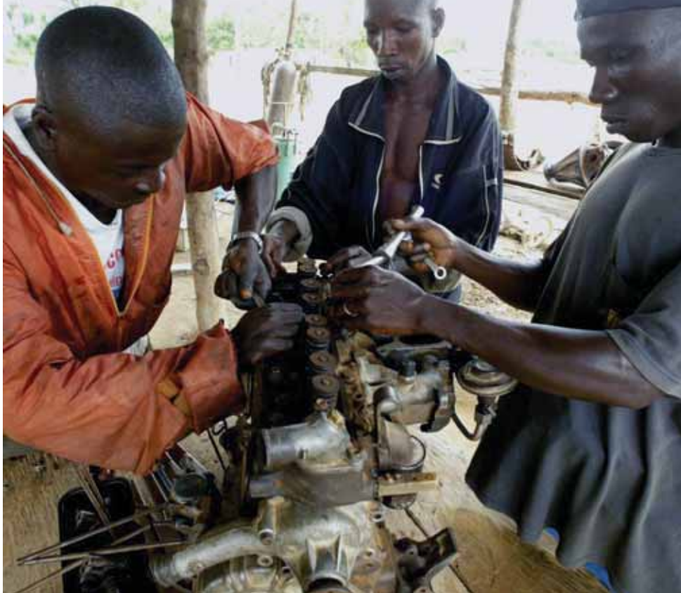
Farewell to arms, welcome to skills