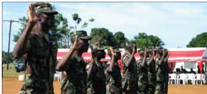
Members of the new Armed Forces of Liberia

The Chinese and French governments have made scholarships available for the benefit of the Ministry of Defense and the AFL. The Chinese government has also provided funds for the rehabilitation and expansion of the Camp Tubman Military Barracks near Gbarnga, Bong County, intended to host a battalion of 800 members of the new AFL. ♦