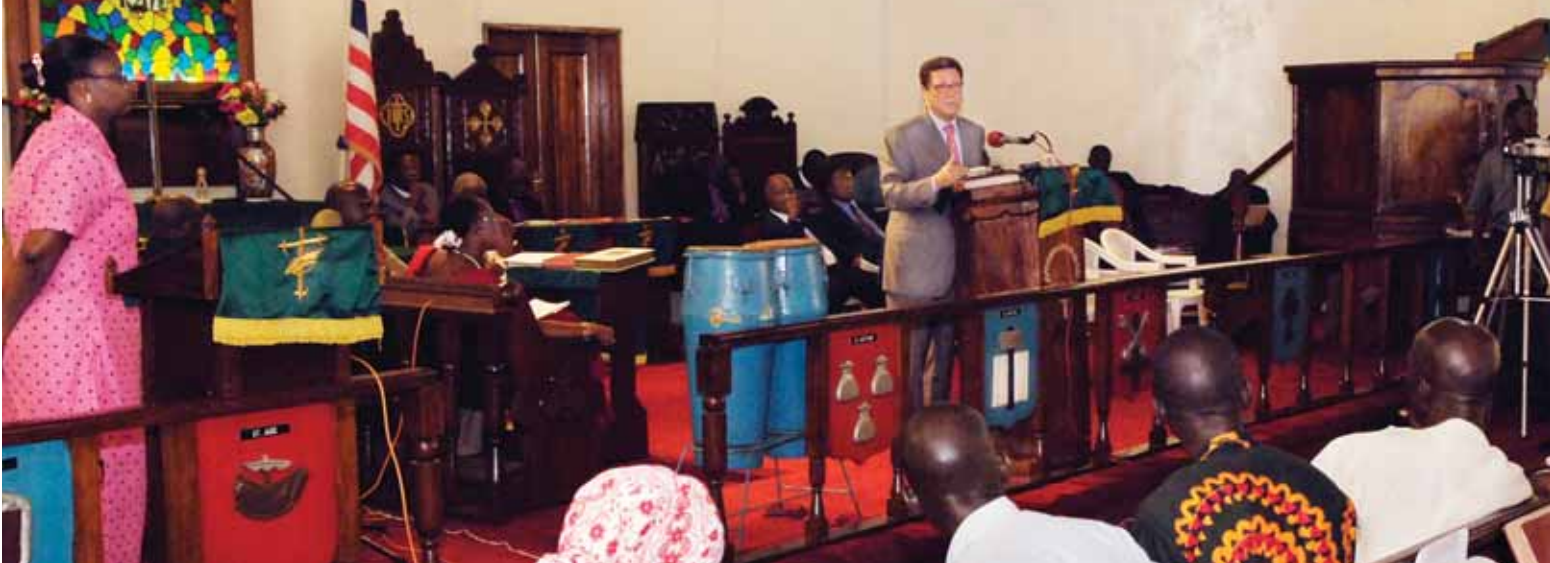
Alan Doss calls for an end to sexual violence