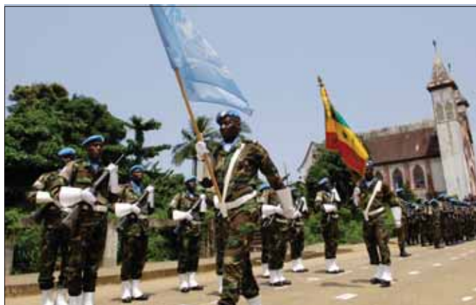
Senegalese peacekeepers during a medal parade

Currently, nearly 2,000 Senegalese military personnel are deployed in missions in the Democratic Republic of Congo (MONUC), Côte d'Ivoire (UNOMCI), Sudan (AMIS) and Liberia (UNMIL). Senegal also has gendarmes serving in Haiti and Bosnia-Herzegovina. ♦