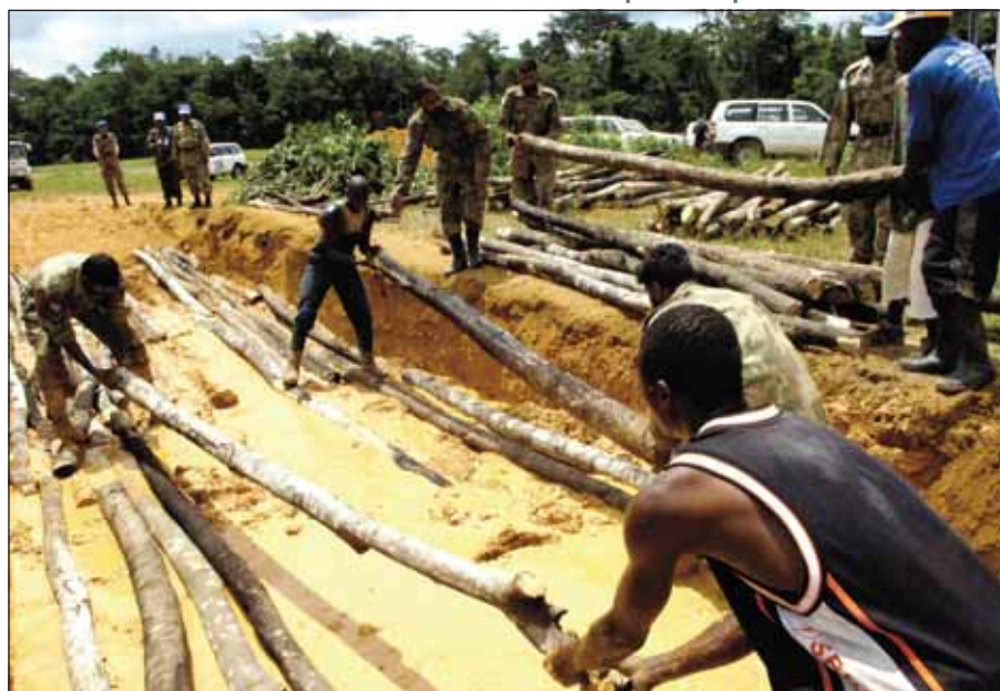
Peacekeepers help rehabilitate a road

Although UNMIL military has neither the material nor the funding resources available to undertake the many humanitarian assistance projects requested by the communities, there is no doubt that peacekeepers have won the hearts and minds of most Liberians through their sacrifices. ♦