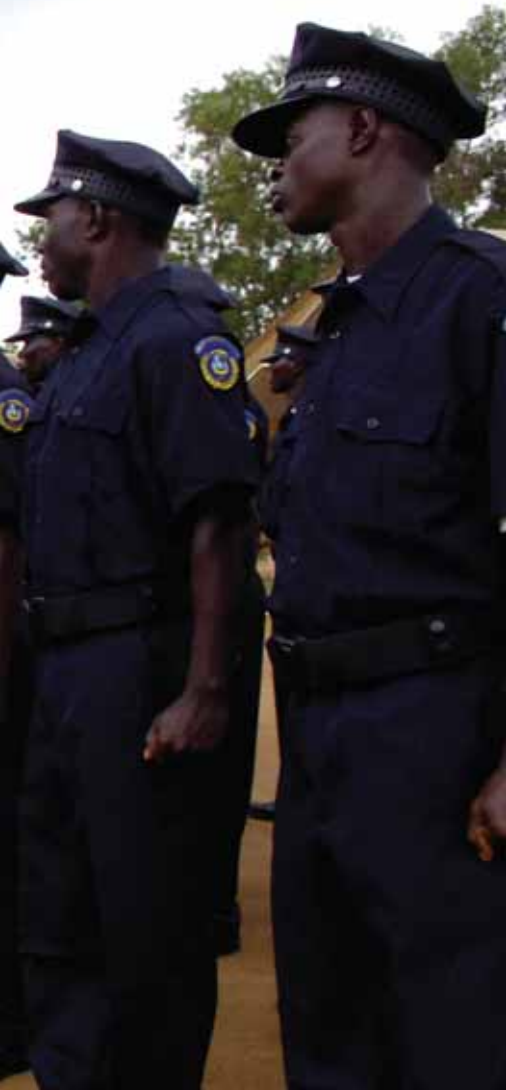
he planned target for the new police force

three times as many, the country's security forces had turned from protectors to predators. Ordinary Liberians could not distinguish the gun-totting rebel combatants who killed, raped and maimed indiscriminately from the country's police personnel. As the civil war came to an end in 2003, the UN peacekeeping mission deployed in the country was mandated to replace the discredited police force and train a new one as part of the Comprehensive Peace Agreement signed by the warring factions.