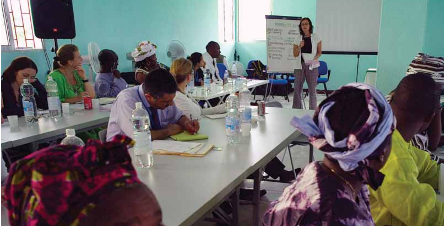
A CST workshop in progress