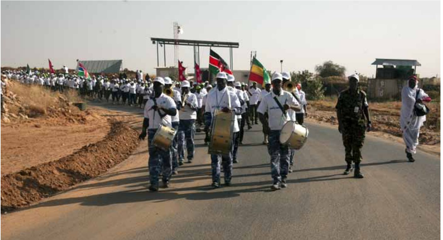
UNAMID personnel join the route march from the Supercamp to the ARC Compound where the venue of the World AIDS Day programme is located. The participants in the route march wear WAD caps and T-shirts and display placards with HIV messages