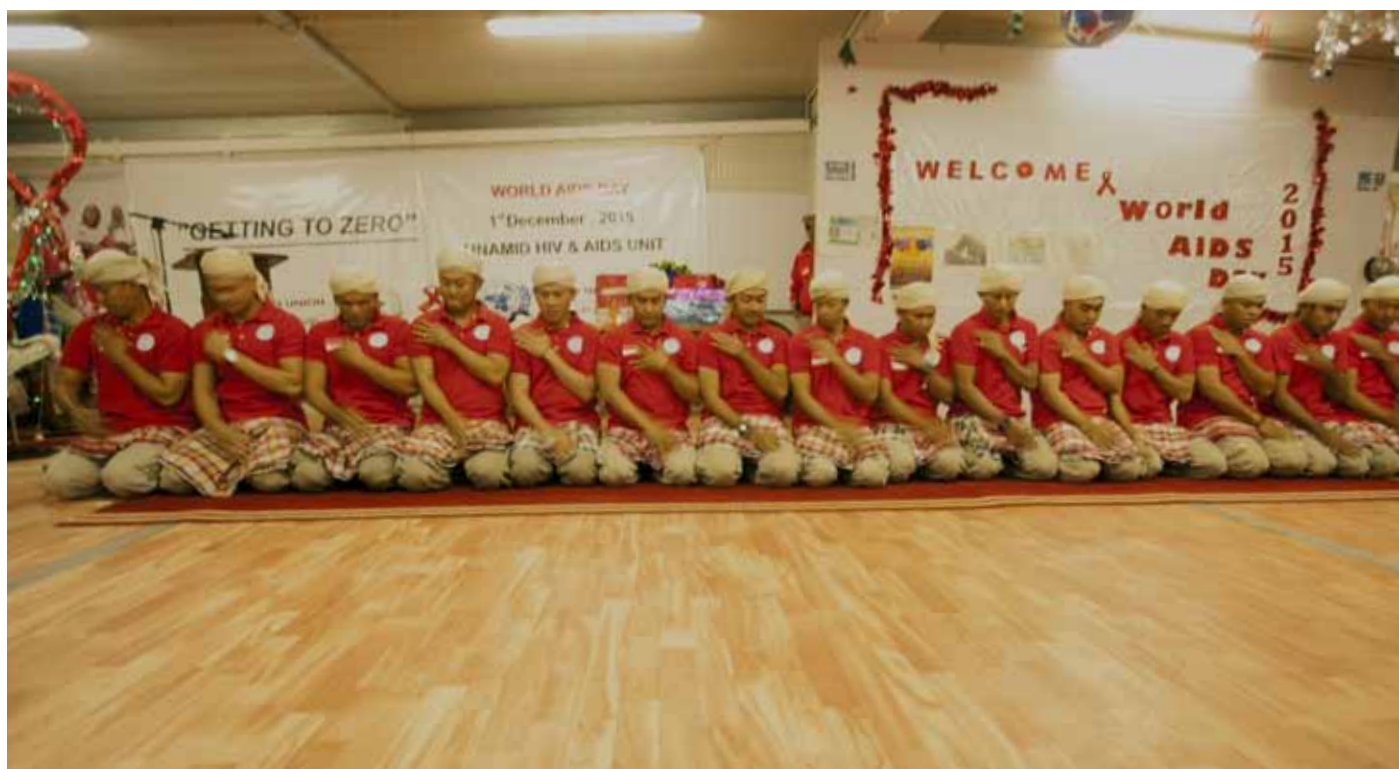
A cultural presentation from the Indonesian Formed Police Unit