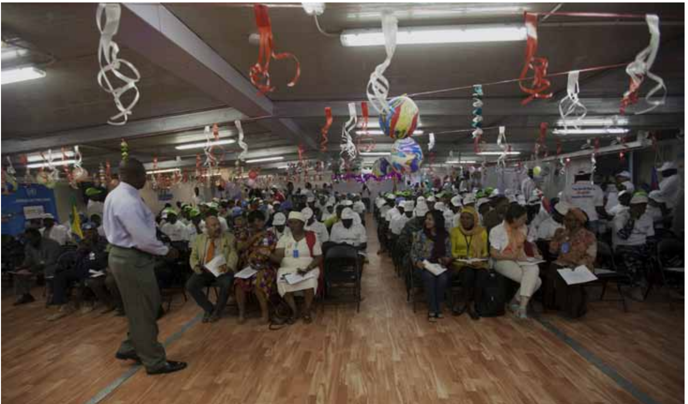
The Town Hall Conference Room is the venue of the WAD 2015 event