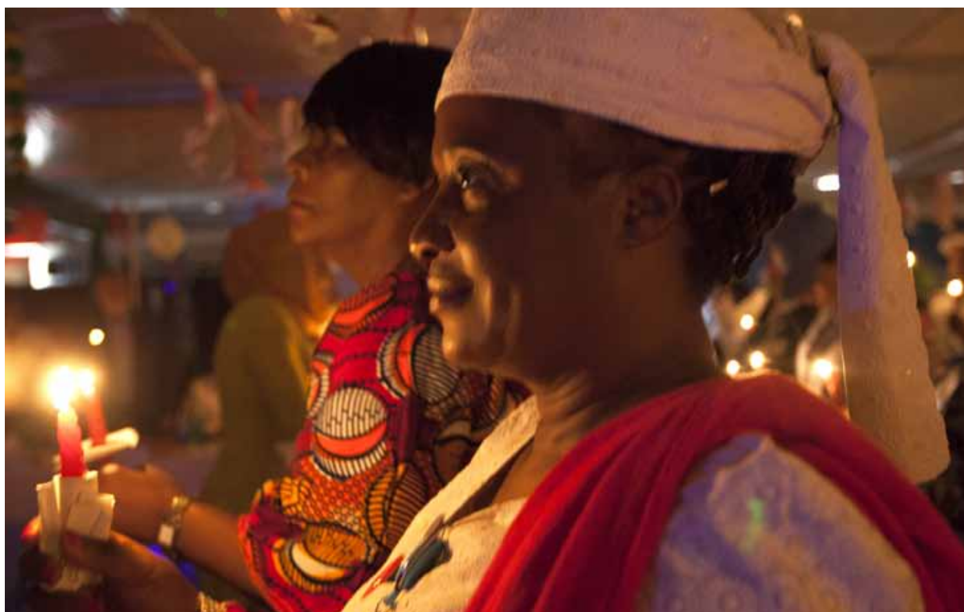
Candle-lighting ceremony with a minute of silence in memory of those who passed away due to AIDS, with entire audience participation