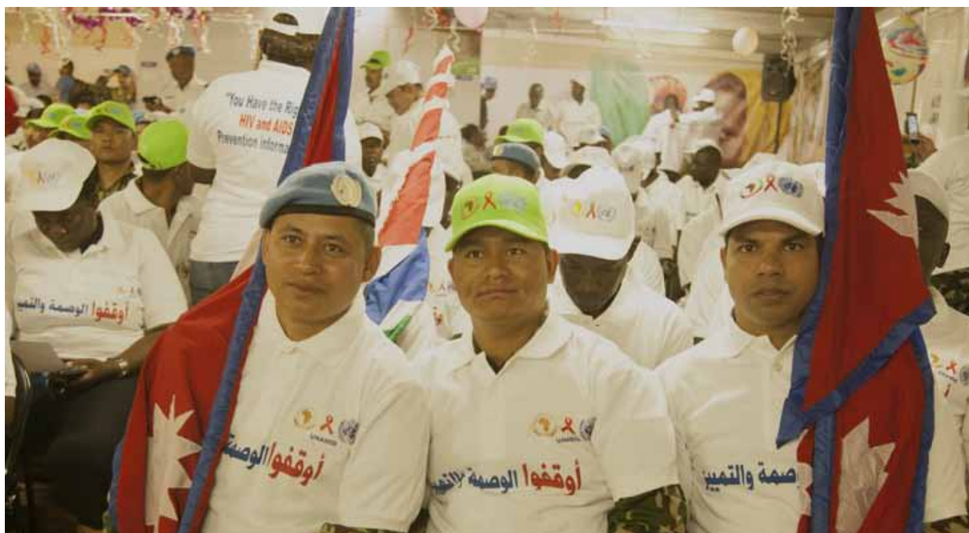
Participants in the World AIDS Day event display along with their national flags their T-shirts and Caps especially made for the event