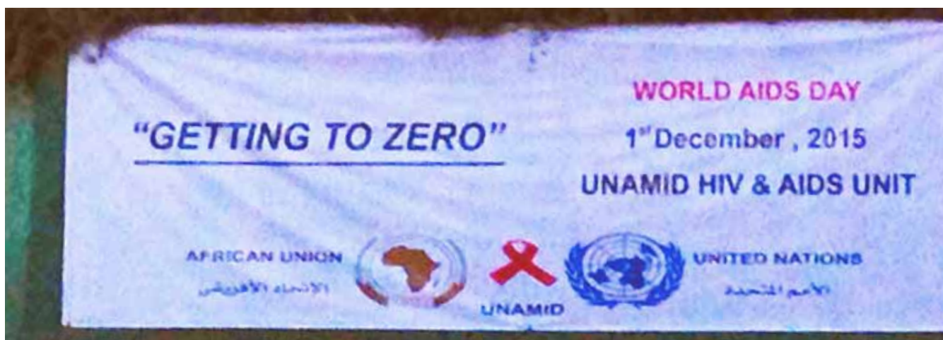
World AIDS Day Banner strategically displayed at a Supercamp intersection to promote the event