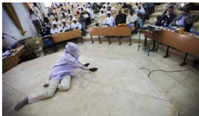
On 18 February 2014, an actress of the Marafi drama group performs during the launch of the DIDC mechanism at El Fasher University's Peace Centre.

The United Nations, the African Union and the State of Qatar are facilitating the DIDC process. Ahead of the first workshop to launch the consultation mecha-