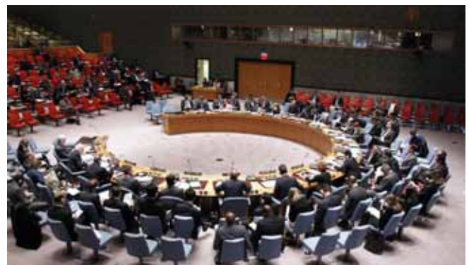
On 23 January 2014, the Under-Secretary-General for Peacekeeping Operations Hervé Ladsous briefs the UN Security Council on Darfur, Sudan, at the UN headquarters in New York.

Highlighting the significant threats to UN and humanitarian personnel in the region, Mr. Ladsous reported that 16 peacekeepers were killed as a result of hostile acts in Darfur throughout 2013—a 50 per cent increase compared to the previous year. This brings to 57 the number of personnel killed since UNAMID was deployed in 2008. “The Government of Sudan must investigate and expeditiously bring to justice the perpetrators,” he stressed. ▀