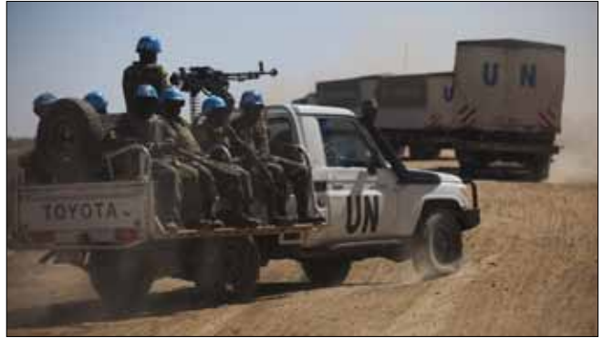
On 10 February 2014 in El Fasher, North Darfur, UNAMID troops escort a convoy of World Food Programme trucks traveling to Shangil Tobaya, North Darfur, to deliver much-needed assistance to internally displaced people in the area.