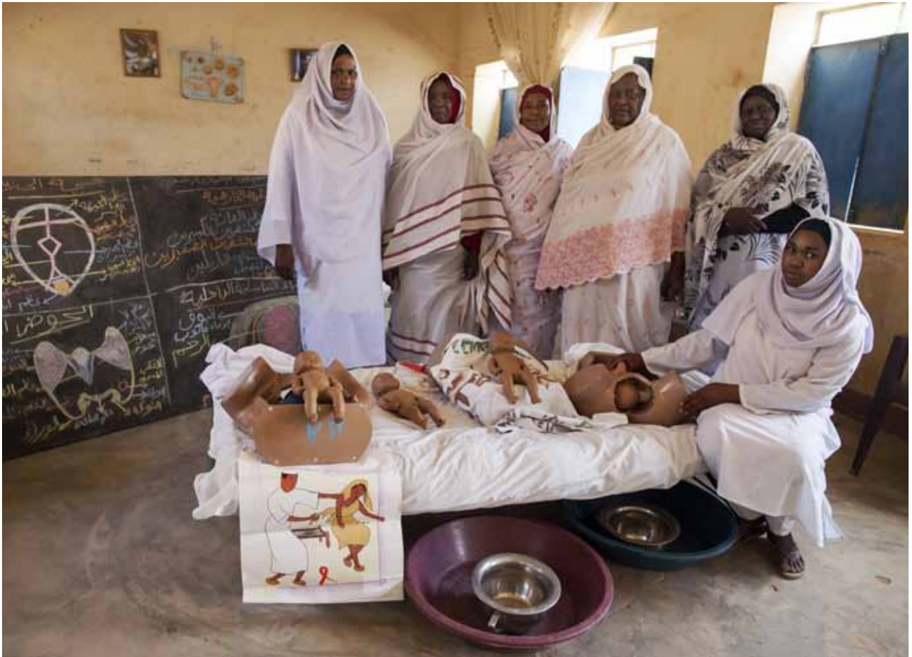
In Darfur, it is customary for midwives to perform female circumcision. However, an increasing number of midwives, such as those pictured here, are joining local organizations that are raising awareness about the negative physiological and psychological side effects of the practice, and are pledging not to perform the operations.

“From the legal point of view, we consider female genital mutilation as a form of gender-based violence and violence against children.”