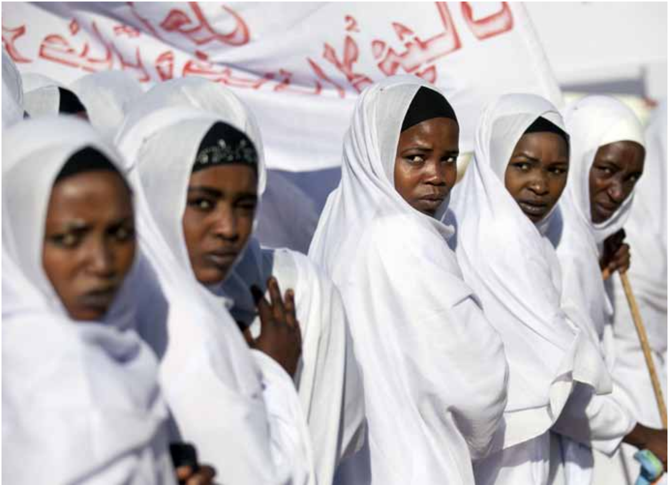
On 11 March 2013 in North Darfur, students of the El Fasher Midwifery School participate in a march organized by UNAMID to commemorate International Women's Day. The event was held under the theme "Together to Promote the Dignity of Women and Girls." One of the challenges faced by Darfuri women is female circumcision, a practice that leads to severe health complications.