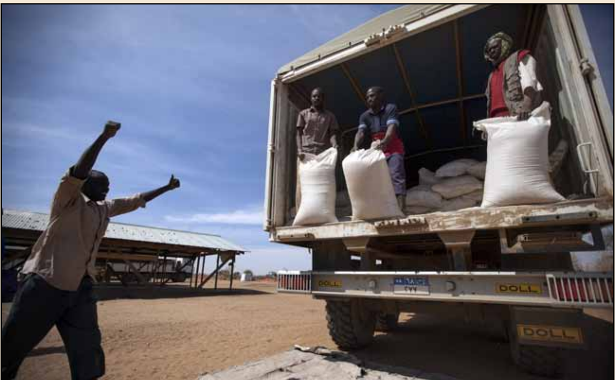
On 11 February 2014 in Shangil Tobaya, North Darfur, a resident of the Nifasha camp for displaced people greets his colleagues before helping distribute goods from World Food Programme trucks. The WFP convoy, protected by UNAMID peacekeepers, travelled 100 kilometres from El Fasher to Shangil Tobaya to deliver 350 metric tonnes of food.