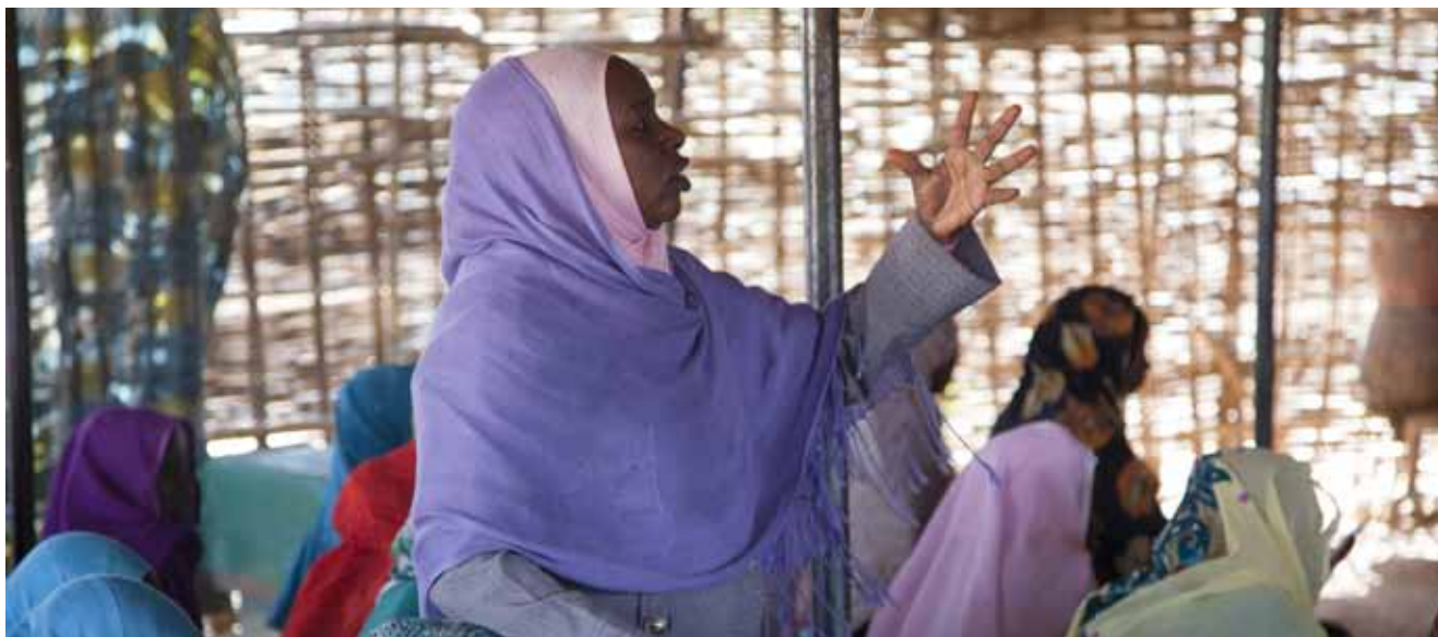
On 21 October 2013, a woman shares her views during a workshop on female circumcision in the Abu Shouk camp for displaced people in El Fasher, North Darfur. The workshop, organized by UNAMID and nongovernmental organization Tigo to commemorate Africa Human Rights Day, was held under the theme “Abolishing Female Genital Mutilation Now.”

a bad moment that continued to have serious consequences in my life,” she says, explaining that, as a result of the procedure, she has had to undergo two cesarean sections while giving birth. The need to have C-sections is a complication associated with female circumcision.