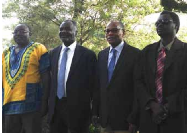
On 10 February 2014 in Kampala, Uganda, Dr. Mohamed Ibn Chambas meets with the leadership of the Darfuri non-signatory movements during a three-day visit to the country.

"We are ready to continue engaging with all the non-signatory movements to bring them on board the peace process and find a durable solution for the Darfur conflict," he said. "The only way forward is through dialogue, not violence."