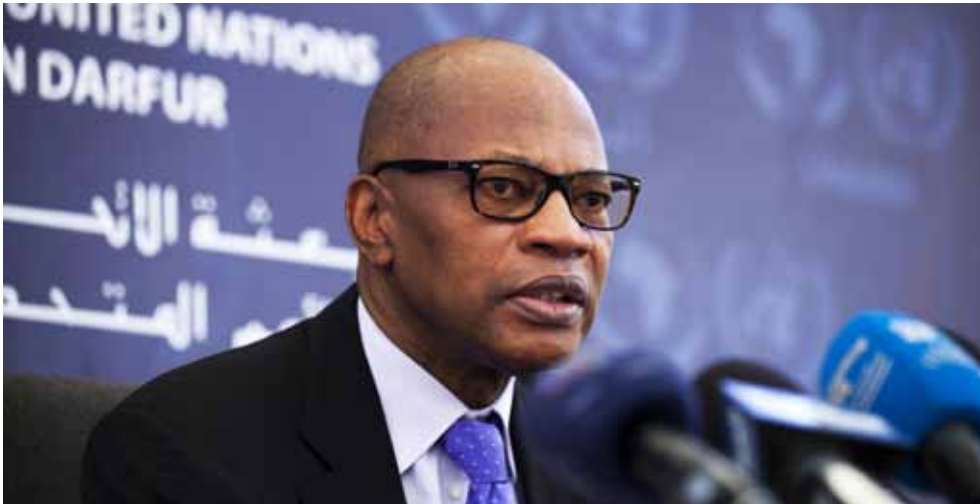
On 23 January 2014 in Khartoum, Sudan, UNAMID JSR Mohamed Ibn Chambas briefs national and international media during a conference at the Mission's Khartoum offices.

The security situation in Darfur deteriorated during 2013 and remains volatile, a senior United Nations official told the Security Council on 23 January 2014, while calling on all sides to join negotiations aimed at achieving a permanent ceasefire and comprehensive peace. Recent months have also been marked by a significant worsening of the humanitarian situation, continued attacks on UN and relief personnel and limited progress in the implementation by the signatories of the Doha Document for Peace in Darfur (DDPD), Under-Secretary-General for Peacekeeping Operations Hervé Ladsous said in his briefing.