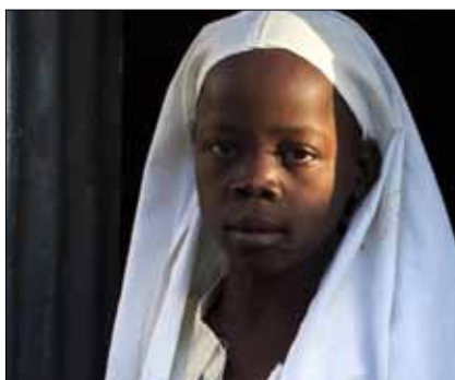
A girl is dressed in her school uniform in the Abu Shouk camp for displaced people.