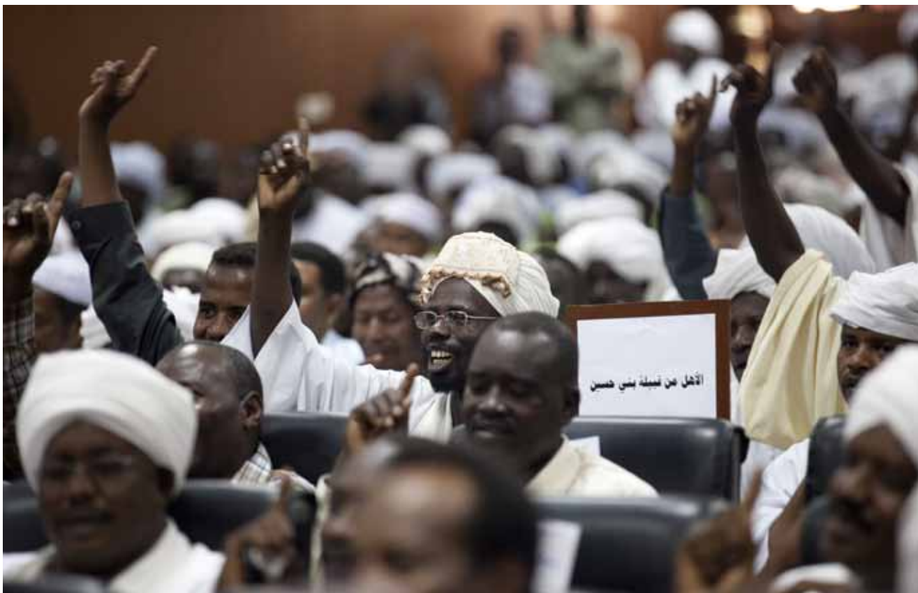
On 27 July 2013, at the offices of the Wali (Governor) of North Darfur, members of the Beni Hussein tribe cheer during the signing ceremony for an agreement designed to end the dispute with the Abbala related to the Jebel Amir goldmine. UNAMID's Civil Affairs section conducted mediation and reconciliation workshops leading up to the final signing ceremony.

Given the number of inter- and intra-tribal conflicts in Darfur, many of Civil Affairs' activities have involved promoting and facilitating local-level mediation and reconciliation efforts designed to restore peace and trust. UNAMID's Civil Affairs personnel have supported mediation in several conflicts involving different ethnic communities, facilitated reconciliation efforts and provided support to sustain local peace agreements and promote traditional reconciliation mechanisms.