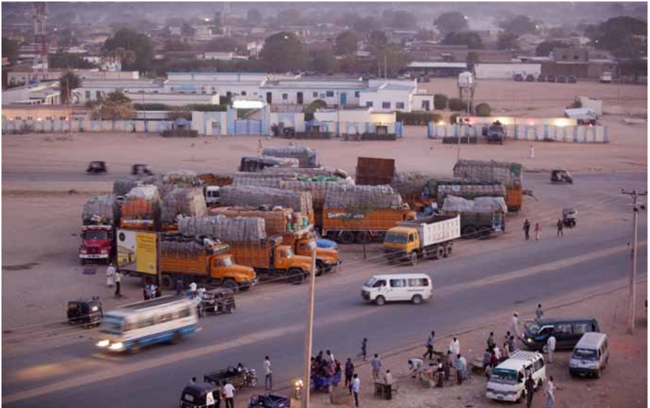
On 23 February 2014, trucks are loaded with goods for trade in Nyala, South Darfur. As more and more people flock to Nyala, trade with its neighbours has increased, nationally and internationally. In a strategic geographical location, Nyala serves as a key trade link with other towns in Darfur, with Khartoum and with neighbouring countries, such as Central African Republic and Chad.

the city. In March 2013, for example, 31 IDPs were captured during their journey to a two-day Nyala conference organized by the Darfur Regional Authority; the IDPs were later released. At the conference, more than 400 IDPs from across Darfur came together to discuss pressing issues, including voluntary return and resettlement, as well as security. The following month, fighting broke out between Government troops and an armed movement in Labado, 50 kilometres from Nyala. The hostilities decimated the area—the market, schools and the health care facilities were looted and destroyed—displacing nearly 30,000 people who fled to different IDP camps across South, East and North Darfur.