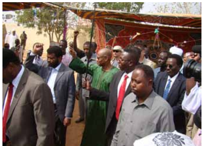
On 25 January 2014, UNAMID Joint Special Representative Mohamed Ibn Chambas concluded a visit to El Geneina, West Darfur, where he met with local authorities and participated in a conference organised by the Darfur Regional Authority.