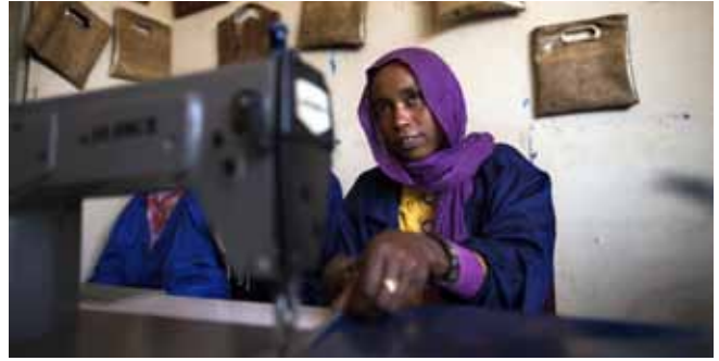
On 25 March 2014, a young woman taking a training session on sewing at the technical school in Mellit, North Darfur. The training was part of UNAMID's community-based Labour-Intensive Projects.

The CLIPs programme plays an important role in com-