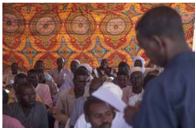
On 2 November 2014, former combatants from the Justice and Equality Movement-Sudan participate in a demobilisation programme organized by the Sudan Disarmament Demobilisation and Reintegration Commission with support from UNAMID, UNDP and WFP.

In his remarks, UNAMID Deputy Force Commander, Major General Keita, expressed appreciation for the Government of Sudan, the State of Qatar and the leadership of JEM-Sudan for