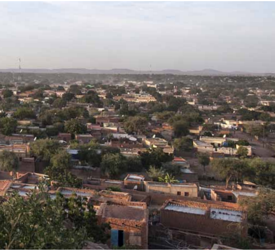
On 12 November 2014, the landscape of West Darfur's capital, El Geneina is photographed here. Located some 27 kilometers east of the Chadian-Sudanese border, El Geneina is an important transit point connecting the West and East coasts of Africa.

Additionally, the state capital also boasts of new roads linking it to Zalingei, Central Darfur, while construction is underway on a road connecting it to Adre in Chad. There is also an initiative to construct a railway that will tie the main town of El Geneina with other parts of Sudan and Chad.