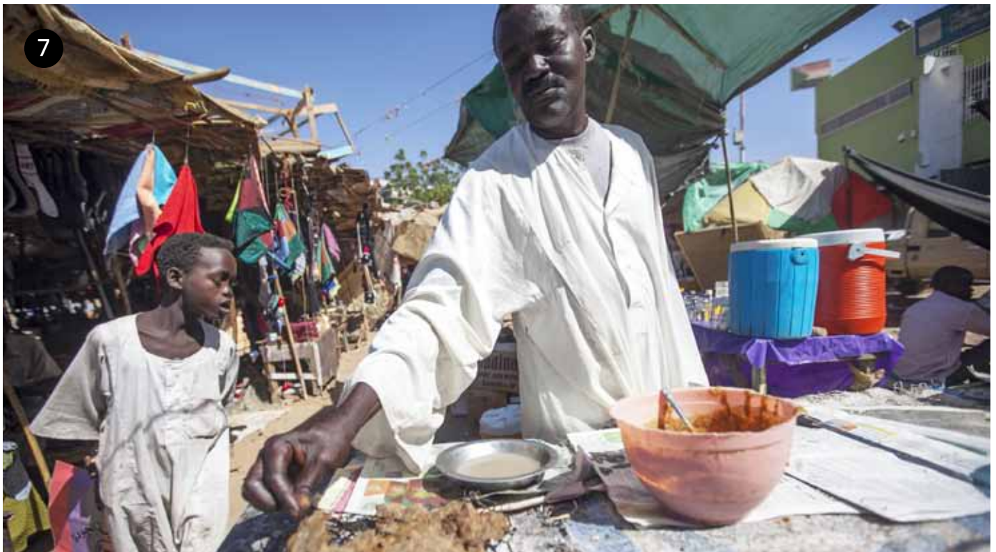
7 A restaurant owner pictured while cooking at El Fasher market in North Darfur. Shoppers here often stop for a meal at the local restaurants serving roasted meat and chicken.