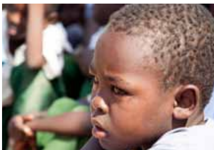
On 3 September 2013, a young child is pictured at the opening ceremony of a secondary school for girls sponsored by UNAMID in Shangil Tobaya, North Darfur.