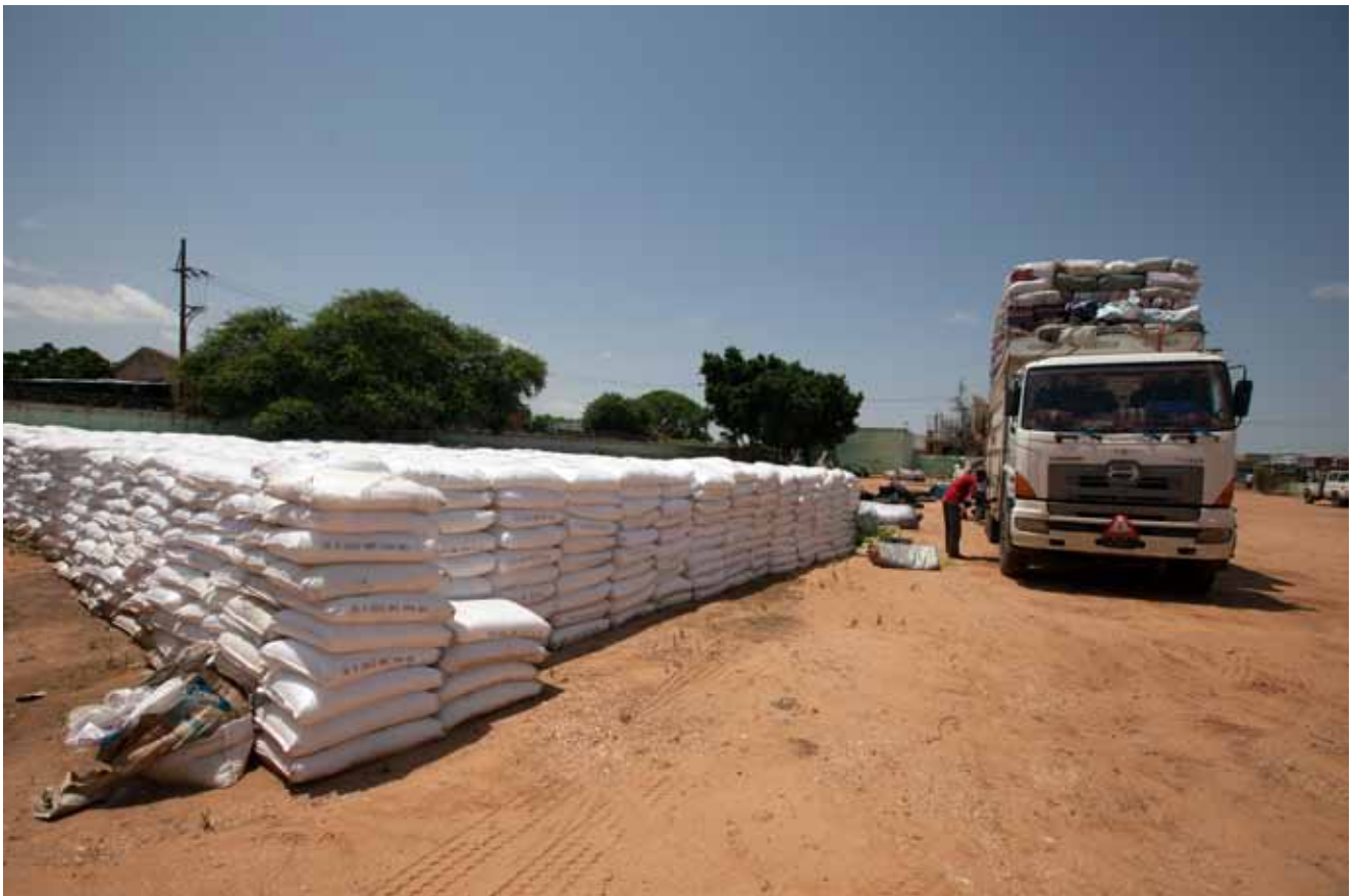
On 3 September 2013, a truck loaded with items for trade in the customs office waits for clearance in El Geneina, West Darfur, only a few kilometers from the Sudanese-Chadian border. Plans are underway to construct a free market zone in El Geneina to increase trade exchanges between Sudan and West African countries such as Nigeria, Niger, Cameroon, and so forth.

“The new airport in El Geneina facilitates mass movement to areas of Darfur that would, otherwise, be too distant. This is a boon, especially on account of the conflict and the security risks associated with road travel.”