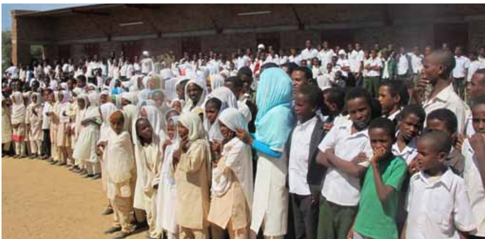
On 26 November 2014, pupils of the Masteriha School in North Darfur participated in an event organized by UNAMID to advocate against the recruitment and use of child soldiers.

On 26 November 2014, as part of its Darfur-wide campaign geared to prevent the recruitment of children as soldiers, the African Union-United Nations Mission in Darfur (UNAMID) reached out to the Masteriha community, North Darfur, through an event attended by more than 1,000 men, women and school children.