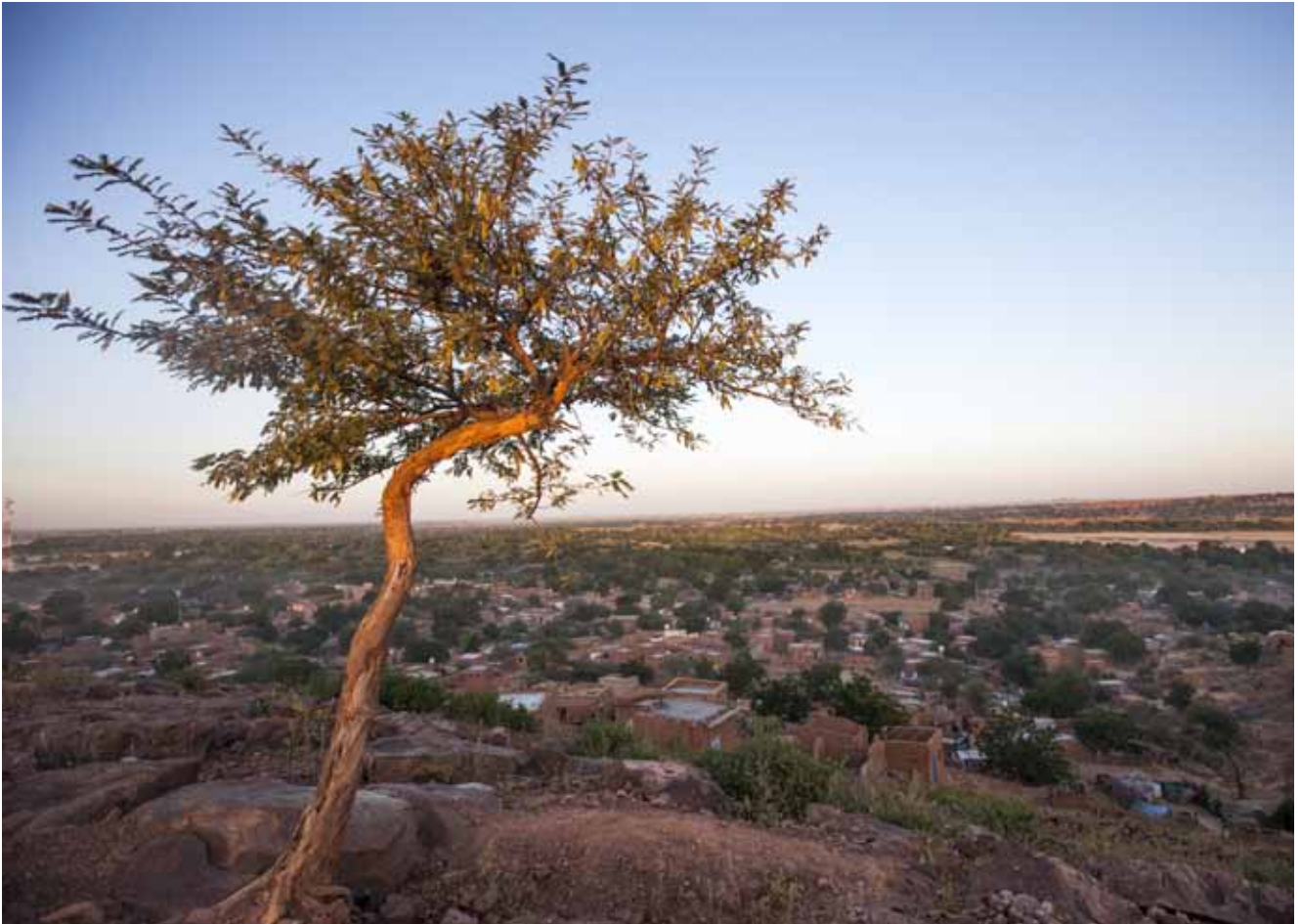
On 12 November 2014, the landscape of West Darfur's capital, El Geneina is photographed here. Located some 27 kilometers east of the Chadian-Sudanese border, El Geneina is an important transit point connecting the West and East coasts of Africa.