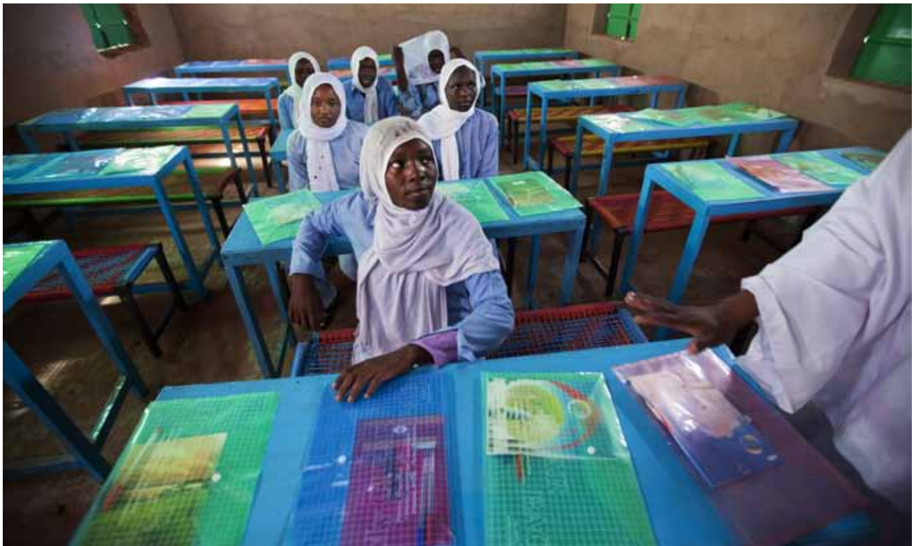
On 22 June 2014, students attend the opening ceremony of two new classrooms for a secondary school for displaced girls at Zam Zam camp, in EL Fasher, North Darfur. The construction took three months to complete and was sponsored by the UNAMID Turkish police contingent.

“As Police Advisers, we constantly try to dissuade families from allowing their children to beg in the marketplaces of Darfur and to enroll them in school instead.”