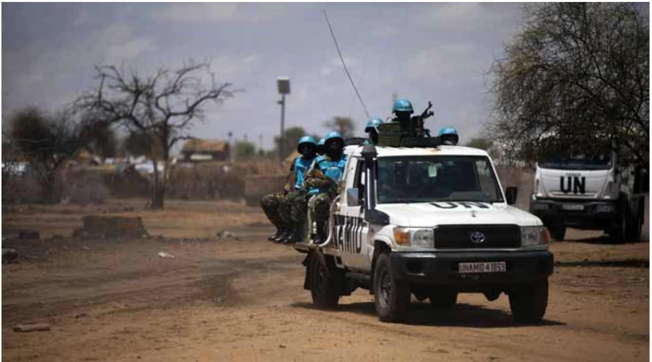
On 30 June 2014, UNAMID troops from Tanzania conduct a routine patrol in a camp for internally displaced persons (IDPs), in the vicinity of the Mission's compound in Khor Abeche, South Darfur. UNAMID troops deployed across Darfur conduct regular patrols to monitor the security situation and also to intervene preemptively whenever violence is imminent.

threat to civilians. These helicopters will also enable us to better assess security and conduct aerial patrols, thereby ensuring we cover larger areas; they will also help deter criminal elements.