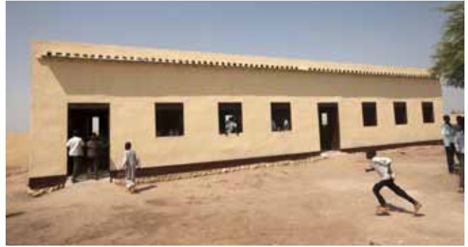
On 3 September 2013 in Shangil Tobaya, North Darfur, students celebrate the opening of the new Secondary School for Girls built in UNAMID's community-based, labour-intensive projects (CLIPs) programme.