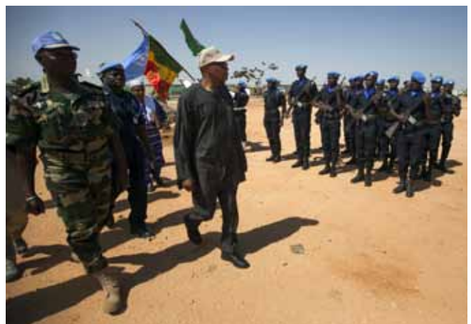
On 15 October 2013, UNAMID Joint Special Representative Mohamed Ibn Chambas visited the Mission's regional headquarters in El Geneina, West Darfur, following a 13 October ambush that led to the death of three UNAMID peacekeepers from the Senegalese Formed Police Unit.

The JSR noted that he is carrying a personal message from UN Secretary-General Ban Ki Moon and Under Secretary-General for Peacekeeping Operations Hervé Ladsous. "They both asked me to convey their deepest sympathies and encourage you to continue to resolutely discharge the noble duty you came to perform of protecting the vulnerable populations and working for peace in Darfur," he said. ■