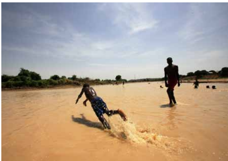
Darfur’s seasonal rivers provide entertainment for the children and young adults living nearby. The currents of the seasonal rivers are strongest immediately following the largest rainstorms. Swimming against the currents of the Kaja river in West Darfur, for example, is regarded as an extreme test of endurance.

Meanwhile, UNAMID continues to champion water initiatives with its local partners to develop short-, medium- and long-term water projects, operating under the theory that adequately addressing access to water not only will promote peace and foster more cordial relations between the various ethnic groups in the region, but also will further ensure economic growth and development.