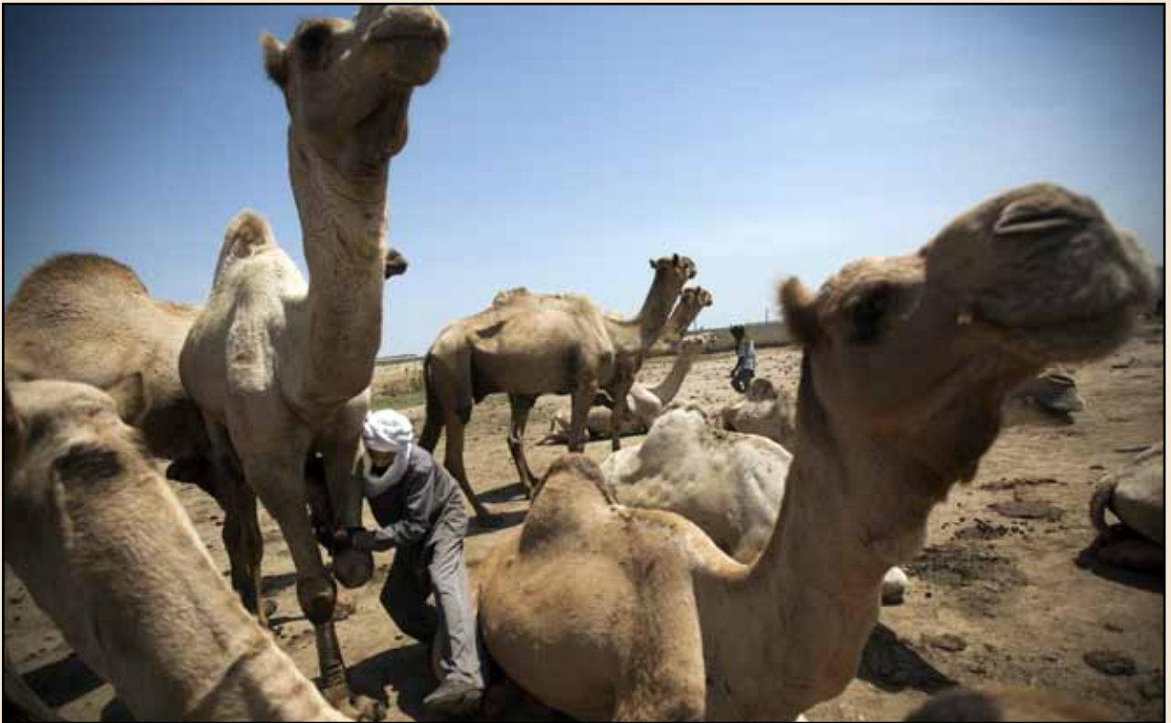
On 5 October 2013 , a trader ties the leg of a camel at the animal market in Forobaranga. This animal market is said to be one of the largest of its kind in Africa. Animals are exported from this point to Libya, Egypt and Saudi Arabia.