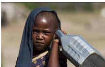
On 5 October 2013 in Forobaranga, West Darfur, a child fetches water at a water point built by a group of young farmers working as part of a UNAMID-funded project designed to teach vocational skills to at-risk young people.