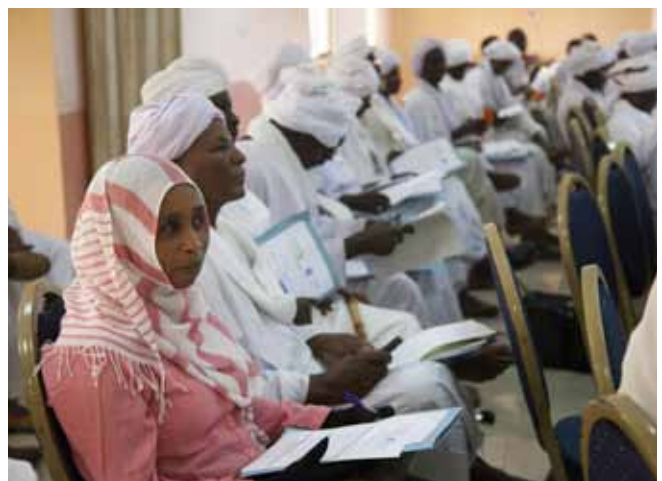
On 30 September and 1 October 2013 in El Fasher, more than 100 leaders from North Darfur participated in a conference to discuss the possible solutions to tribal conflicts.

Conference participants recommended setting up clear rules to manage land and natural resources; reform the rural courts; invest in livestock; re-