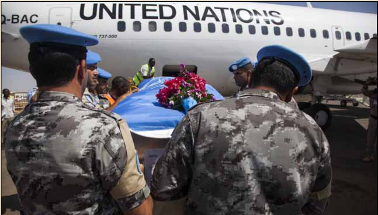
On 20 October 2013, members of UNAMID's Police component load a coffin containing a fallen Senegalese peacekeeper to be repatriated to Senegal. Three Senegalese peacekeepers lost their lives in an ambush in West Darfur on the morning of 13 October, while escorting a water convoy from El Geneina to UNAMID's regional headquarters in West Darfur.