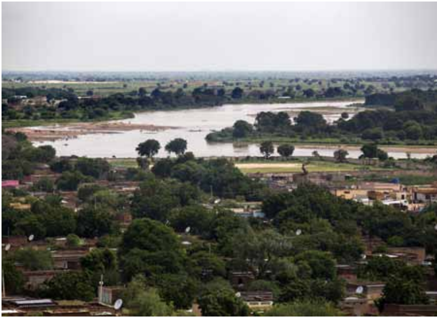
A seasonal river runs through El Geneina, West Darfur. When the waters flow into the valleys and the waters of the seasonal rivers rise, children gather to swim and enjoy some relief from the heat.

development in rural areas. Several of these projects have been engineered not only to save water, but also to divert it from areas that typically flood.