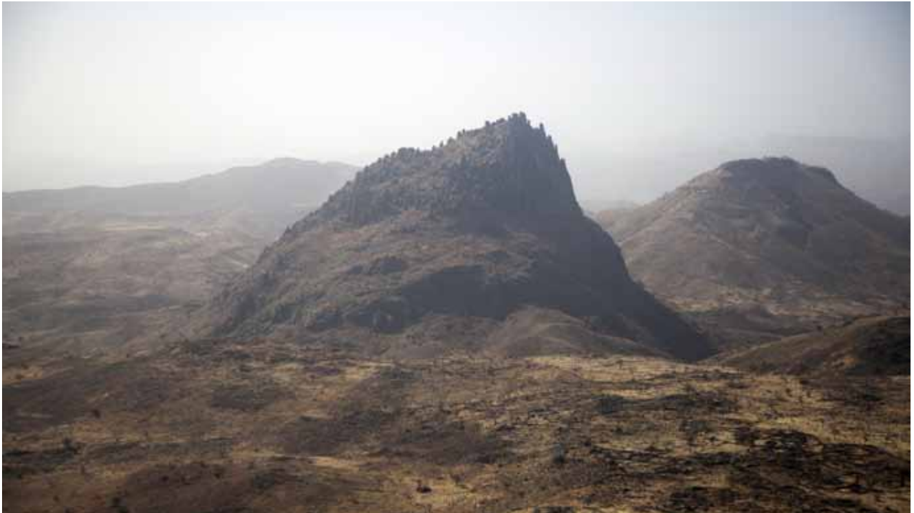
Most of Darfur's river valleys are fed by the rainwater that flows from the Jebel Marra mountains, located in the heart of Darfur. The Jebel Marra mountain range climbs to an elevation of more than 3,000 metres at its highest points.

Darfur's seasonal rivers—the wadis —remain a signature aspect of the region's stark landscape, and a foundation on which the social and economic lives of many of Darfur's people are built. These seasonal resources sustain the region's farmers and pastoralists, providing those living in the nearby lands with the water they need for farming and caring for their animals. In addition to supporting life in this region, the rushing waters provide relief from the heat of the desert and even entertainment for the children living near their shores.