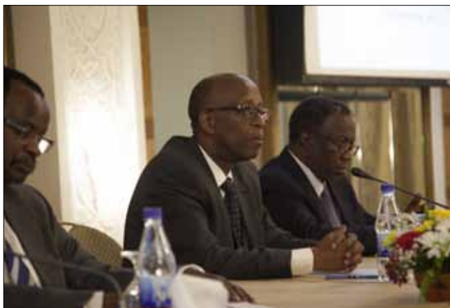
On 9 September 2013 in Khartoum, Sudan, UNAMID Deputy Joint Special Representative Joseph Mutaboba delivers a speech at a conference to address the root causes of the tribal conflicts in Darfur.

Following the meeting's general discussion, which focused on helping reverse the recent escalation of tribal vio-