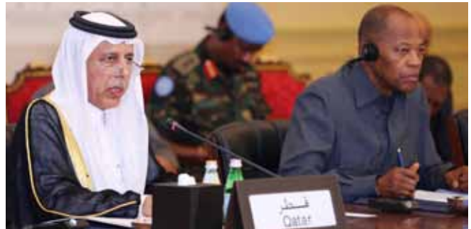
On 23 September 2013 in Doha, Qatar, UNAMID's Joint Special Representative and Joint Chief Mediator, Mr. Mohamed Ibn Chambas (right), attended the sixth meeting of the Doha Document for Peace in Darfur Implementation Follow-up Commission.

The JSR expressed satisfaction with the progress made in the area of justice, particularly with regard to the Special Court and the intention of the Special Prosecutor for Darfur to investigate the killing of the leader of JEM/Bashar and of seven UNAMID peacekeepers in Khor Abeche in July. He noted that more progress is required in the