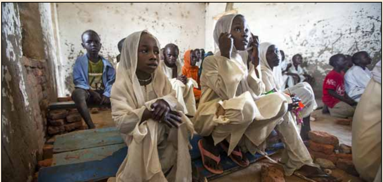
On 14 September 2013, internally displaced children attend class in the Bakht Alrida Primary School. The school, which has only four teachers for more than 300 students, lacks desks and chairs and is in need of rehabilitation.