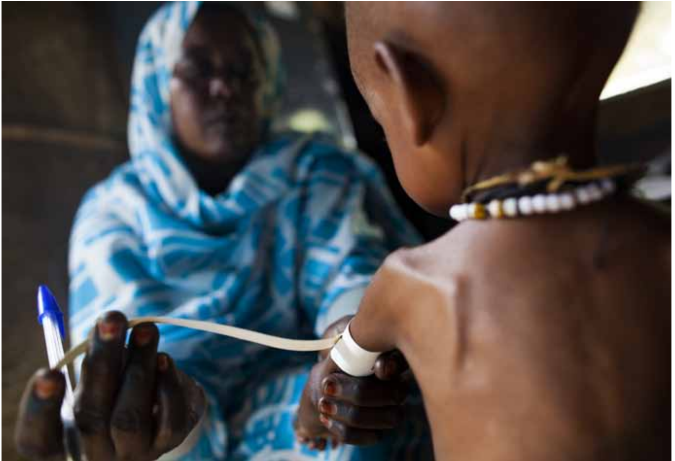
On 30 September 2013, in one of the health clinics in the Abu Shouk camp, a nurse examines a child. The health clinic is run by nongovernmental organisation Patients Helping Fund, with the support of UN agencies and the Government of Sudan.