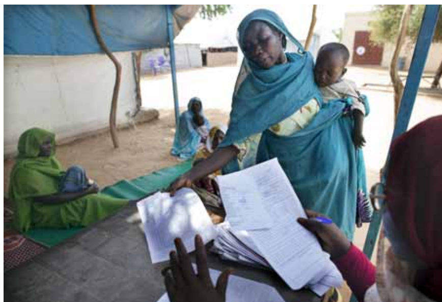
On 30 September 2013 in the Abu Shouk camp for displaced people, a nurse who is monitoring child malnutrition in the area provides a health record to a mother before she is seen by healthcare professionals at one of the three children's clinics in the camp.

Here in Darfur, and around the world, the United Nations is making a concerted effort to address the issue of child malnutrition. On 23 September 2013, UN Secretary-General Ban Ki-moon met with world leaders, business representatives and members of philanthropic organizations to fuel a final push to propel the world toward achieving all the objectives in the Millennium Development Goals (MDGs) programme, a massive undertaking focused on the addressing several of the world's most pressing issues. The MGDs range from halving extreme poverty rates to halting the spread of HIV/AIDS and providing universal primary education, all by the target date of 2015.