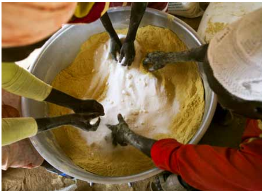
On 25 September 2013 in the Abu Shouk camp, volunteers prepare a food mixture, provided by the World Food Programme, for malnourished children.

There are three such children's health centres in Abu Shouk and two in the nearby Al Salaam camp. In addition to