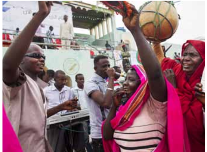
On 23 September 2013 in El Fasher, North Darfur, women wearing traditional Darfuri outfits dance in Al Zubair Stadium to help launch UNAMID's "We Need Peace Now" campaign. The event, organised by the Mission and the National Sudanese Youth Union, drew thousands of people and served to commemorate the International Day of Peace.

UNAMID's "We Need Peace Now" campaign, which is being rolled out across Darfur, is designed to encour-