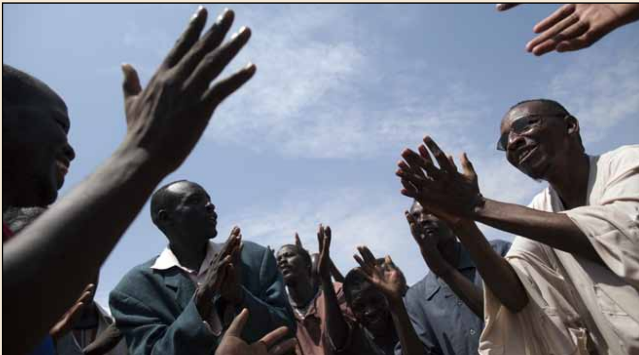
On 1 September 2013, inmates of Al Shallah Federal Prison dance during the opening ceremony of "Prison Social Week," a series of events sponsored by UNAMID in collaboration with the State Prison Administration of North Darfur to raise awareness about the role of prisons in facilitating the rehabilitation on inmates and preparing them for community reintegration.