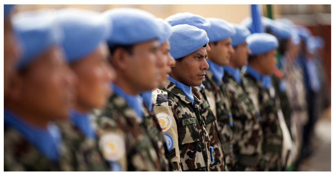
Peacekeepers from UNAMID's Military component stand in formation during the commemoration of the International Day of United Nations Peacekeepers at UNAMID headquarters in El Fasher, North Darfur.

n 29 May 2013 in El Fasher, North Darfur, the African Union - United Nations Mission in Darfur (UNAMID) ioined the UN worldwide in the commemoration of the International Day of United Nations Peacekeepers. The day, which was marked in Darfur's five states, provided an opportunity