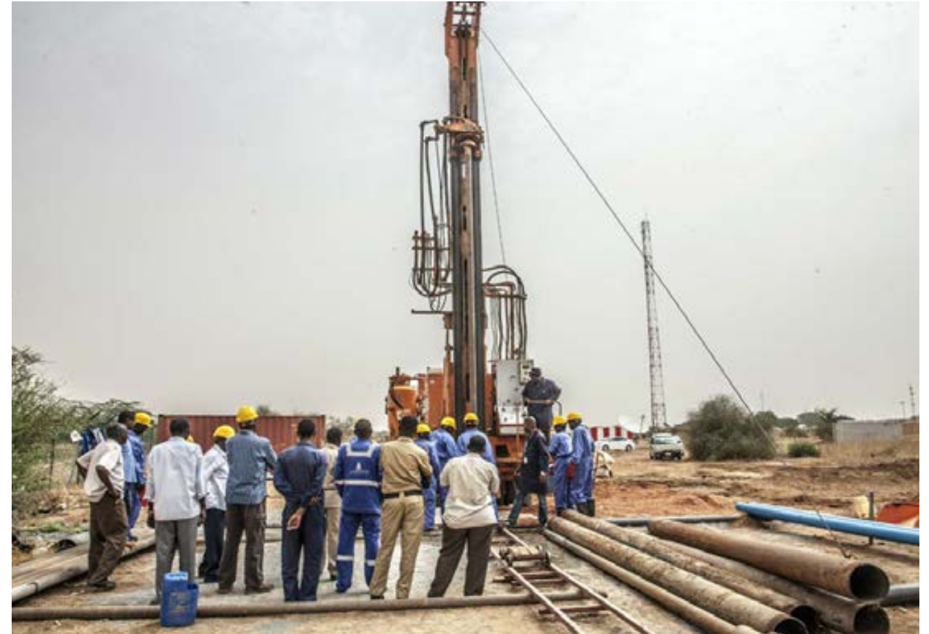
UNAMID's Water and Environmental Protection Unit finished drilling a borehole at El Fasher Airport terminal, North Darfur. The project, which will assist with the provision of water, is part of the Mission's support to local communities throughout Darfur.

EL FASHER – The completion of a UNAMID-supported borehole at El Fasher Airport, North Darfur, will help to meet the water and sanitation needs associated with a growing number of passengers. UNAMID's Water and Environmental Protection Unit finished work on the borehole on 5 July 2017. According to airport authorities, traffic at the airport has increased over the last couple of years, with growing numbers of people using the terminal building. As a result, the need for enhanced sanitation and hygiene facilities has similarly increased. For the past sever-