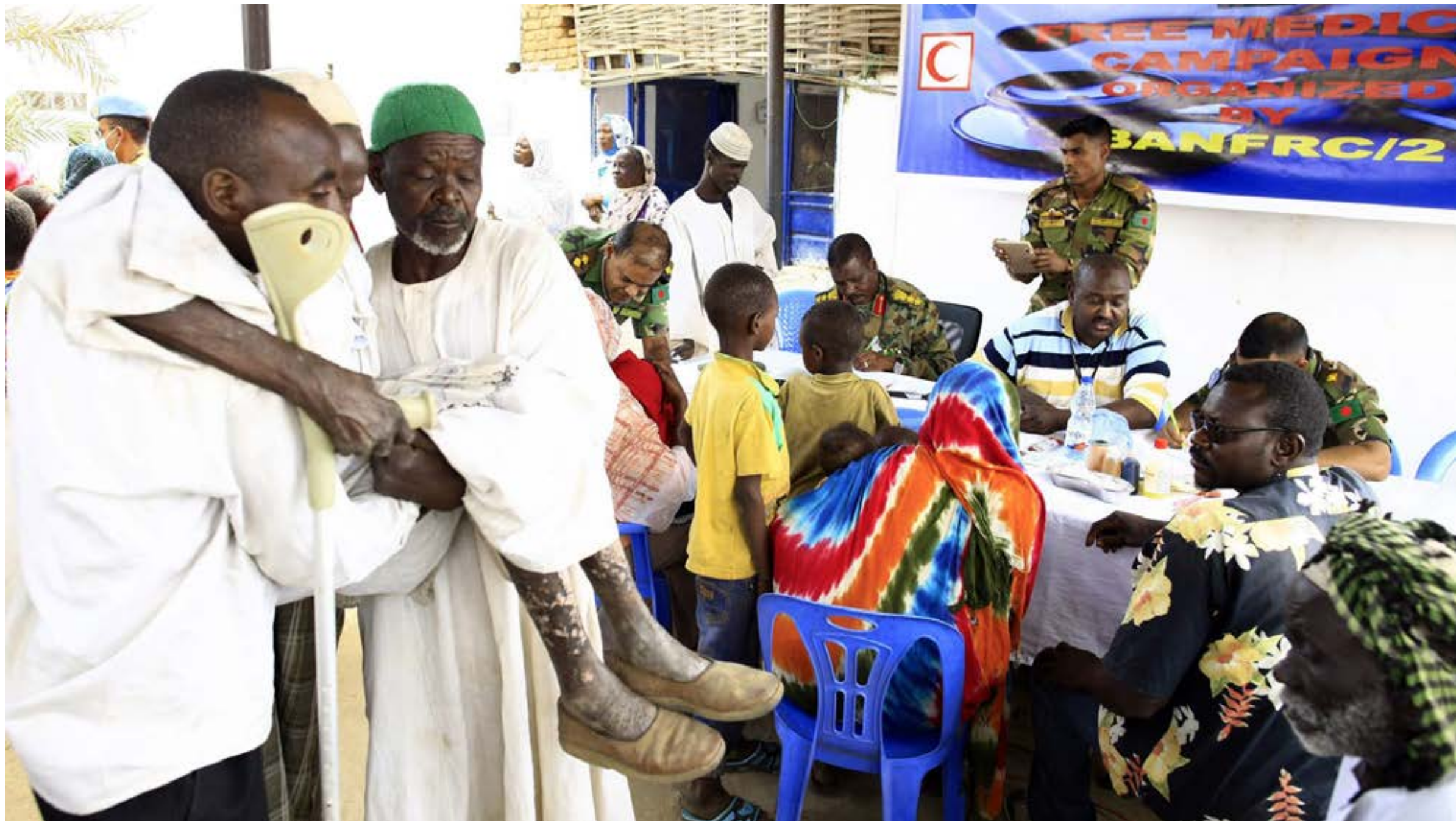
UNAMID's Bangladesh peacekeepers conducted recently a medical clinic at Ardamata camp for the displaced, in El Geneina, West Darfur, in partnership with Sudanese military health authorities. More than 400 people were reached including with free medical services, clothing and school materials.