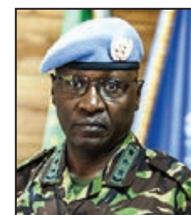
Lieutenant General Leonard Ngondi (Kenya) Force Commander