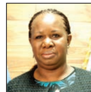
Bintou Keita (Guinea) Deputy Joint Special Representative- Protection