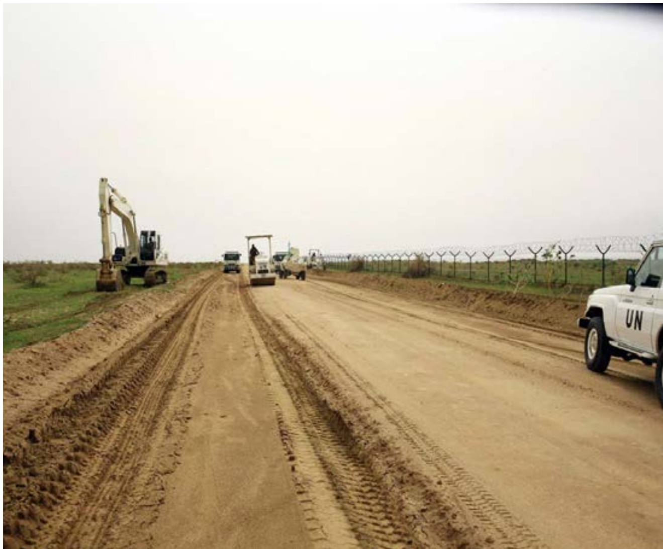
UNAMID officially handed over a newly-finished airport ring road in El Geneina to the State Government in West Darfur. The project, constructed by UNAMID peacekeepers as part of the Mission's support to local authorities, will facilitate movement at the airport and enhance security.

EL GENEINA – A new UNAMID-built ring road that will facilitate movement and enhance security at El Geneina airport has been handed over to local authorities on 6 July 2017.