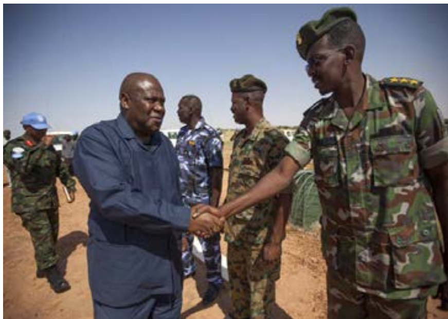
On 10 September 2017, UNAMID Joint Special Representative, Jeremiah Mamabolo visited Tine area, North Darfur, where he met with local authorities and community representatives.

moved forward with the reconfiguration programme?