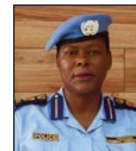
Priscilla Makotose (Zimbabwe) Police Commissioner