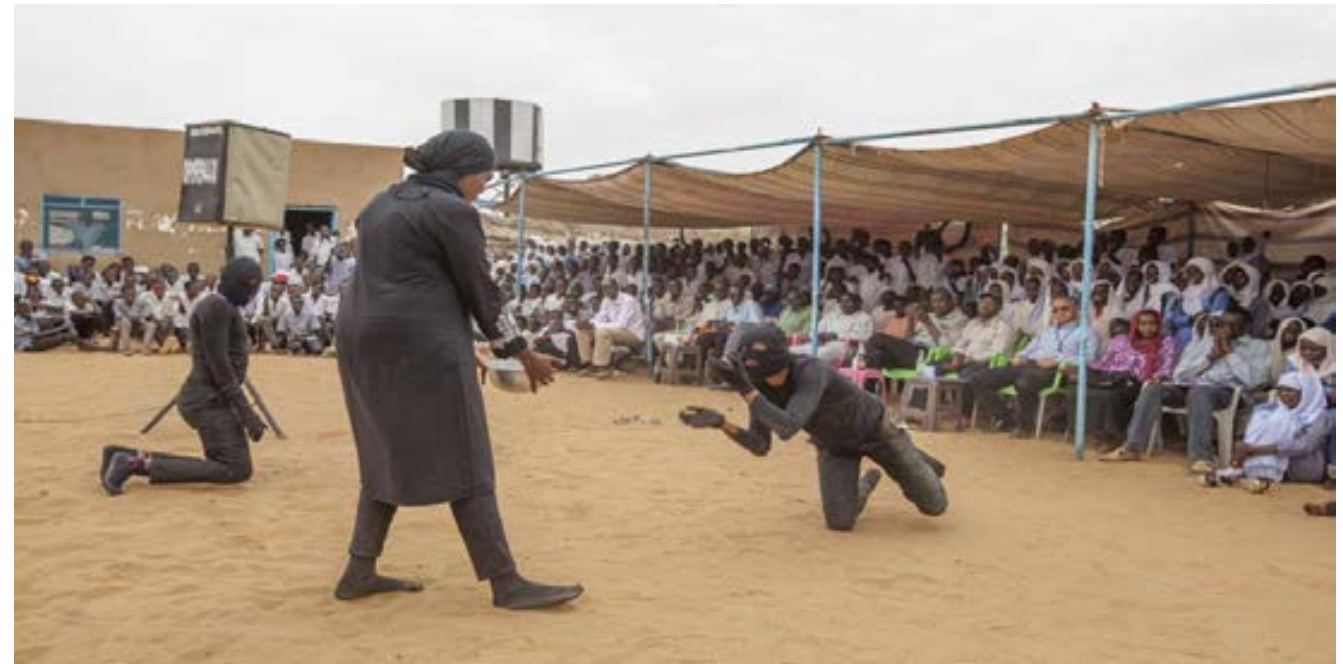
A Drama group perform a show during the event to commemorate the Nelson Mandela International Day, organized by UNAMID’s Community Outreach Unit at Zam Zam camp for internally displaced persons, near El Fasher, North Darfur.

18 July is globally marked as Nelson Mandela International Day, in recognition of the former South African President’s contribution to the culture of peace and freedom.