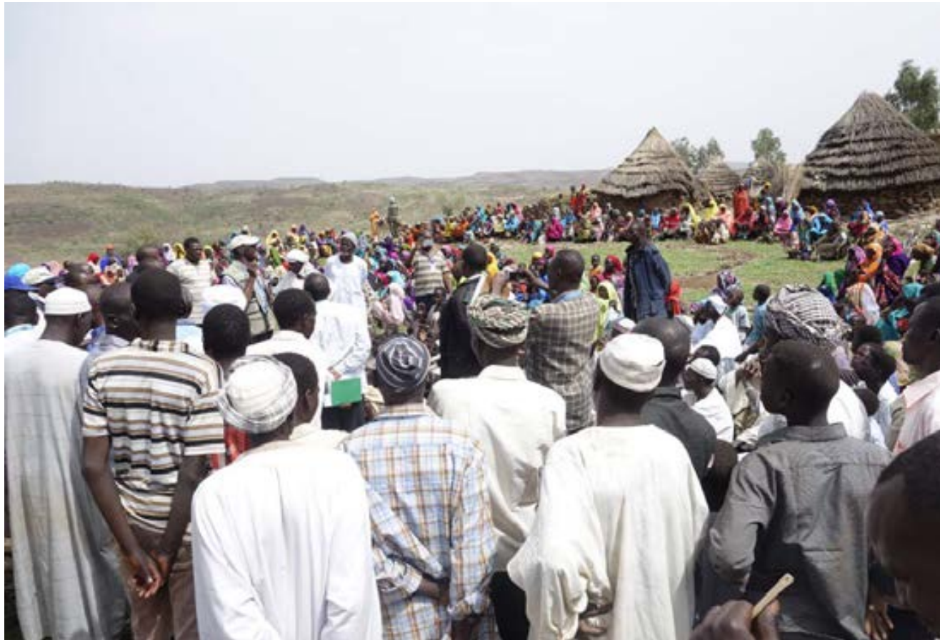
An inter-agency humanitarian assessment mission concluded a visit to Rockero in North Jebel Marra locality, Central Darfur on 9 July 2017. A Jointly led by the Office for the Coordination of Humanitarian Affairs (OCHA) and the Humanitarian Aid Commission (HAC), the mission included representatives of UNAMID, the UN Country Team, the Government of Sudan and non-government organizations.

ZALINGEI - Evaluating the humanitarian situation was a key focus of a recent inter-Agency Humanitarian Assessment mission to Rockero, North Jebel Marra locality, Central Darfur. The five - day mission – which also considered community needs and concerns -- included representatives from UNAMID, the UN Country Team, Government of Sudan and non-government organizations. It was jointly led by the Office for the Coordination of Humanitarian Affairs and the Humanitarian Aid Commission (HAC).