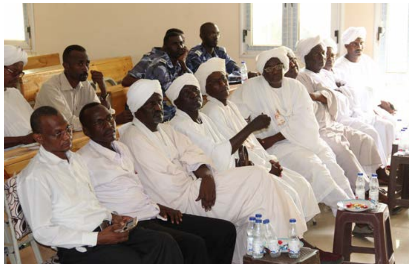
More than 70 people took part in a UNAMID supported workshop on Cross Border Peace and Cooperation, which was organized in partnership with the International Organization for Migration (IOM) and sponsored by the European Union on 12 July 2017.

EL DAEIN - Enhancing community stabilization and peaceful coexistence amongst pastoralist and sedentary communities in border areas was the aim of a UNAMID-supported workshop in El Daein, the capital of East Darfur.