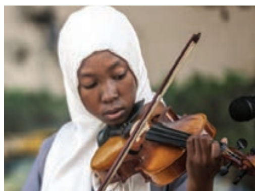
A student from El Fasher Secondary School for Girls while performing a musical play at a function organized by UNAMID's Communications and Public Information Section to disseminate the culture of peace in El Fasher, North Darfur.