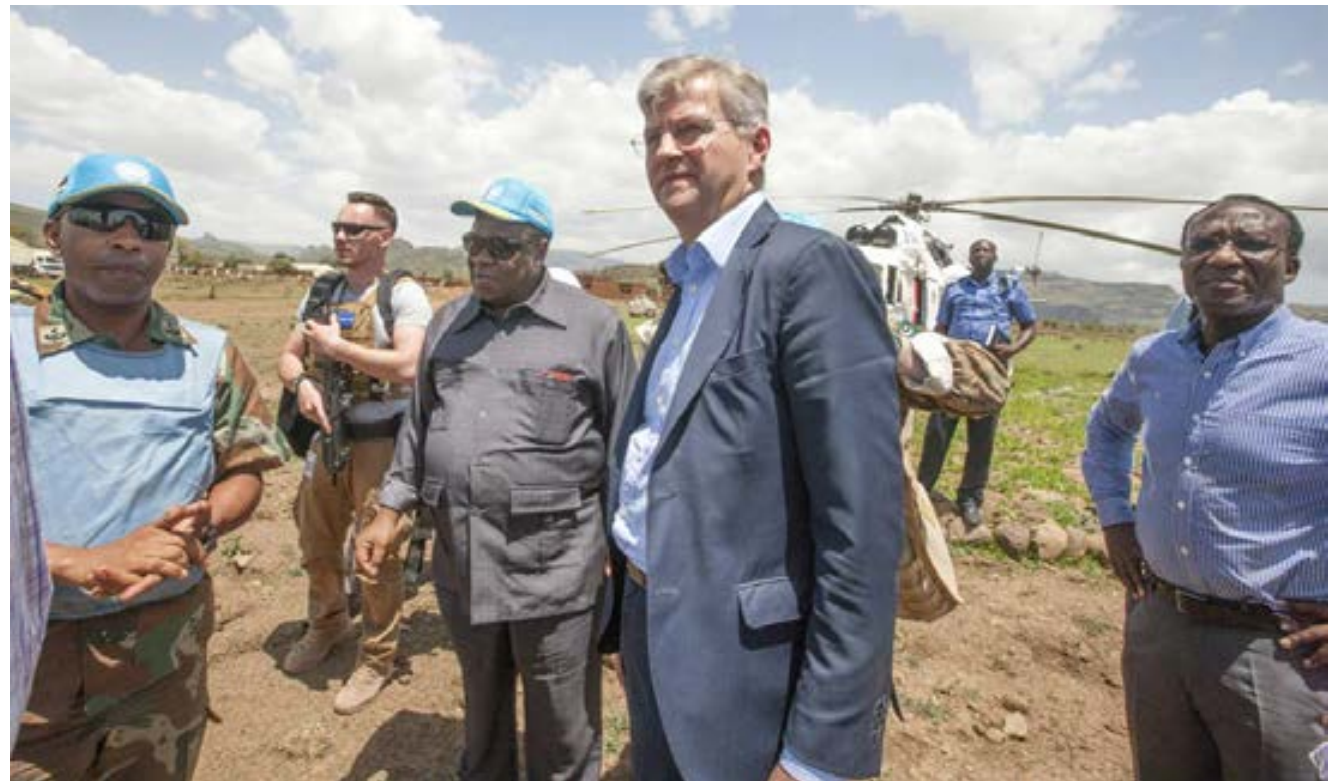
The United Nations Under-Secretary-General for Peacekeeping Operations, Jean-Pierre Lacroix visited Golo, a town in the vicinity of Jebel Marra, Central Darfur On 22 July 2017. During the visit, Mr. Lacroix met with local authorities and community representatives.

EL FASHER - The UN Under-Secretary-General for Peacekeeping Operations, Jean-Pierre Lacroix, has concluded a five-day visit to Sudan, during which time he met with Government officials, local authorities, community representatives and UNAMID peacekeepers.