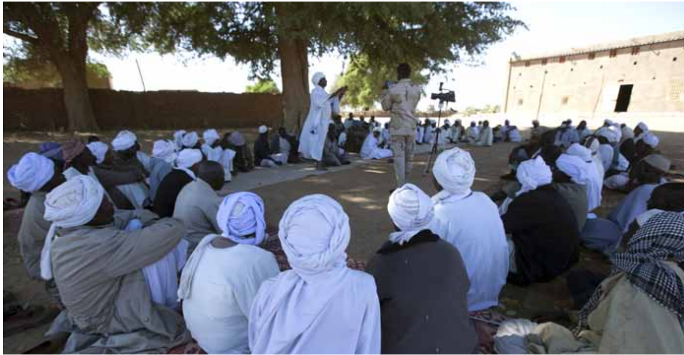
On 22 December 2015, Saraf Omra, Goodwill Committee and Peace Committee during a peace campaign supported by UNAMID's Civil Affairs Section in Saraf Omra, North Darfur.

ON 23 DECEMBER 2015 , a UNAMID-funded peace campaign concluded its activities in the localities of Kabkabiya, Alwaha, Elserf, Saraf Omra, Koma and Mellit, North Darfur. The event, started on 29 November, aimed at ending tension between farmers and pastoralists and strengthening social fabric among the various tribes living in those localities.