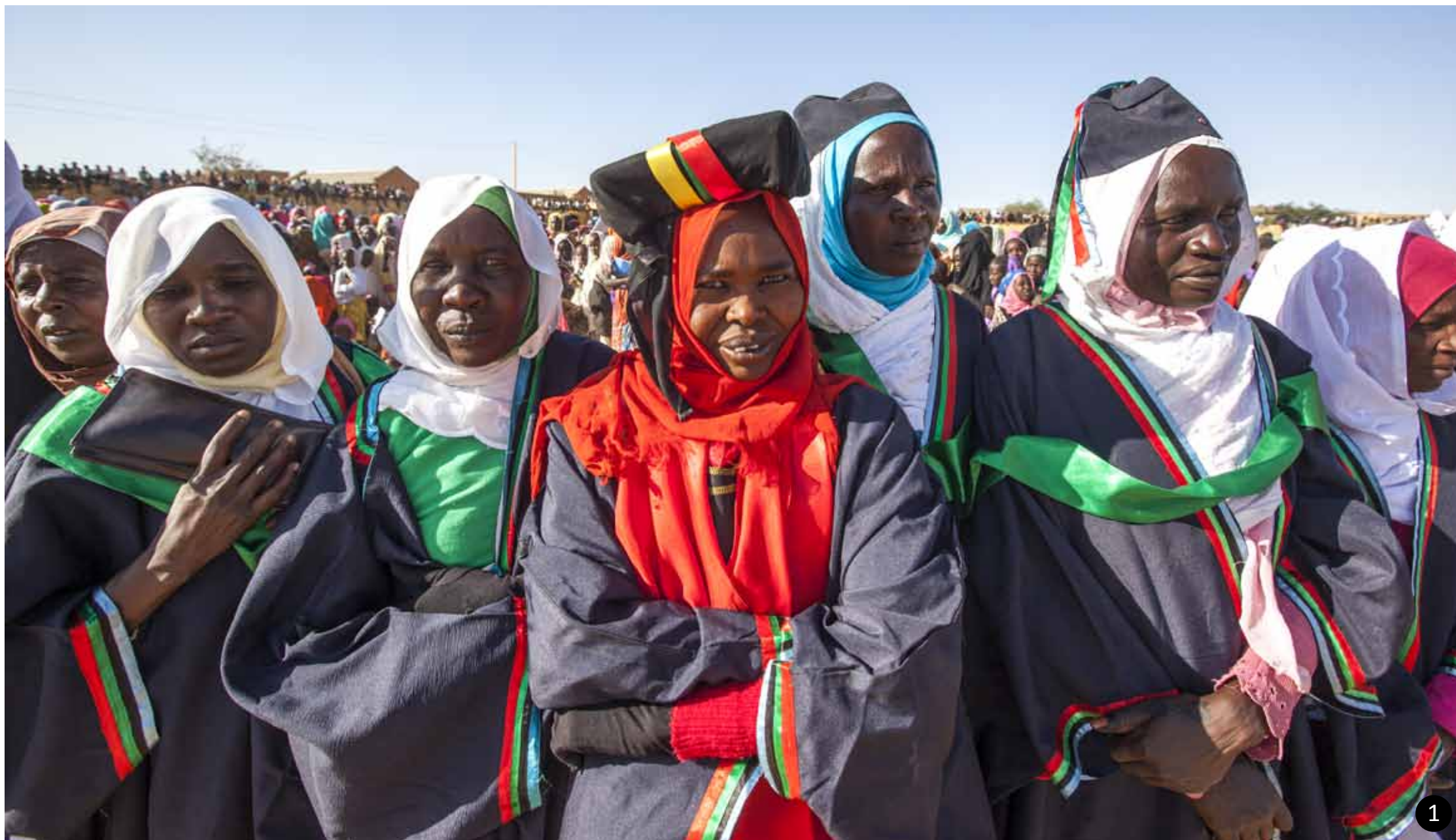
1 On 8 and 9 December 2015, UNAMID’s Communications and Public Information Section, in collaboration with the Open University of Sudan, organized a graduation ceremony for students of the university who completed their education between 2006 and 2013. The event which took place in Kutum, North Darfur, was attended by government officials, UNAMID staff, university professors and families of the graduates.

UNAMID intends to launch similar centres in Mallit, Um Kadada and Malha in the next two months. ■