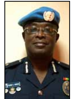
Frank Kwofie (Ghana) Deputy Police Commissioner

PUBLICATIONS UNIT Communications and Public Information Section (CPIS) - UNAMID Email: unamid-publicinformation@un.org Website: http://unamid.unmissions.org