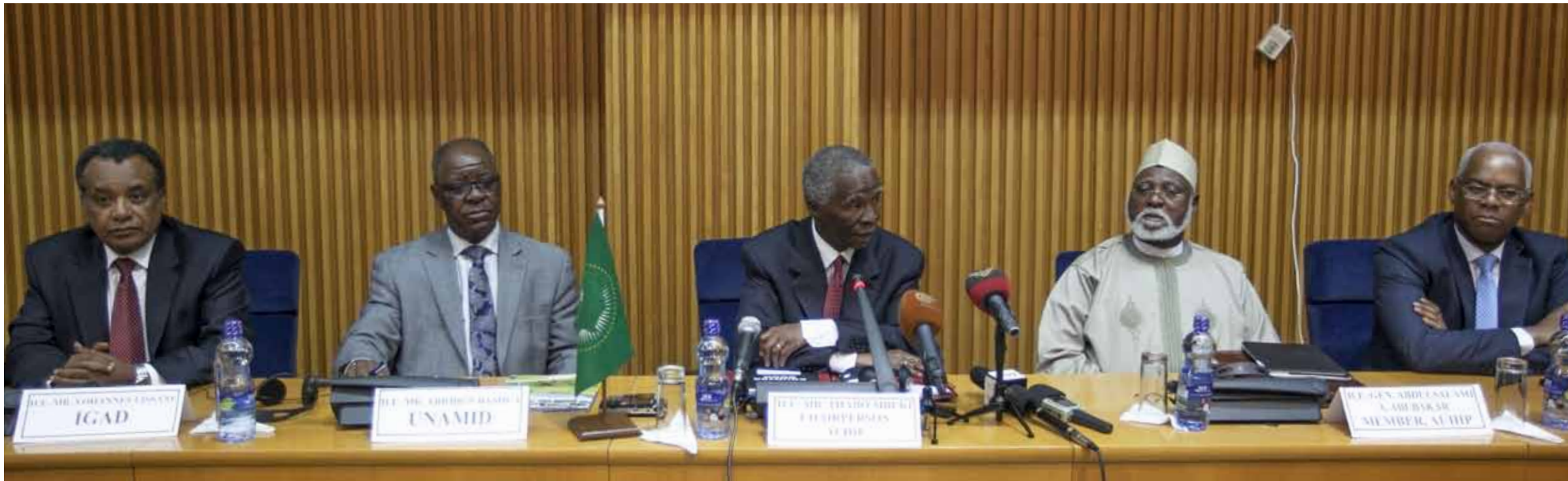
On 24 November 2014 Addis Ababa: The African Union-United Nations Acting Joint Special Representative and Joint Chief Mediator a.i. for Darfur, Abiodun Bashua, participated in the opening session of the negotiations between the Government of Sudan and non-signatory Darfuri movements in Addis Ababa, Ethiopia. The opening session was chaired by former South African President Thabo Mbeki, the Chairman of the African Union High-Level Implementation Panel (AUHIP), and attended by representatives from the African Union (AU), Intergovernmental Authority on Development (IGAD), Government of Sudan, Sudan Liberation Army/Minni Minawi and Justice and Equality Movement/Gibril.