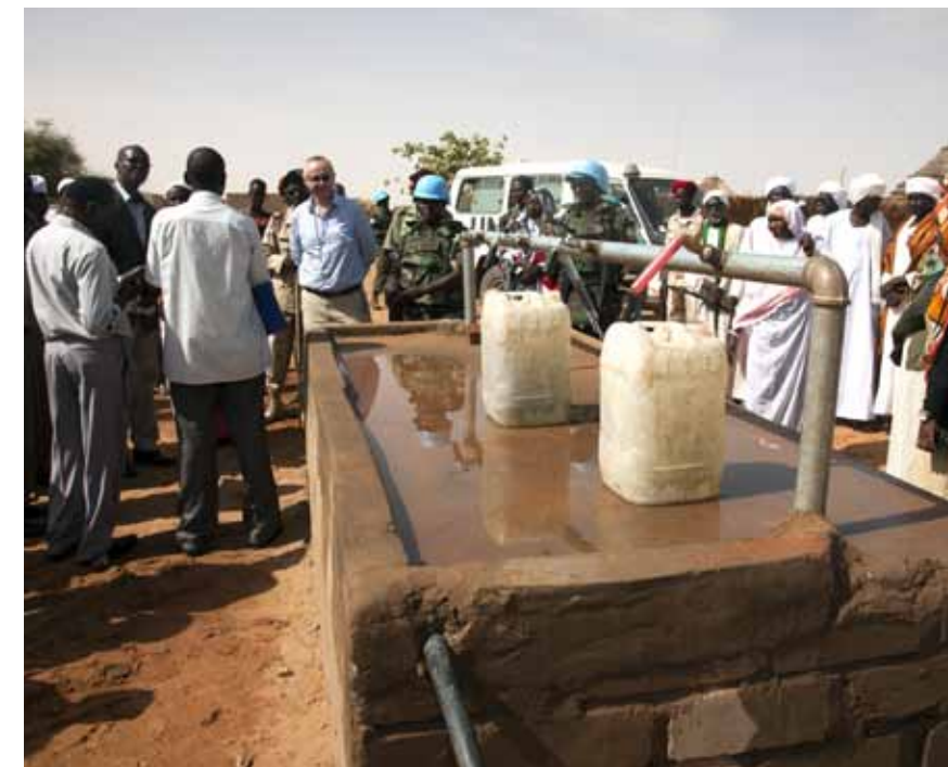
On 29 July 2015, UNAMID's Protection of Civilians and Humanitarian Liaison Section handed over a water supply connection two Quick Impact Projects (QIPs) in the areas of Shagra Hilat Abu Baker and Shagra Hilat Musa to Shagra community, near El Fasher, North Darfur. The project is part of the Quick Impact projects (QIP) funded by the Mission.

scarcity generally and, thereby, eliminate a major cause of the ongoing conflict."