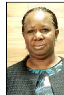
Bintou Keita (Guinea) Deputy Joint Special Representative