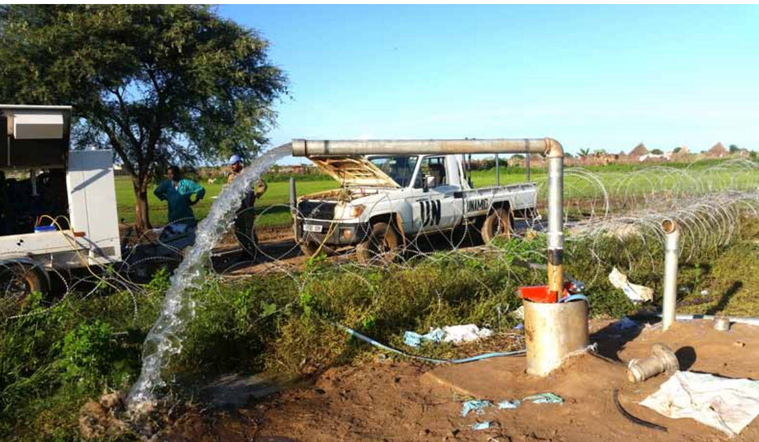
On 03 September 2015, UNAMID Water and Environmental Protection Unit (WEP) completed the installation of submersible pump and operation of UNAMID Water Well at El Daein, sector East. The well serves UNAMID compound and the local community in the area.

drilled two boreholes and provided two generators and operators for the general maintenance of these boreholes. Some 60 per cent of water extracted from these boreholes is added into the El Fasher urban water supply network to support the local populations living in the city, while the remaining amount is used by the Mission.