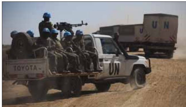
On 10 February 2014 in El Fasher, North Darfur, UNAMID troops escort a convoy of World Food Programme trucks traveling to Shangil Tobaya, North Darfur, to deliver much-needed assistance to internally displaced people in the area.