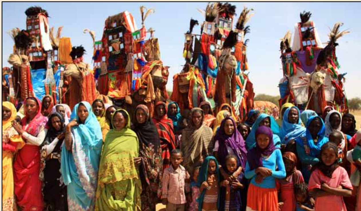
On 6 February 2014 in Asalaya, East Darfur, UNAMID inaugurated two quick-impact projects as part of the Missions' ongoing efforts to improve education and healthcare facilities for the semi-nomadic communities living in the area.