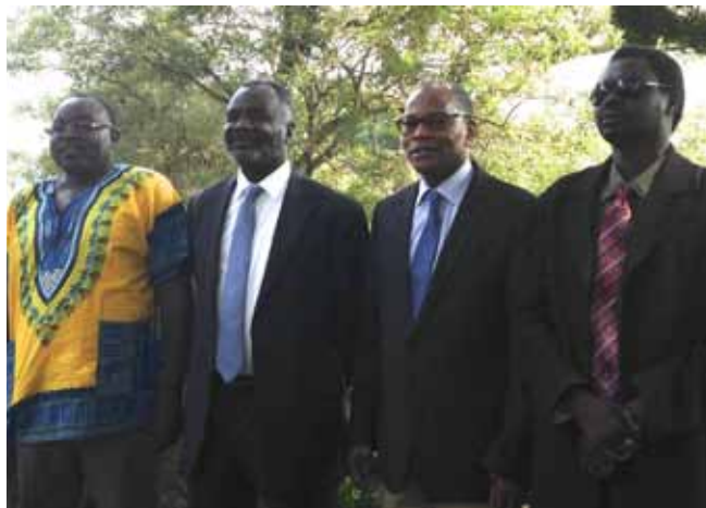
On 10 February 2014 in Kampala, Uganda, Dr. Mohamed Ibn Chambas meets with the leadership of the Darfuri non-signatory movements during a three-day visit to the country.

"We are ready to continue engaging with all the non-signatory movements to bring them on board the peace process and find a durable solution for the Darfur conflict," he said. "The only way forward is through dialogue, not violence."