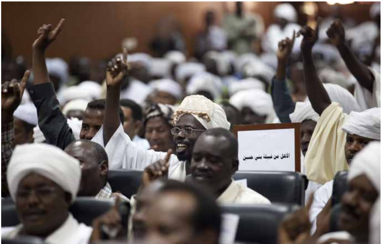
On 27 July 2013, at the offices of the Wali (Governor) of North Darfur, members of the Beni Hussein tribe cheer during the signing ceremony for an agreement designed to end the dispute with the Abbala related to the Jebel Amir goldmine. UNAMID's Civil Affairs section conducted mediation and reconciliation workshops leading up to the final signing ceremony.

Given the number of inter- and intra-tribal conflicts in Darfur, many of Civil Affairs' activities have involved promoting and facilitating local-level mediation and reconciliation efforts designed to restore peace and trust. UNAMID's Civil Affairs personnel have supported mediation in several conflicts involving different ethnic communities, facilitated reconciliation efforts and provided support to sustain local peace agreements and promote traditional reconciliation mechanisms.