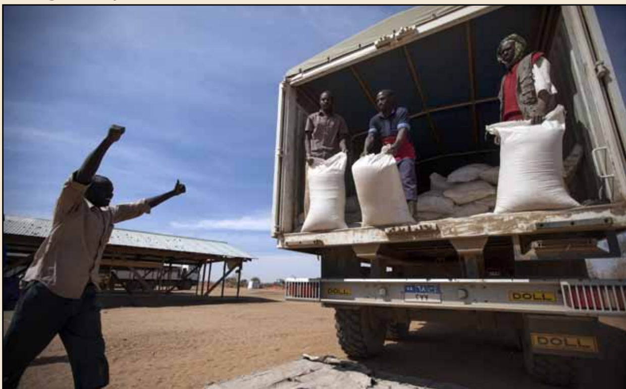
On 11 February 2014 in Shangil Tobaya, North Darfur, a resident of the Nifasha camp for displaced people greets his colleagues before helping distribute goods from World Food Programme trucks. The WFP convoy, protected by UNAMID peacekeepers, travelled 100 kilometres from El Fasher to Shangil Tobaya to deliver 350 metric tonnes of food.