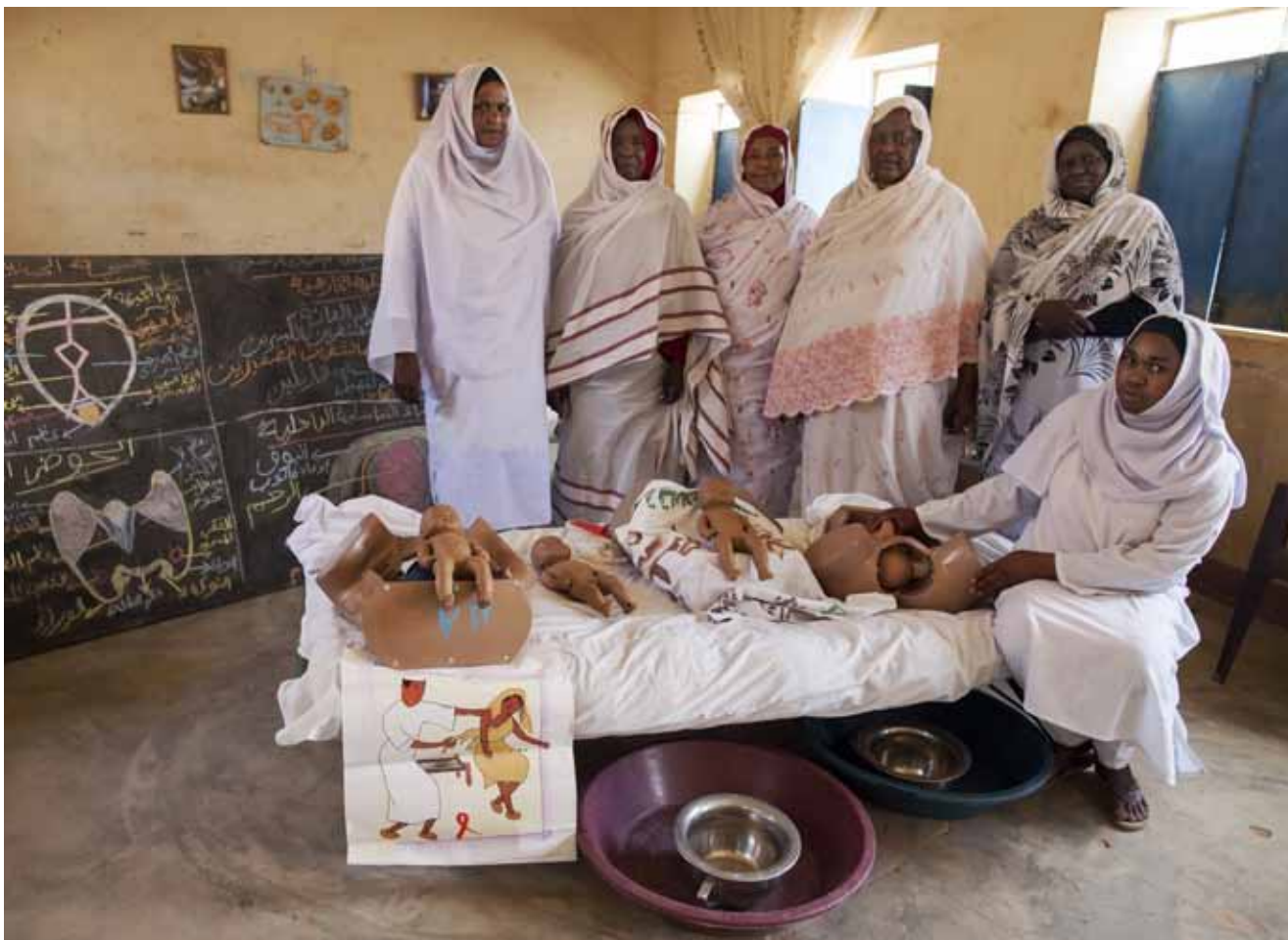
In Darfur, it is customary for midwives to perform female circumcision. However, an increasing number of midwives, such as those pictured here, are joining local organizations that are raising awareness about the negative physiological and psychological side effects of the practice, and are pledging not to perform the operations.

“From the legal point of view, we consider female genital mutilation as a form of gender-based violence and violence against children.” —Mohammed Salim