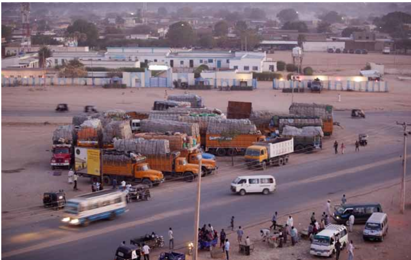
On 23 February 2014, trucks are loaded with goods for trade in Nyala, South Darfur. As more and more people flock to Nyala, trade with its neighbours has increased, nationally and internationally. In a strategic geographical location, Nyala serves as a key trade link with other towns in Darfur, with Khartoum and with neighbouring countries, such as Central African Republic and Chad.

the city. In March 2013, for example, 31 IDPs were captured during their journey to a two-day Nyala conference organized by the Darfur Regional Authority; the IDPs were later released. At the conference, more than 400 IDPs from across Darfur came together to discuss pressing issues, including voluntary return and resettlement, as well as security. The following month, fighting broke out between Government troops and an armed movement in Labado, 50 kilometres from Nyala. The hostilities decimated the area—the market, schools and the health care facilities were looted and destroyed—displacing nearly 30,000 people who fled to different IDP camps across South, East and North Darfur.