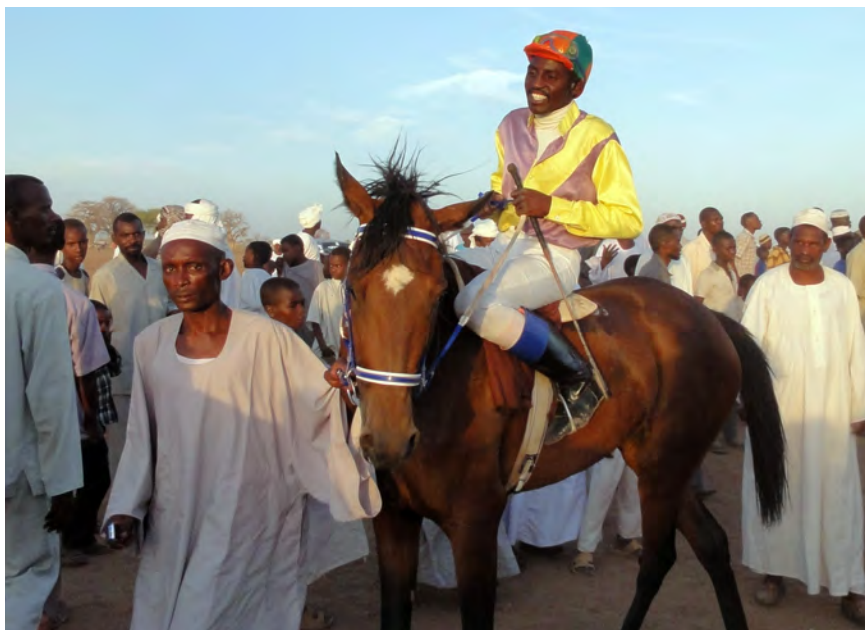
More than 2,000 spectators, along with UNAMID officials, troops and police attended the Nyala event on 4 May 2012.

Hakkamat singers, women clad in brightly colored thobes and decorated with symbolic armor, traditionally urge men into war. But at the Nyala horse race, they sang to encourage the horses and riders toward victory and to motivate the crowd to cultivate peace and reconciliation through the love of horse racing. ■