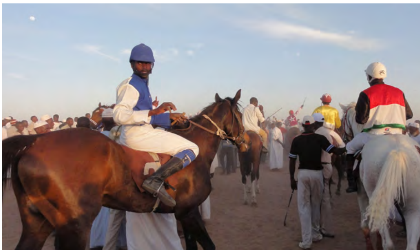
The Nyala Derby, rebranded on 4 May 2012 as a “race to peace,” is the second biggest racing event in Sudan, attracting prize horses, their owners and jockeys.

different tribes, he explains, suggesting that the best thing to keep people together may be horse racing. “If you go to a race, you know how many tribes are here, all laughing and enjoying it,” he says. “No one talks about politics or government, only horses; it is a social link between people.”