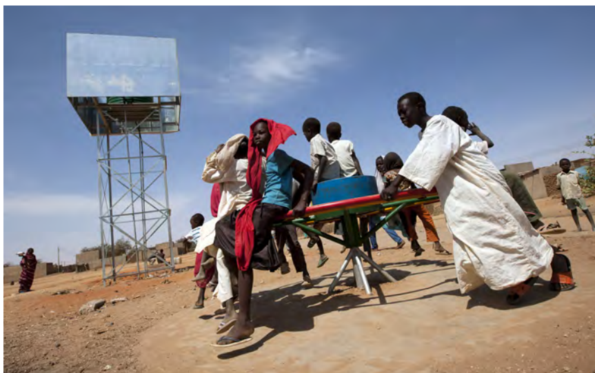
A UNAMID-sponsored rotating water pump, designed to draw water by children spinning at play in Abu Shouk internally displaced persons camp, North Darfur, 21 February 2012.

Yonis: The presence of UNAMID has brought peace and security to the people of Darfur. Prior to the coming of the Mission, the situation here was bad, but now the security situation is much better than it used to be, thanks to UNAMID and the support of the UNAMID workforce—military, police and civilian components—as well as the people of Darfur. The UN has really and immensely contributed in human and material resources to improve the situation here.