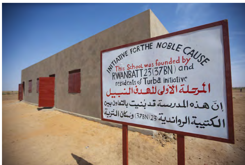
School rehabilitated by Rwandan battalion 23 as part of UNAMID's continuing efforts in early recovery and development, 3 April 2011.

able to provide a better working environment to ensure the wellbeing and welfare of the staff members. People are now comfortable and satisfied with the facilities on the ground, and the UN liberty flights are taking the staff members to Entebbe and Addis Ababa for their rest and recuperation, free of charge. We also have a gymnasium and games facilities, as well as a counselling office for staff members. Overall, the staff members are now happy and the atmosphere is generally conducive for working and socializing. ■