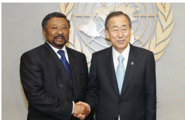
African Union Chairperson Jean Ping and United Nations Secretary-General Ban Ki-moon.

It is not unusual for IDPs to come out in droves to welcome visiting peacekeepers. Children and elderly alike typically extend a friendly hand or give the peacekeepers a thumbs-up, now a common feature in Darfur. Across Darfur, UNAMID is working to create functioning and lasting relationships through similar projects. As a result of these recovery-and-development activities, security has improved in most