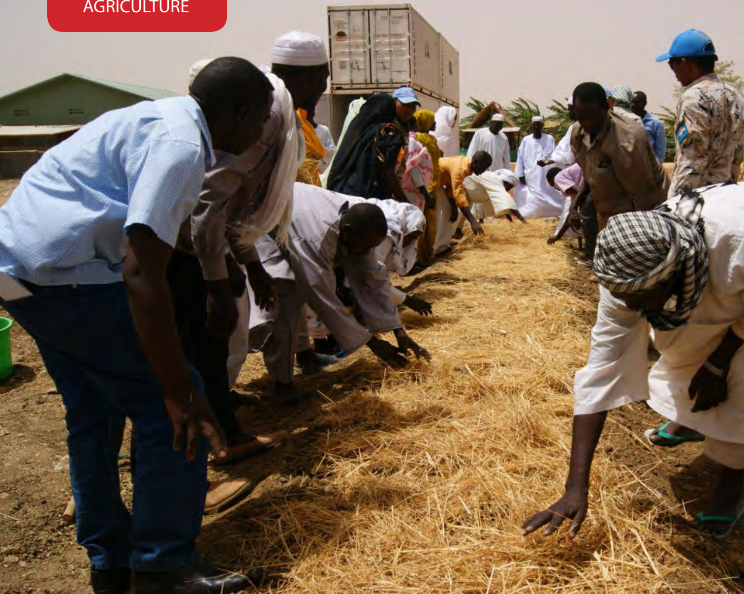
Thai peacekeepers in Mukjar, Central Darfur State, teaching methods for making microorganisms using local materials.