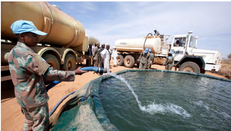
UNAMID South African peacekeepers, based in Kutum, provided 30,000 liters of water for the local population in Forog, North Kutum, North Darfur, to help them build a clinic, 28 March 2012.

On issues relating to the environment, we are working with UN Environment Programme (UNEP). And for land and other problems between the nomads and farmers, we are working with UN-Habitat to address the thorny issues. In addition, we are working closely with the communities and other partners to bring the communities together. Our civil affairs unit is working to engage the