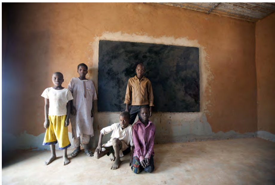
Children in Abu Shouk camp for internal displaced persons, North Darfur, pose in a classroom sponsored by UNAMID as a quick impact project, 18 April 2012.

In addition, the Mission has been providing support to UN agencies, NGOs and line ministries by making available its logistics assets and security escorts for early recovery initiatives and projects in Darfur. For example, UNAMID recently facilitated the air transport of animal vaccines from Khartoum to El Fasher for a Darfur-wide livestock vaccination campaign organised by the UN Food and Agriculture Organization (FAO) and the Ministry of Animal Resources. In addition, we transported UNICEF personnel and cargo (300 kg of vaccines and vitamins), via air, for a Darfur-wide polio vaccination campaign organized by the World Health Organization and the Ministry of Health and facilitated the air transport of UN High Commissioner for Refugees (UNHCR) non-food items to Seyhjana and Tawilla/Tabarat in North Darfur.