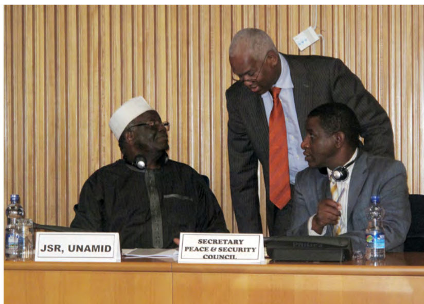
Joint Special Representative Ibrahim Gambari in Addis Ababa briefing the AU Peace and Security Council on UNAMID activities, 28 November 2011.