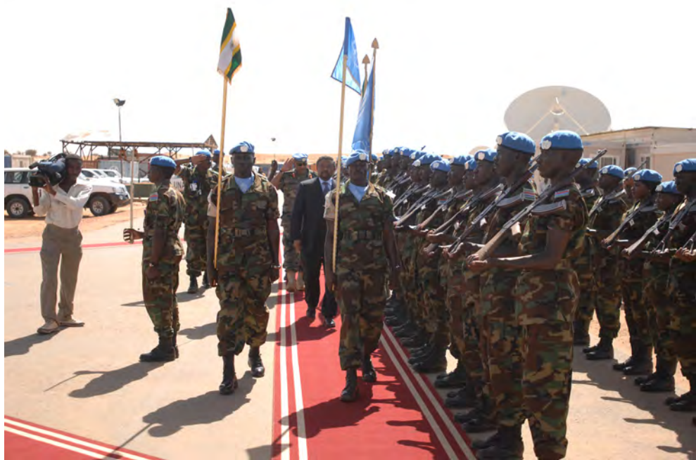
AU Chairperson Jean Ping visits UNAMID headquarters in El Fasher, North Darfur, 6 June 2011.

Despite initial challenges, the AU-UN partnership is facilitating a strategy that goes well beyond military and police protection operations and focuses on assistance designed to strengthen the