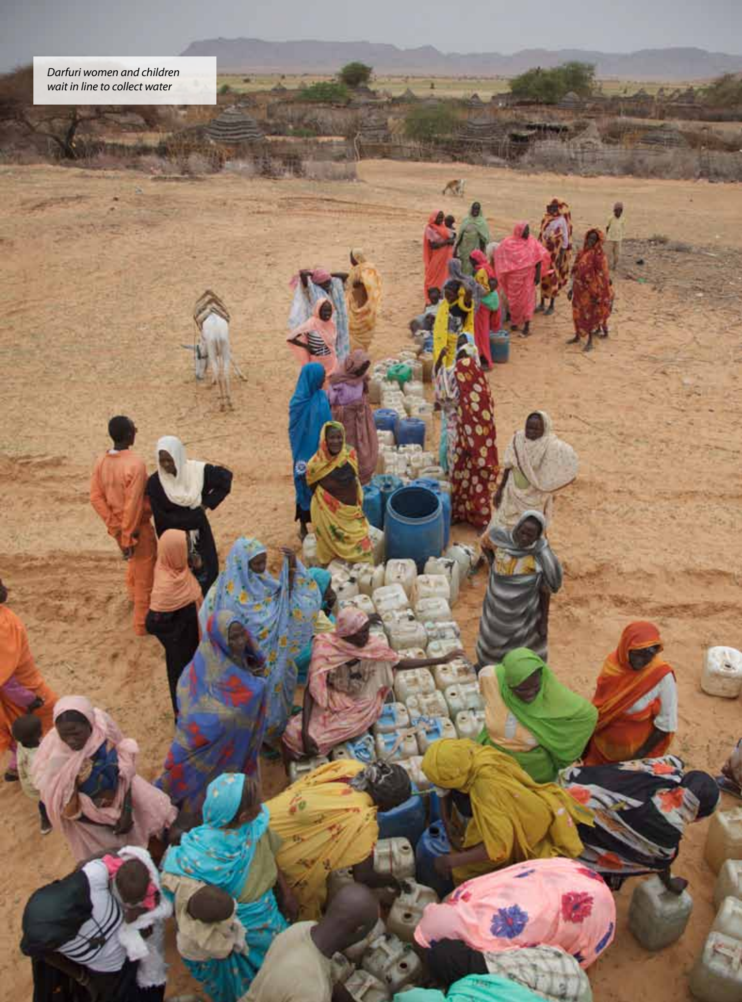
Darfuri women and children wait in line to collect water