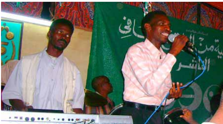
Performers from the Council for development through cultural reality