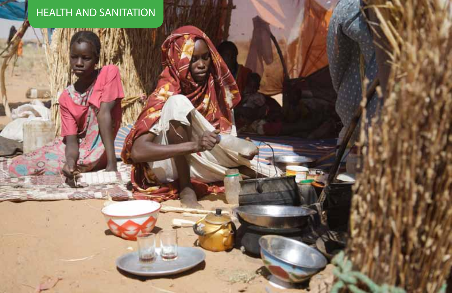
An internally displaced woman prepares a meal in Zam Zam camp, North Darfur