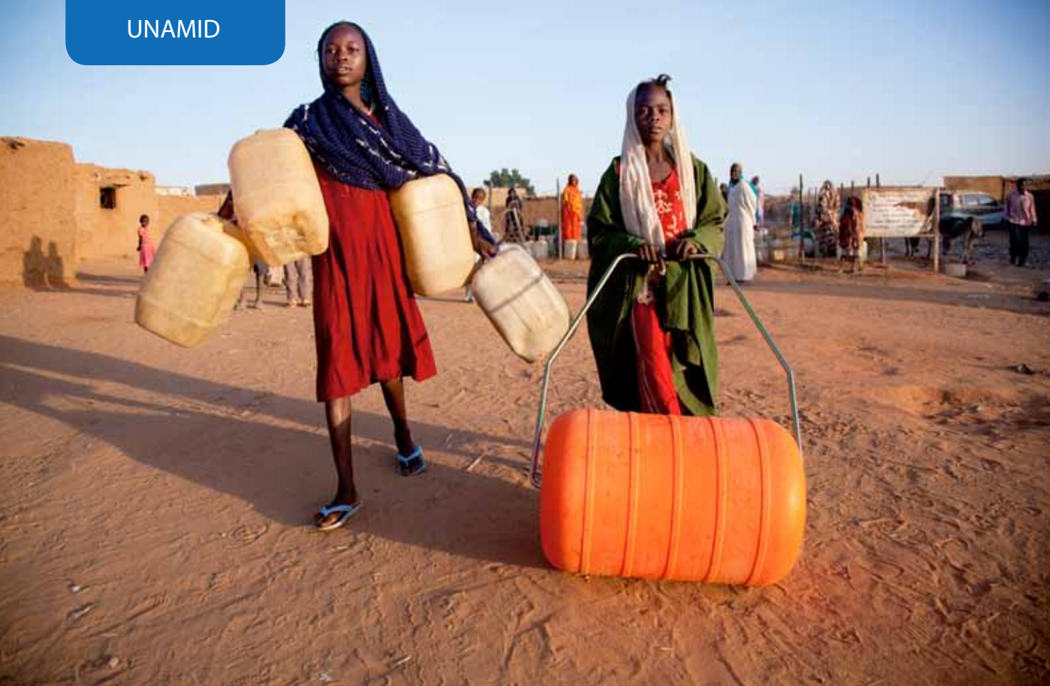
Children taking water rollers to a water point in Abu Shouk IDP camp