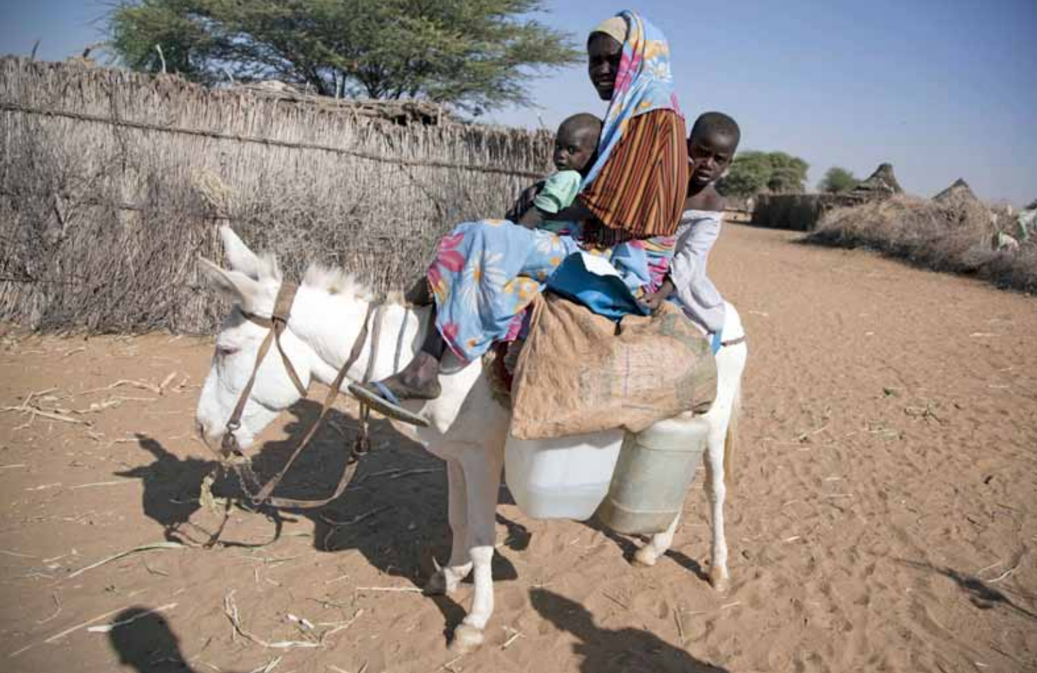
A family from Ghareiga village (North Darfur) spends almost 2 hours every day collecting water from Zam Zam camp, the only place where they can find potable water