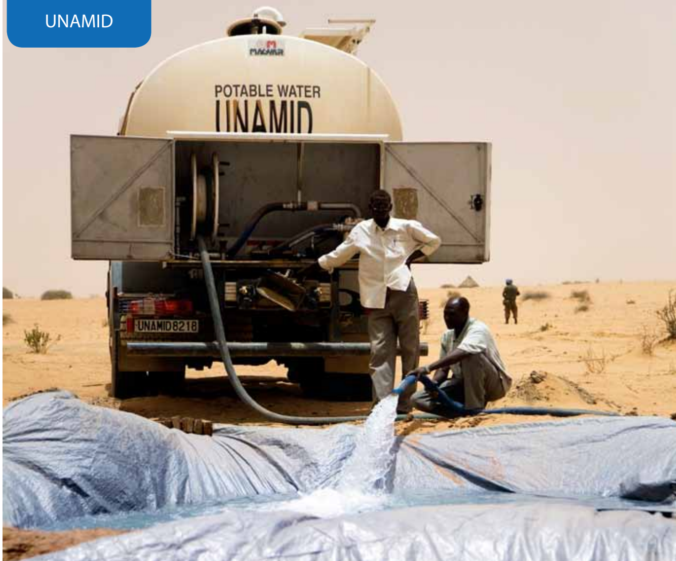
UNAMID delivers 40,000 litres of water to Tora village in North Darfur