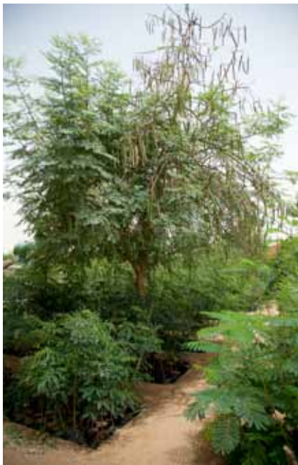
A Moringa tree at the National Forest Corporation nursery in El Fasher

Practical Action, in collaboration with local community based organizations, distributes seedlings of diverse trees to 13 communities in North Darfur. This initiative joins collective efforts to promote the importance of replanting to help in the greening of the environment.