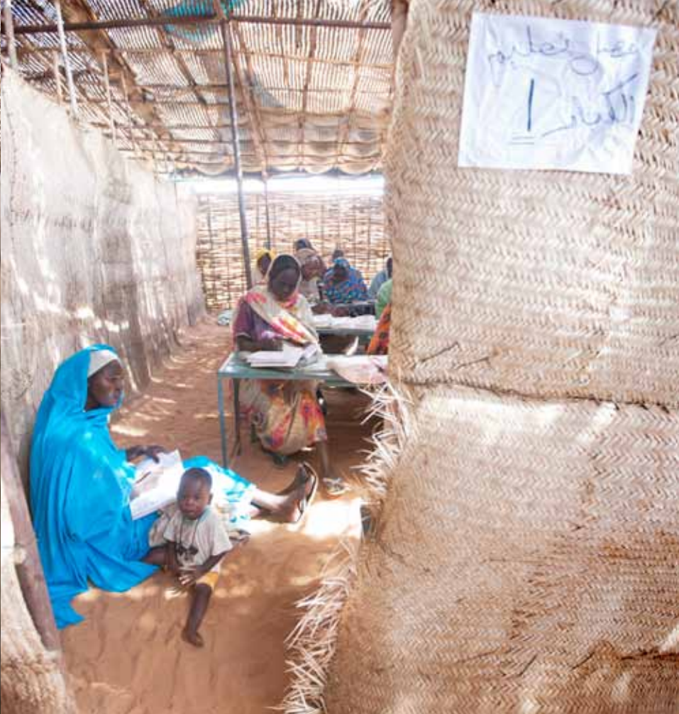
far left. Students learn mathematics in Abu Shouk Women Center.

resources to organize extra projects, but the center remains committed to its aim of offering women the possibility of studying.