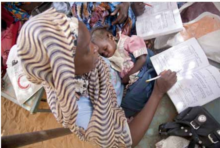
top and bottom. Several women attend the classes with their babies.

Despite the old traditions that kept girls away of school, everyday more women in Darfur discover the power of literacy. It is indeed a fundamental right and it is a tool to enhance human capabilities and eradicate poverty.