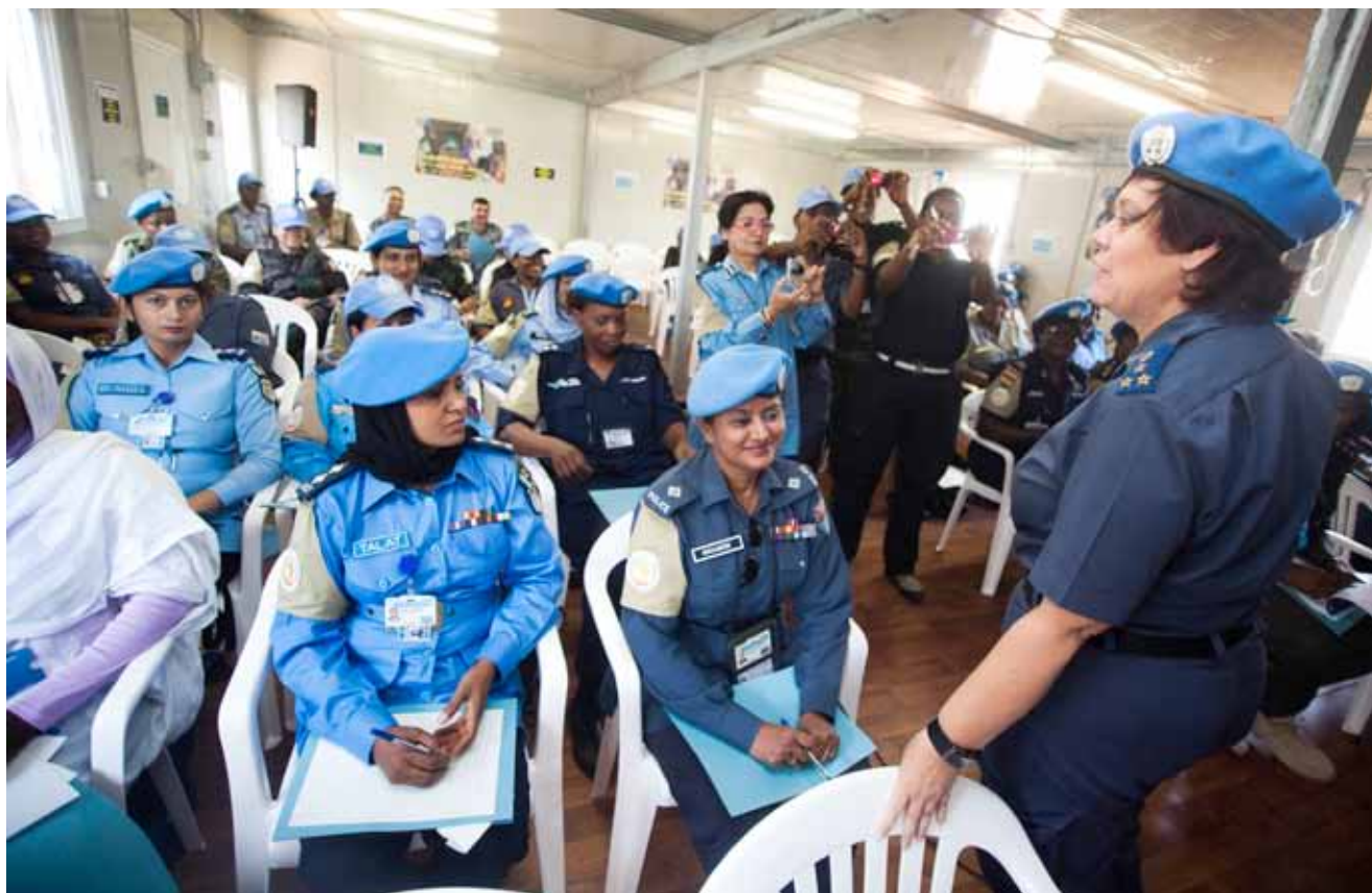
UNAMID Deputy Police Commissioner Hester Paneras in a preparatory meeting of the Police Women Network.