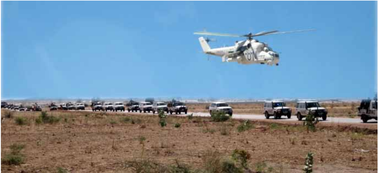
An Ethiopian tactical helicopter escorts UNAMID's long range patrol.