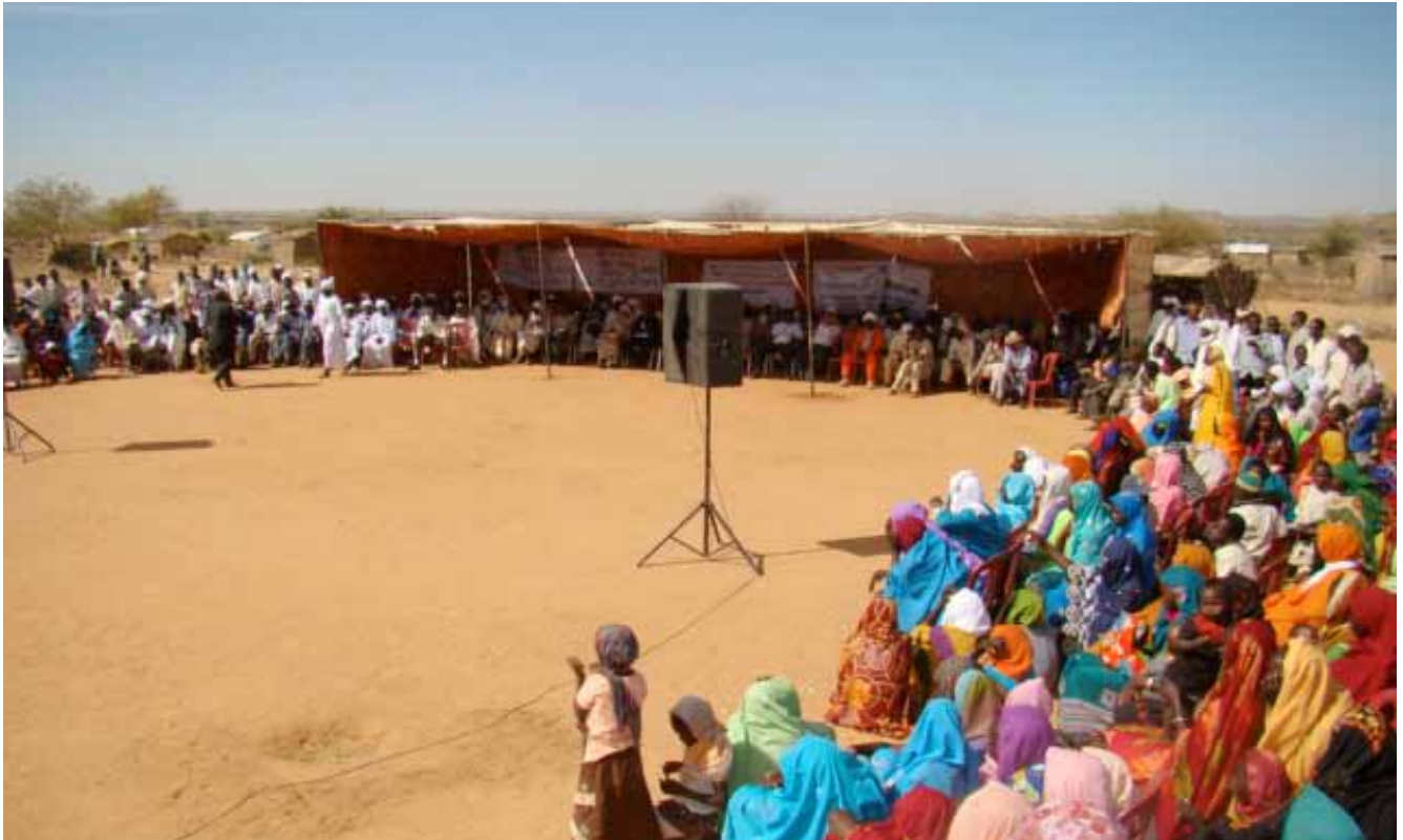
Drama presentation on unwanted marriage in Nyoro village.