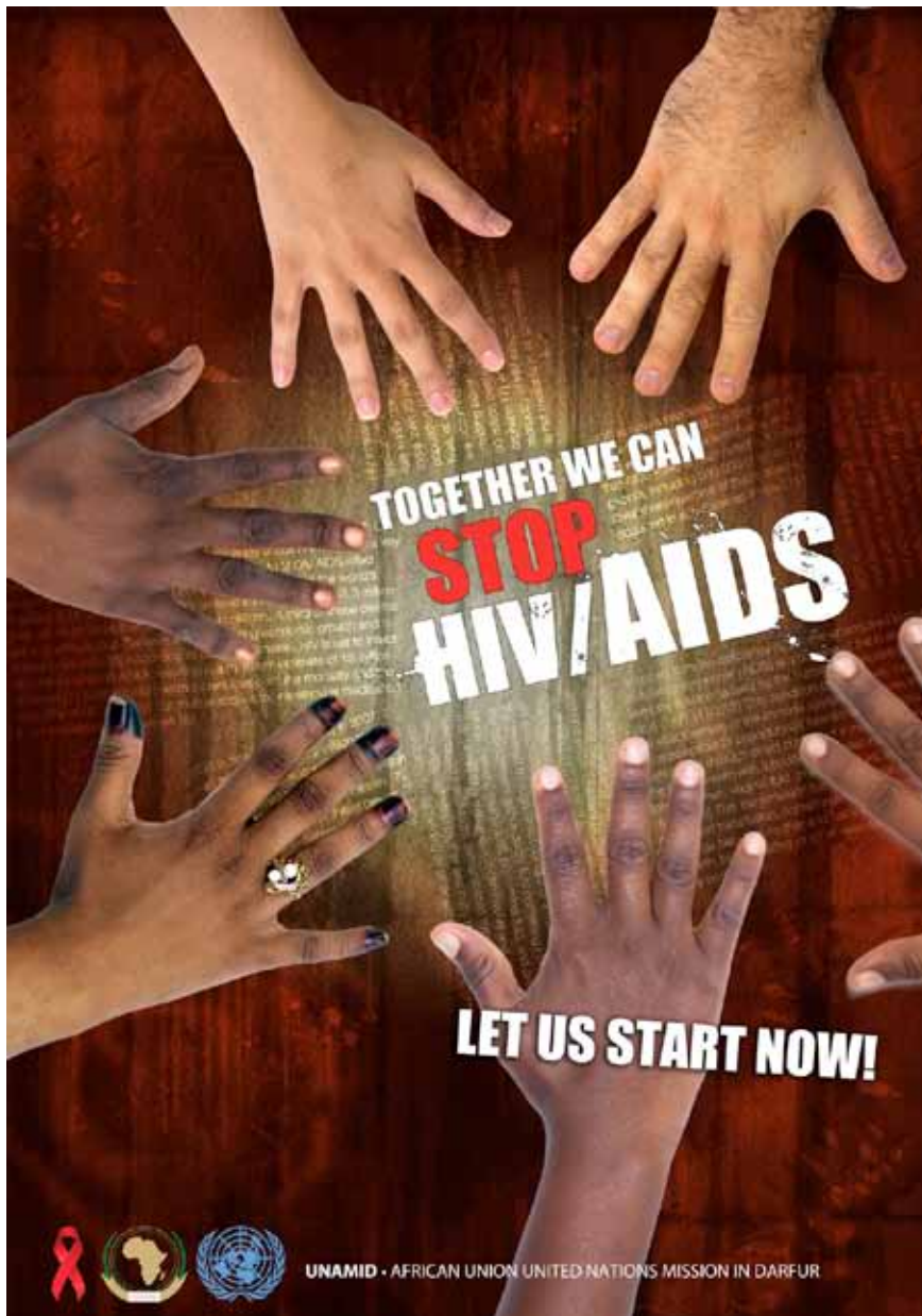
UNAMID HIV/AIDS poster