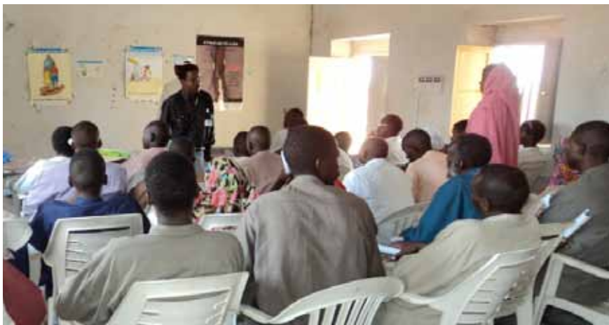
A female ex-combatant asks a question during an HIV and AIDS awareness session in El Fasher