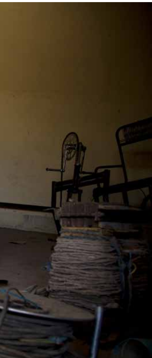
Sheikh Aldine makes crutches at the workshop of the center.