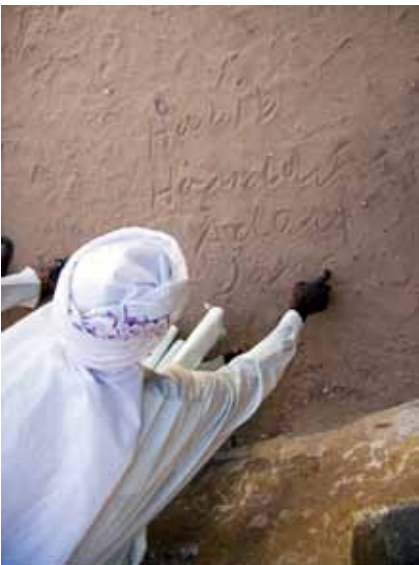
Front Cover Photo : Albert Gonzalez Farran