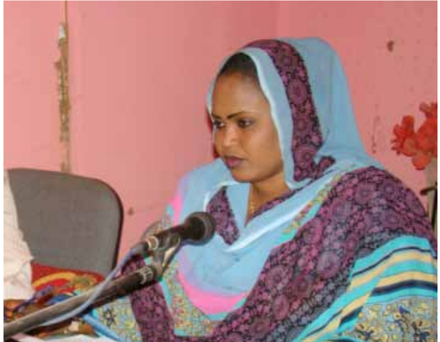
At the mike - One of the announcers at the West Darfur community radio station

The project relies on funds from UNICEF in order to achieve its specific objectives that include ensuring communities and individuals have accurate information for adopting safer and healthier practices and behaviors in favour of child survival and development, mainly in nutrition, education, water and environmental sanitation, HIV/AIDS and child protection. Programmes are produced on social activities meant to foster peace and communities are also able share and exchange ideas, views, information and