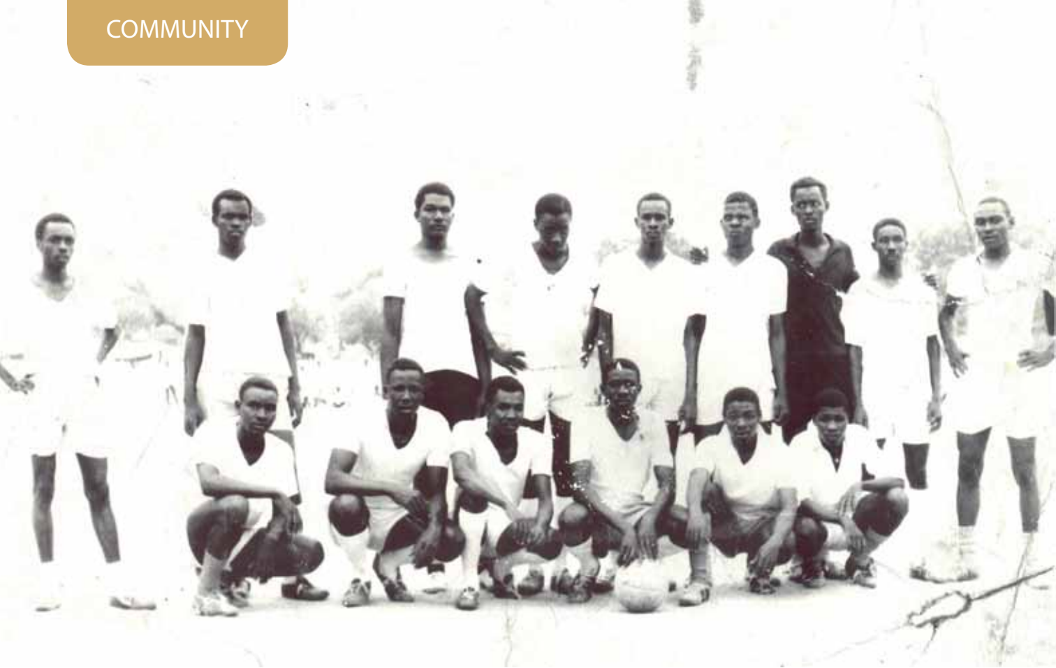
The original Altalia football team