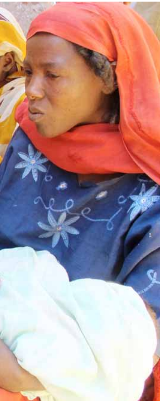
Sharing a meal at the Charity Association for Community Development.