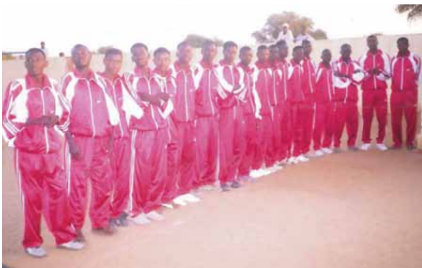
Members of the present Alitalia football team