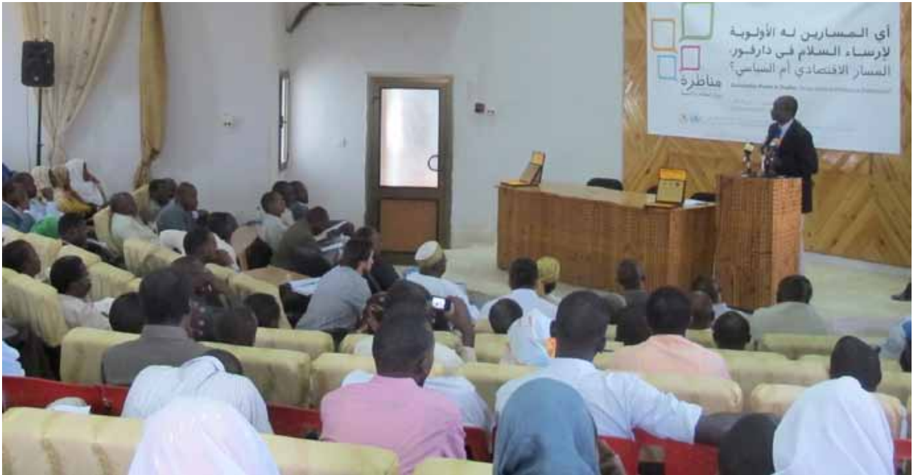
The debate at El Fasher University