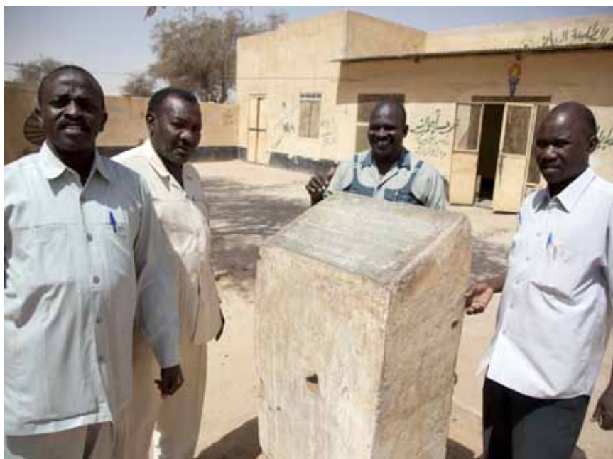
The club's headquarters in El Fasher

Presently, the club owns 2,000 square metres of land and has plans to build better administration offices, courts for basketball and volley ball, as well as an investment complex of offices and shops. The club also has a large lot of land of 20,000 square metres located North of