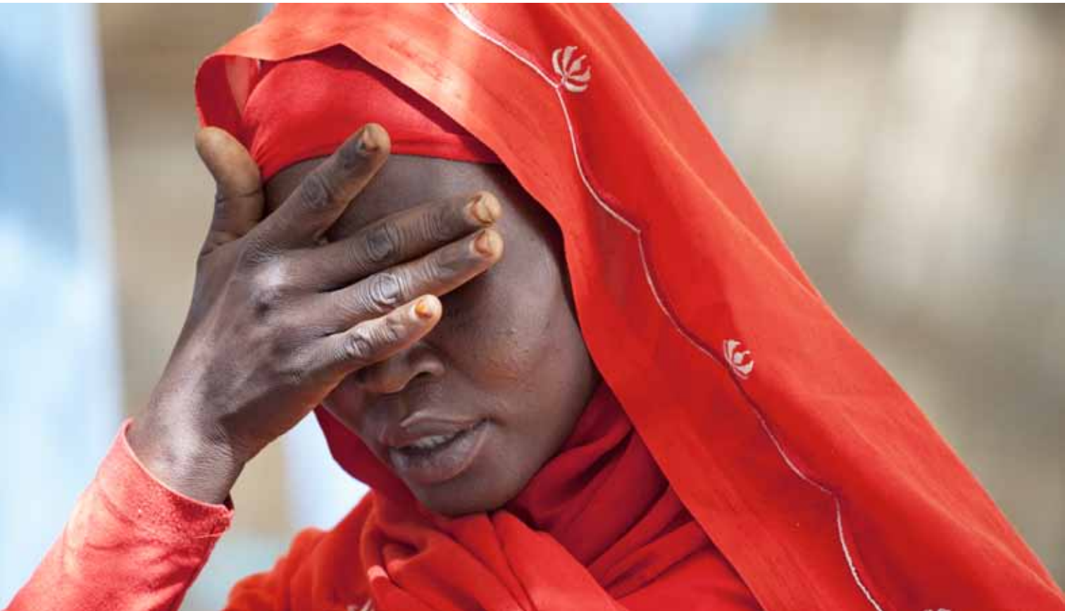
An IDP woman showing her sorrow while explaining the increase of rapes in Kassab camp.