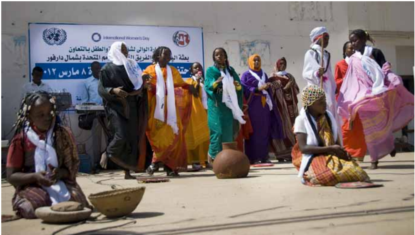
a group of school girls perform a skit at the El Fasher Women's Day event